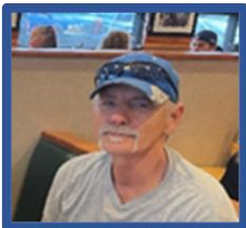
By: Historian: Wallace Bellows

Yet another nifty item for the Accessory Corner!