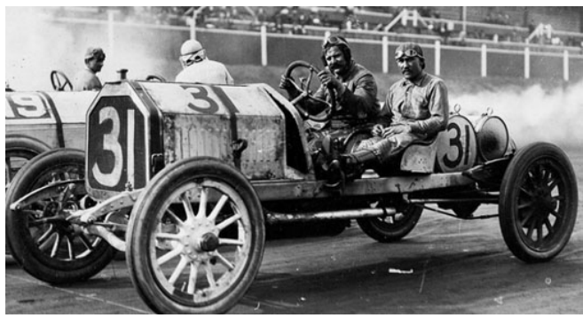
Louis Chevrolet circa 1910