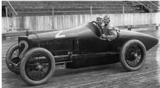
Frontenac Racecar (board racing) circa 1919