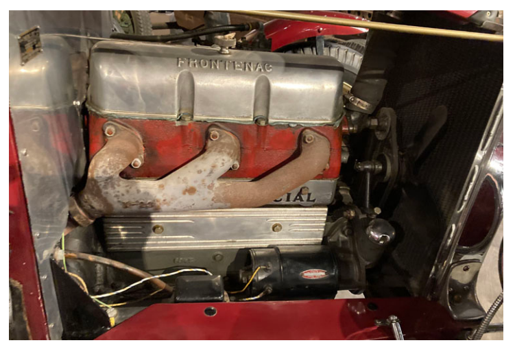
Model T Speedster with a Frontenac Head