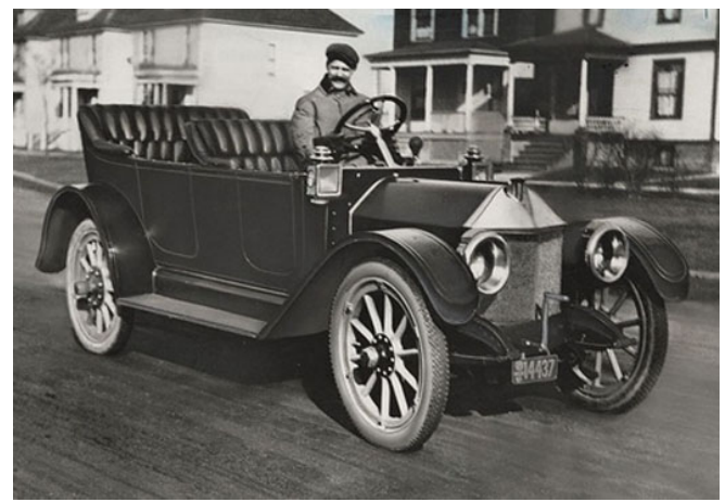
The "First" Chevrolet circa 1911