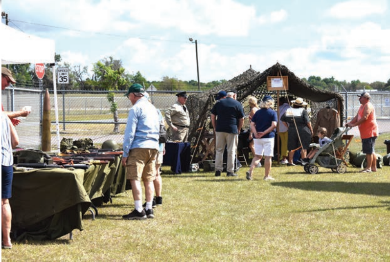
Right: There were plenty of veterans and visitors at Saturday's event.