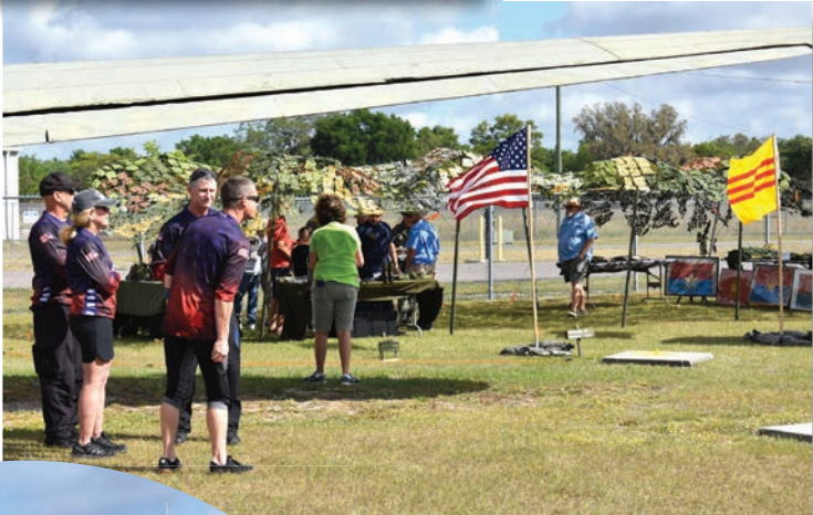
Above: Attendees, veterans and visitors stand at attention during the national anthem.