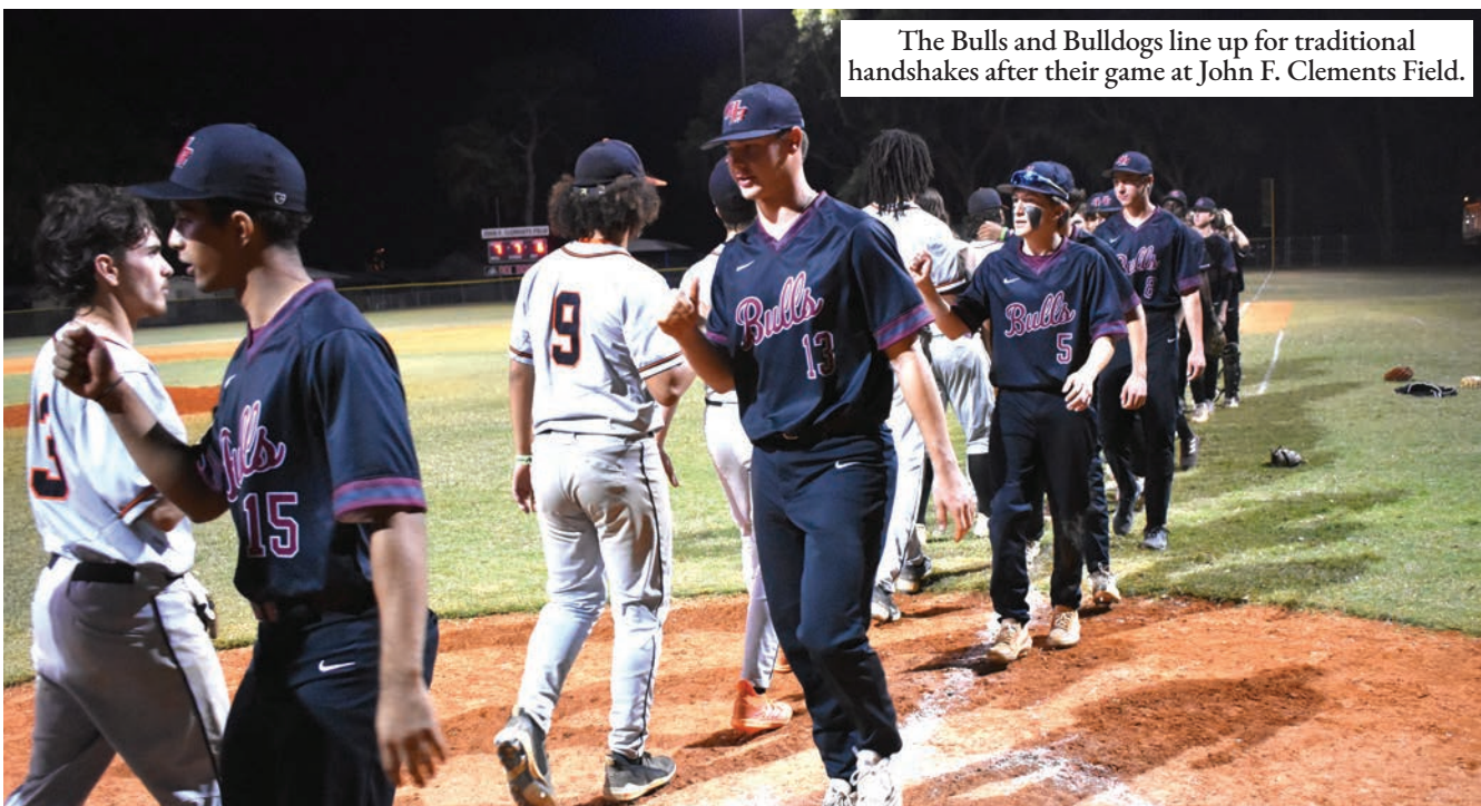
The Bulls and Bulldogs line up for traditional handshakes after their game at John F. Clements Field.