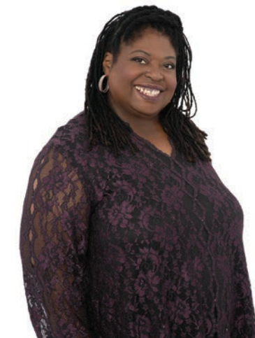
Sonya Eddy was “Epiphany” on “General Hospital”

DAYS OF OUR LIVES John made a shocking discovery. Kayla was reunited with Bo. Steve captured Megan. Ciara was upset when she found Hope and Harris together. Nicole and EJ set up Stefan and Gabi. Paulina pressured Rafe and Jada to arrest Sloan. Talia admitted to Chanel that she wasn’t completely truthful with her. Sloan helped Eric explore a new career opportunity. EJ tipped Li off about Gabi and Stefan’s rendezvous. Rafe and Jada hauled Sloan down to the station for questioning. Paulina suffered a panic attack. Eric and Nicole got into a heated argument over Sloan. Chloe braced herself when she learned that Brady had read Leo’s latest column. Rachel showed up at Statesville to confront Kristen. Leo encouraged Gwen to use Alex to make Xander jealous. Marlena had an emotional reunion with Eric and Belle. Wait to see: Steve informs Stephanie that Kayla is alive. Hope confronts Megan. Bo reveals his plans to his sister.