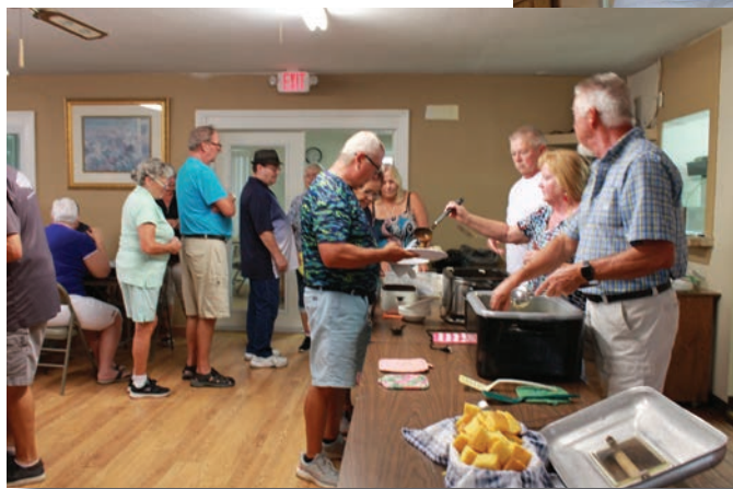
Left: residents and their guest line up for dinner.