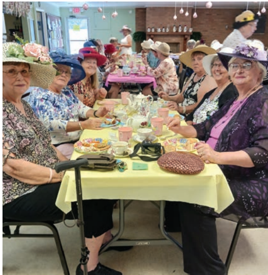
Left: Ladies at Shady Oaks Mobile Home Park deck out in their Sunday best for tea party and fashion show.