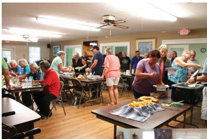
Left: Residents at Palm tree Acres Mobile Home Park enjoy a shepherd's pie dinner for $3.