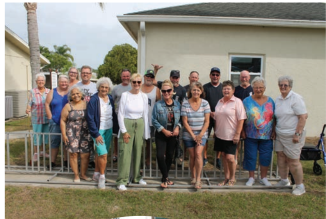
Left: Palm Tree Acres residents and volunteers who participated in the picnic games.