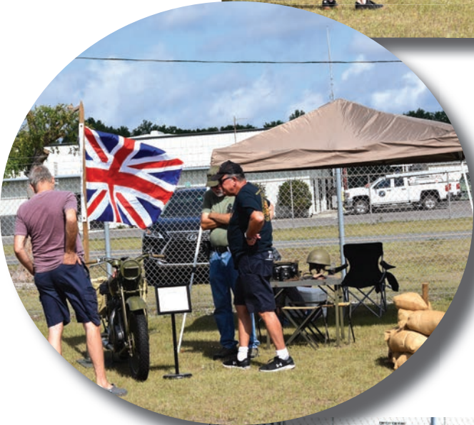
Left: People stopped by one particular tent to check out an old military motorcycle.