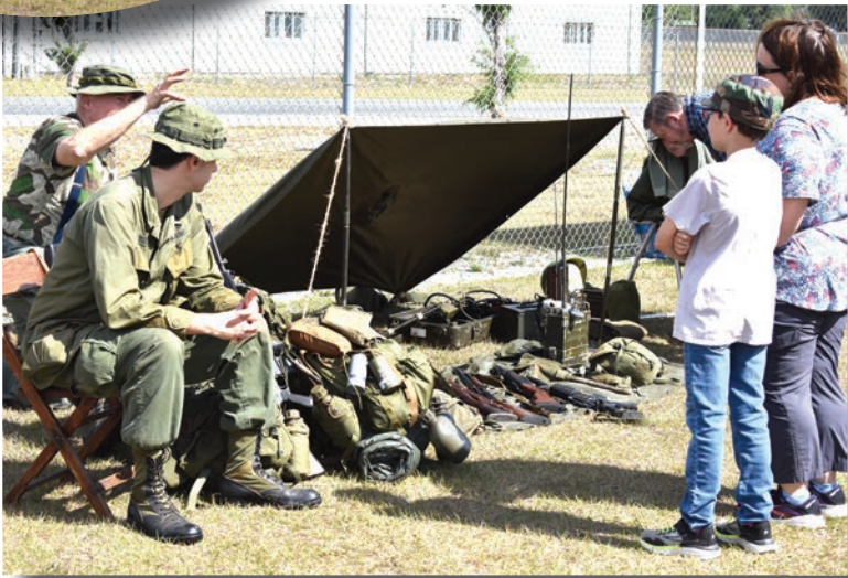
Right: Visitors gathered at this tent manned by reenactors.