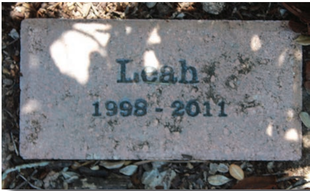
Above: A brick found in the garden during clean up from the original garden.