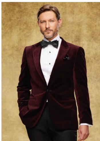
Michael Graziadei is "Daniel" on "The Young and the Restless."

DAYS OF OUR LIVES Steve and Hope faced off with Megan. Harris shared his concerns with Andrew. Stephanie was stunned when she got a call from Kayla. Brady's reunion with Marlena went awry. Paulina confronted Sloan about a threatening note she found in her office. Gwen was unhappy when Leo shared gossip about Xander and Chloe. Chanel took action against Sloan. Chloe snapped when Rachel pushed her buttons. Stefan toyed with Nicole and EJ. Gabi and Stefan met up for a secret rendezvous. Talia pushed Jada to consider dating Rafe. Paulina advised Tripp on his love life. Tripp made his move with Wendy. EJ got the ammunition he needed to take down Gabi and Stefan. Eric admitted to Abe that he was starting to have doubts about Sloan. Paulina and Sloan had another toxic run-in. Andrew transferred custody of Megan to Shawn. Wait to see: Sparks fly between Harris and Hope in Greece. Kayla informs Bo that she is unable to help him achieve his goal. Alex promises Maggie that he's about to close a big deal for Titan.