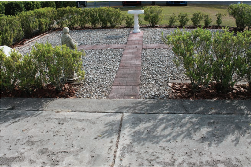
Above: St. Francis watching over the animals in St. Francis Garden.