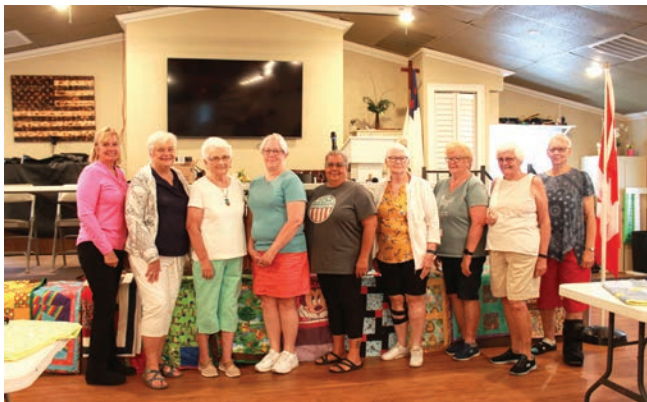
Left: Ladies at Rainbow Village RV Resort get together and make quilts every year to donate to foster children of Caterpillars to Butterflies.