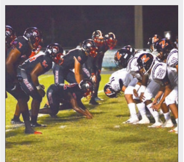
The Pirate defense stacks the line of scrimmage, anticipating a run in last year's 9-Mile War game.