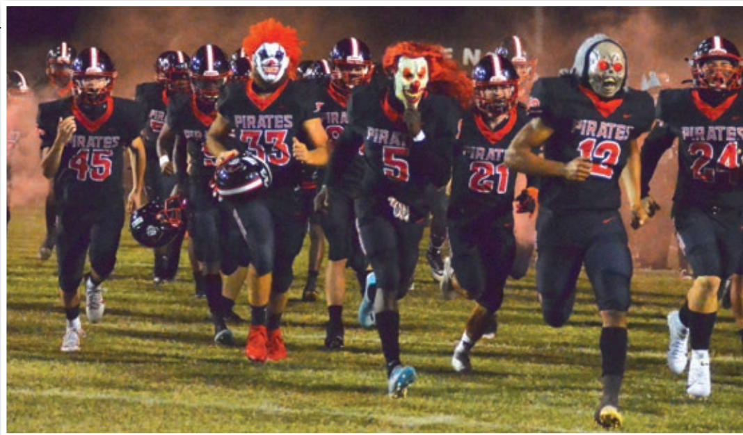
Above: A truly frightening entrance by the Pasco Pirates for the 2020 9-Mile War.