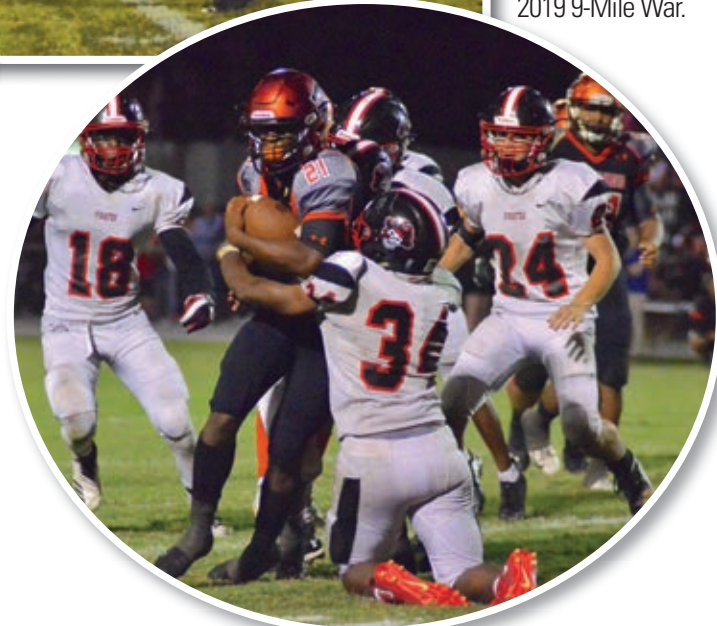
► 9-MILE WAR: From Page 1B

With a limited roster from the outset, due primarily to fewer players turning out than in previous seasons, Pasco has been beset by a slew of injuries. That has not helped matters.