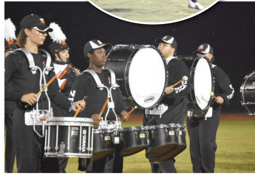
Above: Drummers for the Zephyrhills band entertain the crowd.