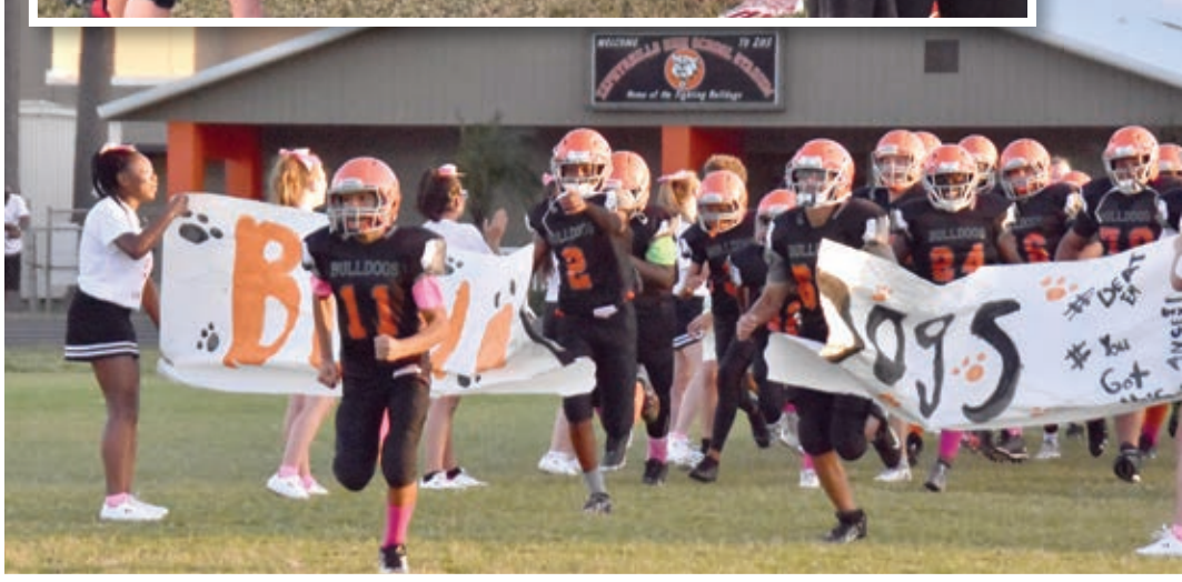
Above: The Stewart Bulldogs take the field for their last home game of the season.