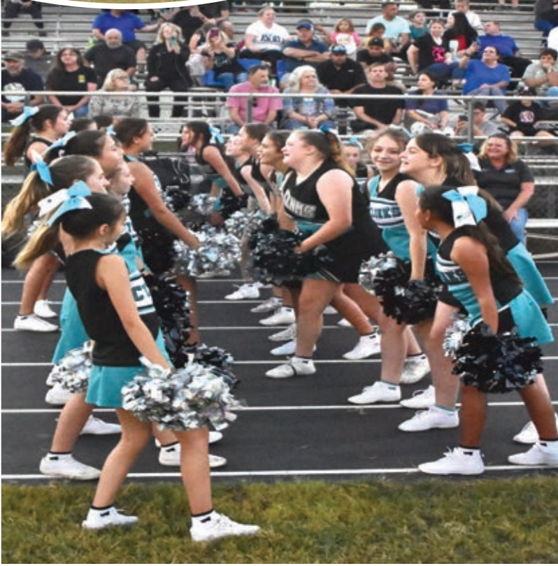
Right: The Centennial cheerleaders perform a banter routine to entertain the visiting fans.