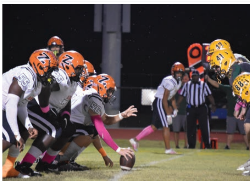
Left: The Zephyrhills offensive line gets set to run a play against the Cypress Creek defense.