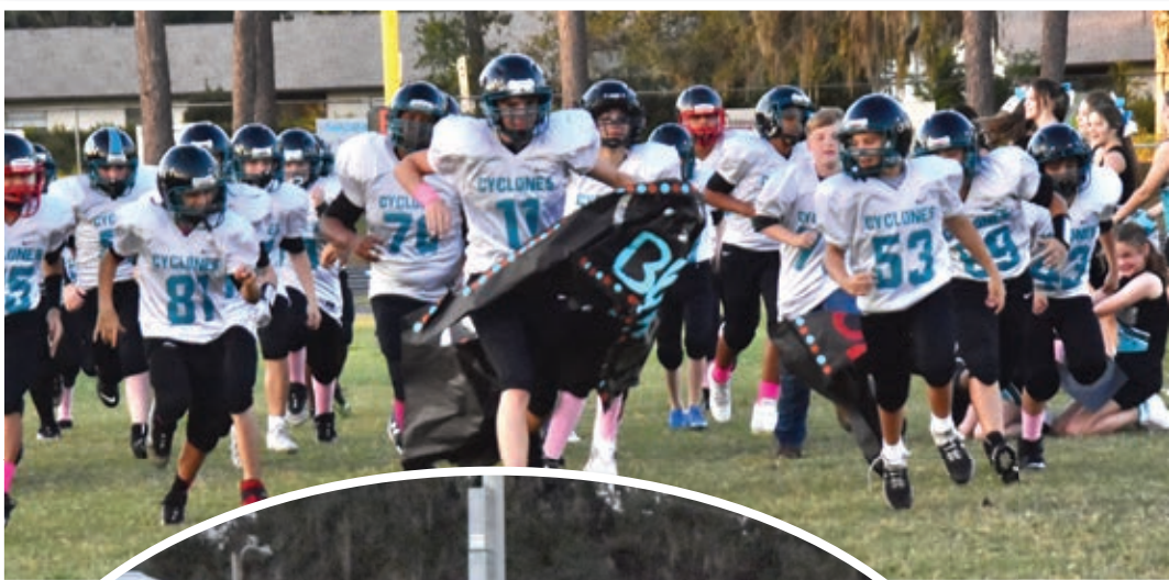
Below: The Centennial Cyclones take the field against their crosstown rival.