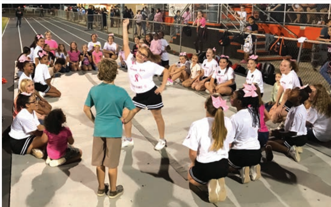
Above: The Stewart cheer team plays a game with some other students from the middle school.