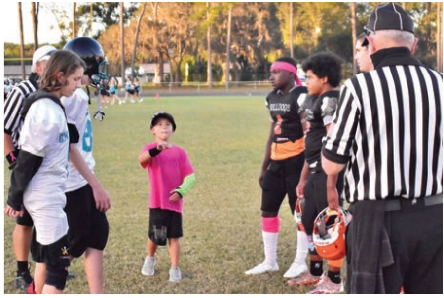
Left: Both team co-captains out at midfield for the coin toss.