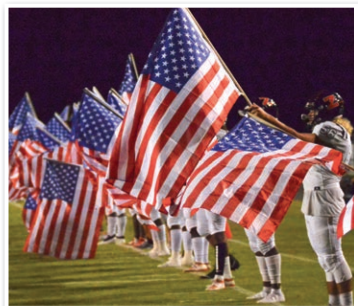
Above: Both Bulldogs and Pirates carried United States flags onto the field for the 2019 9-Mile War.

As for the series, Pasco maintains a 41-21 lead. Zephyrhills, however, has won five of the past six with the Pirates' lone win in that stretch coming in 2019.