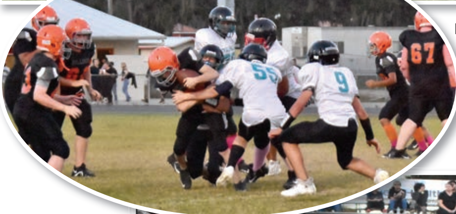
Left: Centennial defenders converge on a Stewart running back.