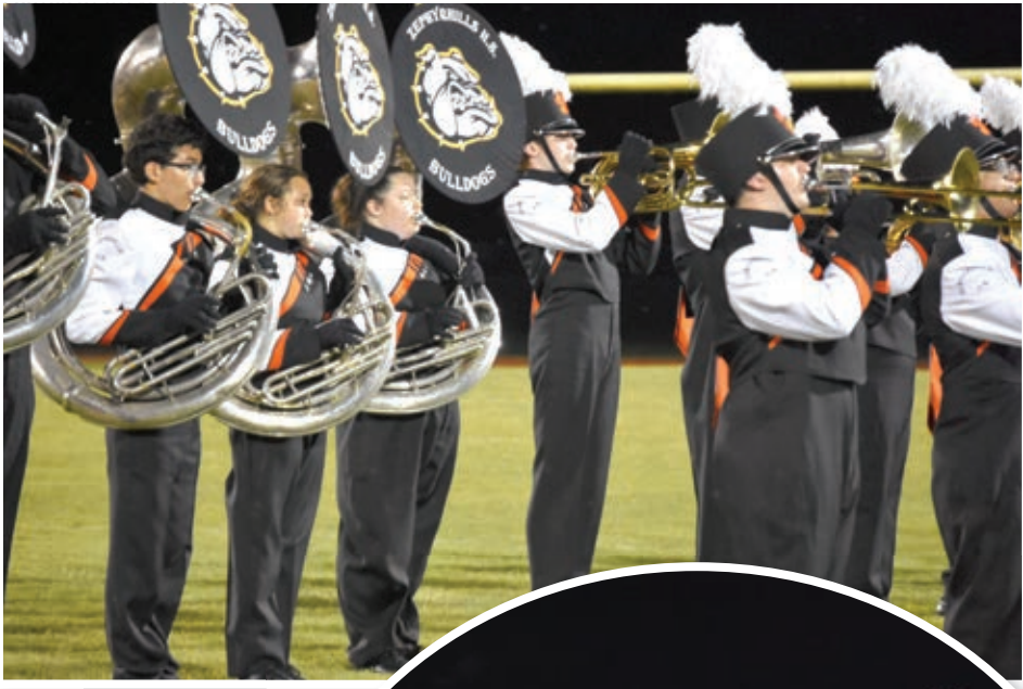
Above: The Zephyrhills Marching Band takes the field at halftime.