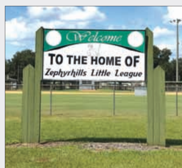
The Samuel Pasco Recreation Complex will indeed host the 2021 fall sports season.