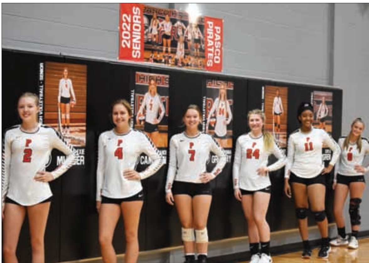
Pasco's half-dozen seniors were rewarded with a varsity win over Zephyrhills on Senior Night.