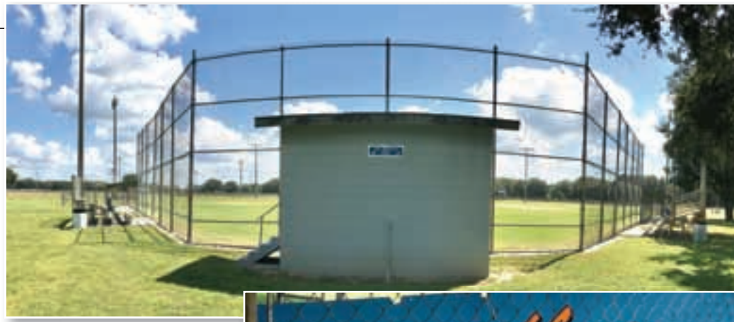
Above: With a fully-staffed Board of Directors, ZLL is looking as good as ever.