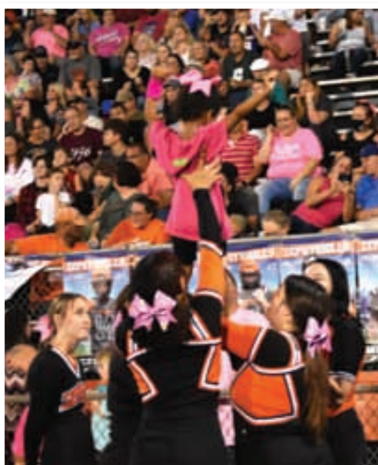
Above: Zephyrhills' varsity cheerleaders help lift a little girl in the Junior Bulldogs program during a stunt on the track in front of the stands.