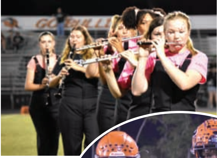
Left: The Zephyrhills High Marching Band performs at halftime.