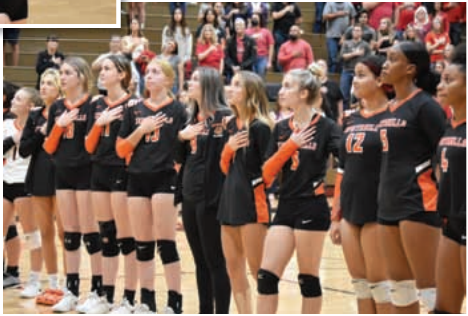
Right: The Bulldogs stand at attention for the national anthem.