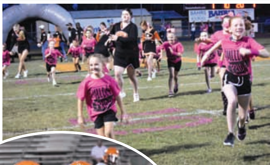
Right: The Junior Bulldogs, representing cheerleaders from the local youth league and elementary schools, run out onto the field with the varsity cheerleaders.