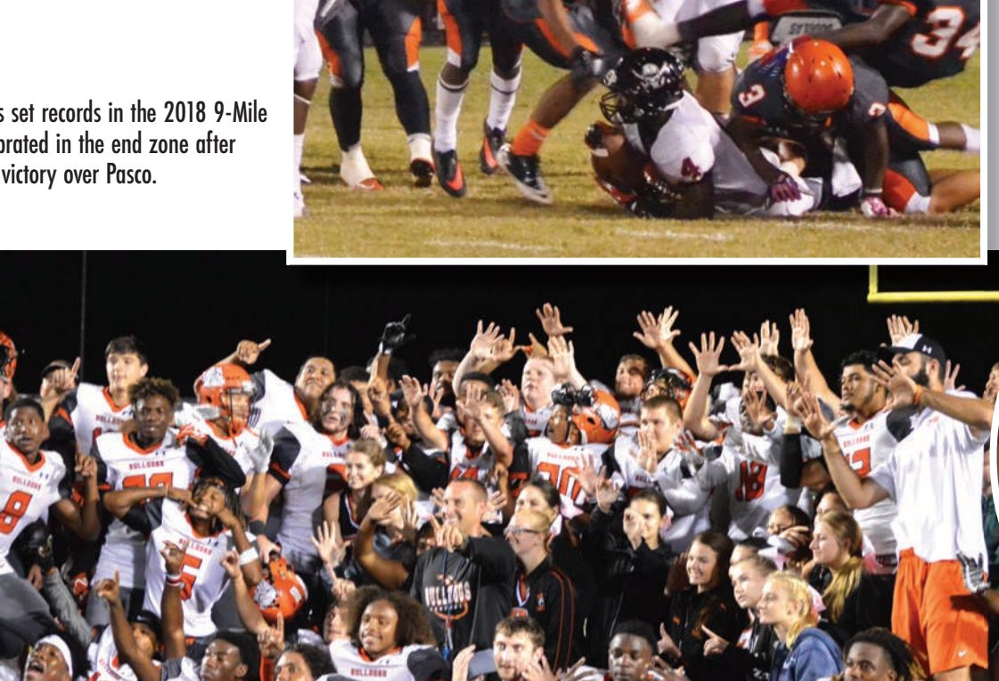
Below: The Bulldogs set records in the 2018 9-Mile War win. They celebrated in the end zone after their decisive 49-0 victory over Pasco.