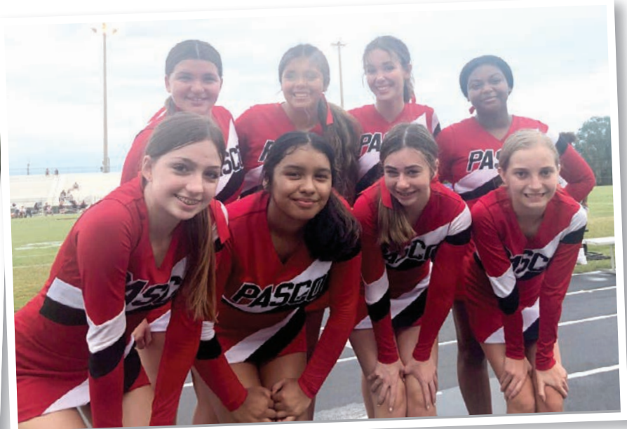
Pasco Pirates junior varsity cheer team