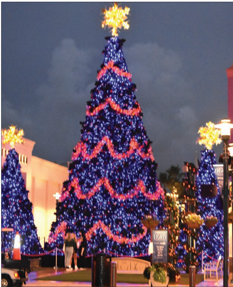
Three large Christmas trees twinkle with lights as music plays during the nightly shows.

"Let your imagination take flight as you experience this extravaganza," Dixon's voice booms over