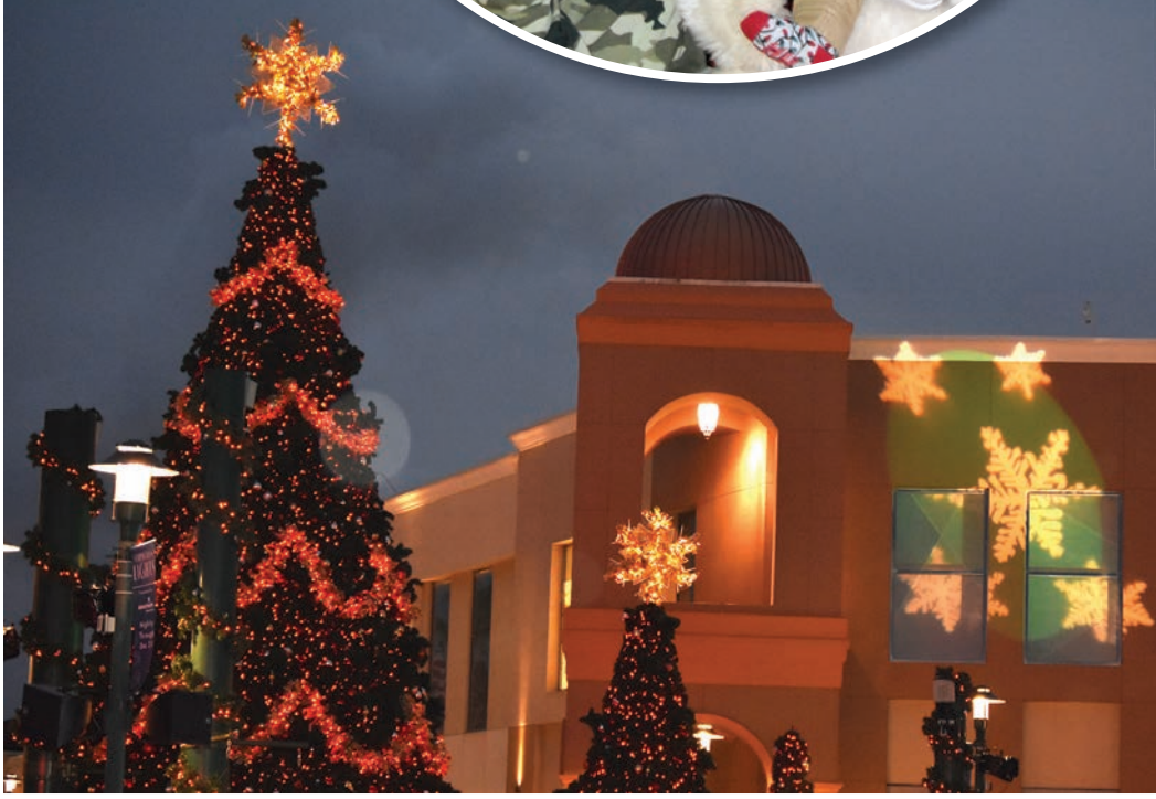
Below: Christmas trees light up in sync with music during Symphony in Lights.