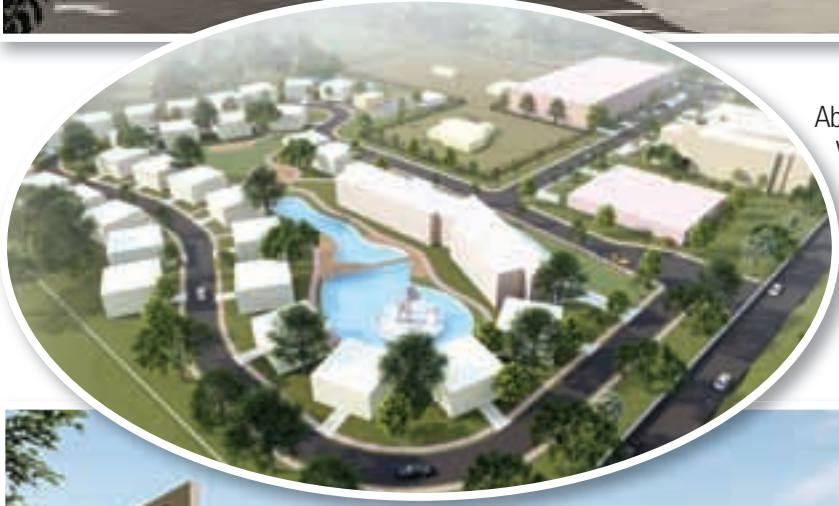
Left: An aerial rendering of the proposed athletic complex next to SVB.