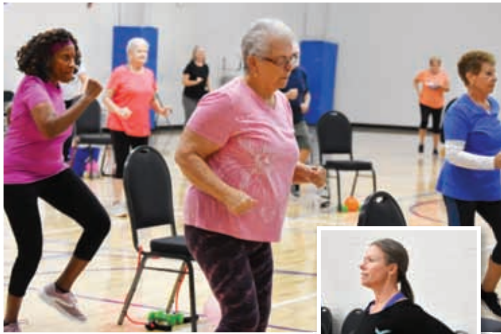
Above and below: There are plenty of regulars who attend the workout sessions geared toward keeping the area's seniors physically fit.