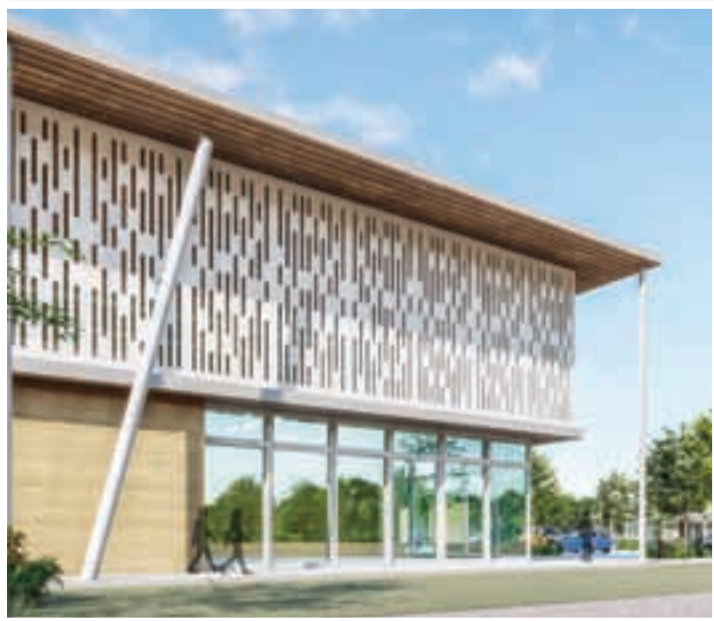
Above: Rendering of the exterior of the proposed, 30,000-square-foot indoor tennis facility.