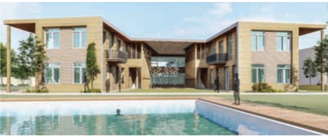
Below: The rear face of the athletic complex with swimming pool.