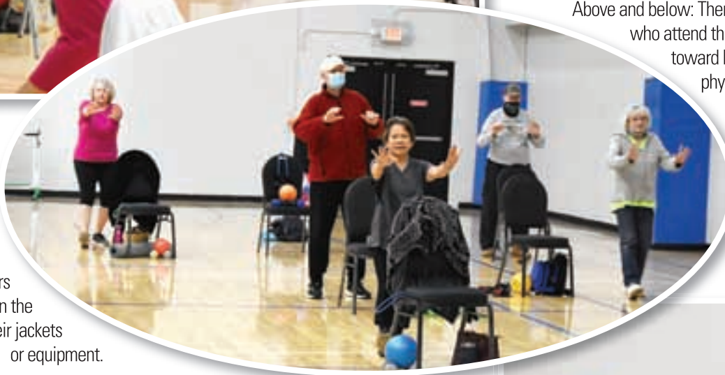
Right: As an option, chairs are placed on the basketball court during the fitness classes affiliated with the Silver Sneakers program. Some take breaks to exercise in the chairs while others use the chairs for their jackets or equipment.