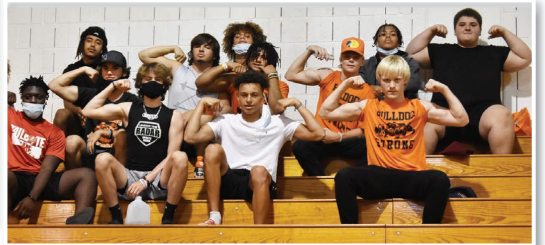
Above: Zephyrhills weightlifters take a break during last week's Class 2A, District 12 tournament at River Ridge to ham it up in the stands. In all, 14 Bulldogs are advancing to the regionals.