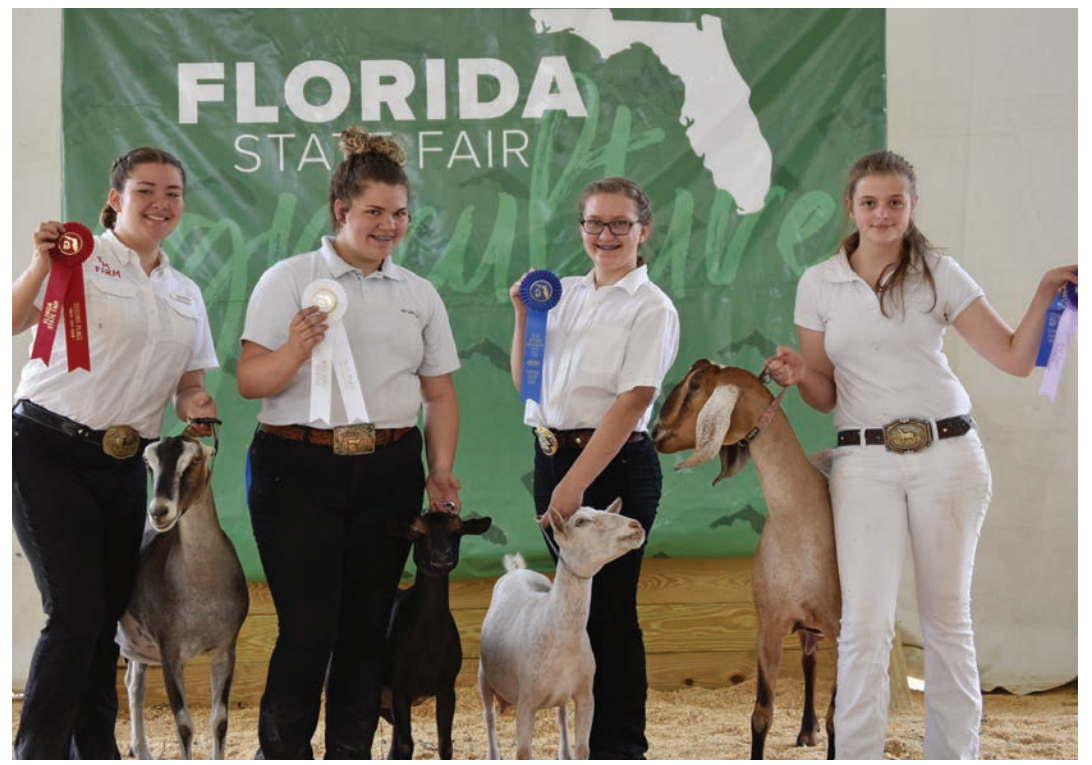
Four members of the Zephyrhills High FFA display some of their ribbons while holding onto their goats.