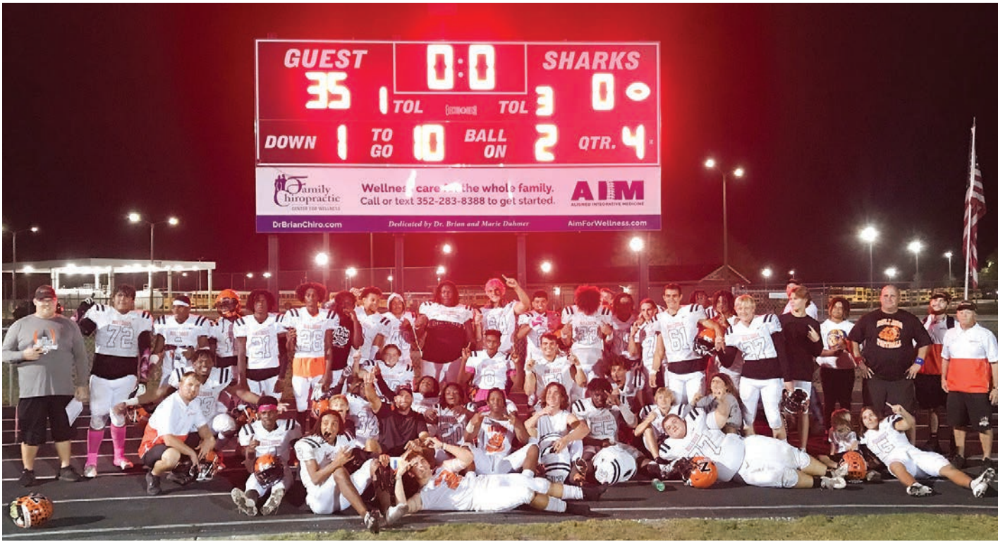
The Bulldogs pose in front of the scoreboard as the win clinches the district title.