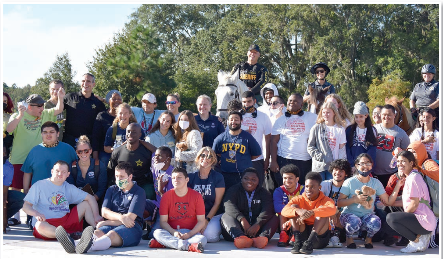
Special Olympians, law enforcement and supporters gathered for a group photo before the run/walk.