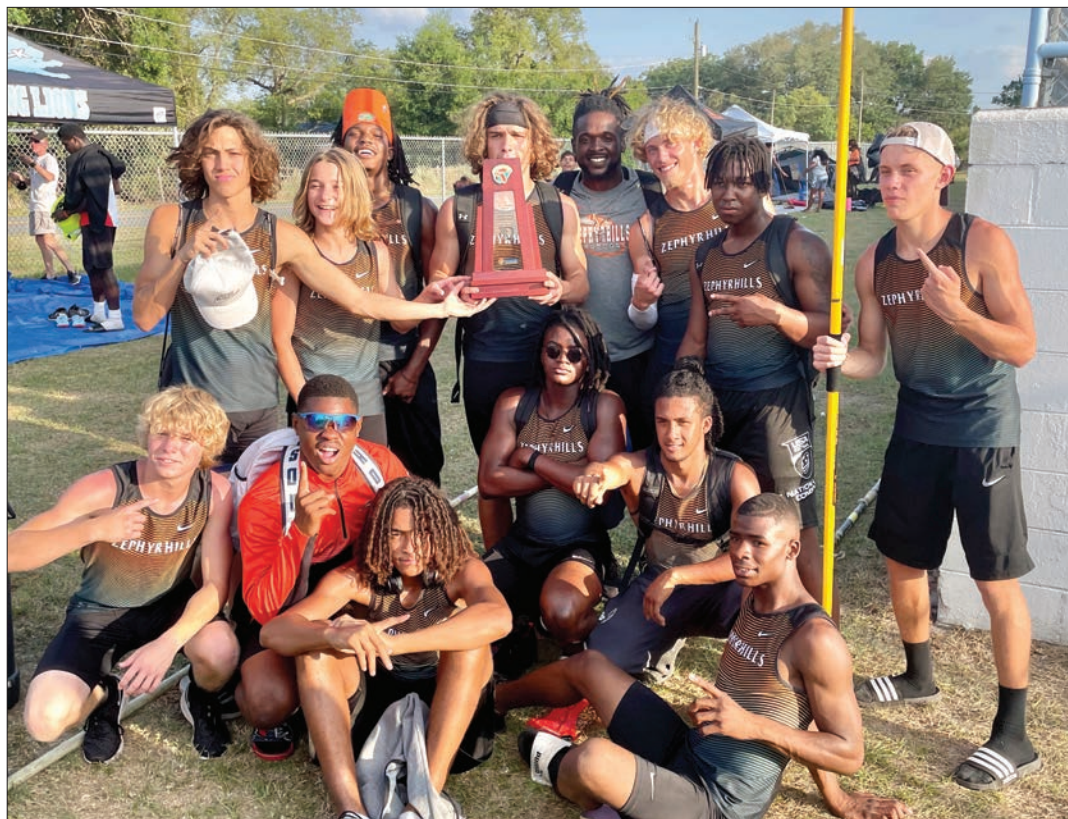
The district champion boys track team.