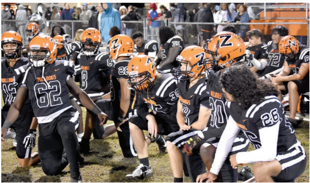
Above: Zephyrhills football players hit their knees during an injury timeout in last Friday night's game against arch-rival Pasco at Bulldog Stadium.