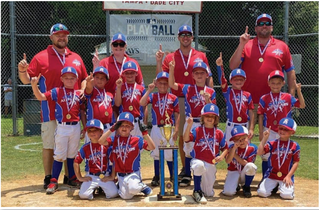
Above: The T-ball All-Stars (ages 5-6) from San Antonio won the District 6 title on their home field before advancing to the Dixie Baseball League State Tournament in Frostproof. Unfortunately, that was as far as they got in the postseason.