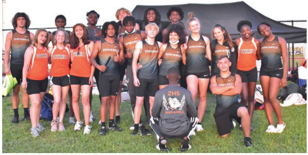
Above: The combined boys and girls teams from a meet at Cypress Creek during the regular season.