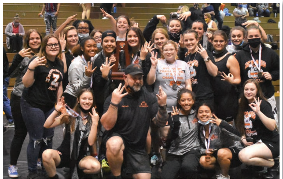
Left: The Bulldogs made it three straight district titles Friday.