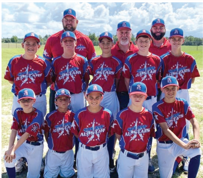
Below: The Minor All-Stars (ages 9-10) from San Antonio qualified for the state series as a district runner-up. They played in the state tourney at Sebring and placed third. They were the only San Antonio All-Star team to crack the top three at the state level.

Right: San Antonio's Ozone All-Stars (ages 11-12), which is the Majors in other leagues, earned a state berth as a district runner-up. That squad, however, lacked enough players to take part in the state tournament.