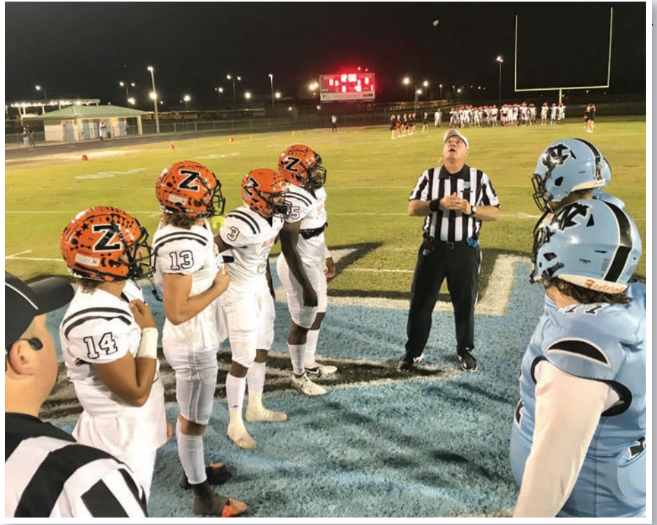
The opening coin toss for the Bulldogs/Sharks matchup.