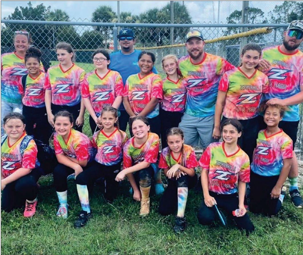
The minor softball all-stars from Zephyrhills went 2-2 in last weekend's state tournament at Rockledge.