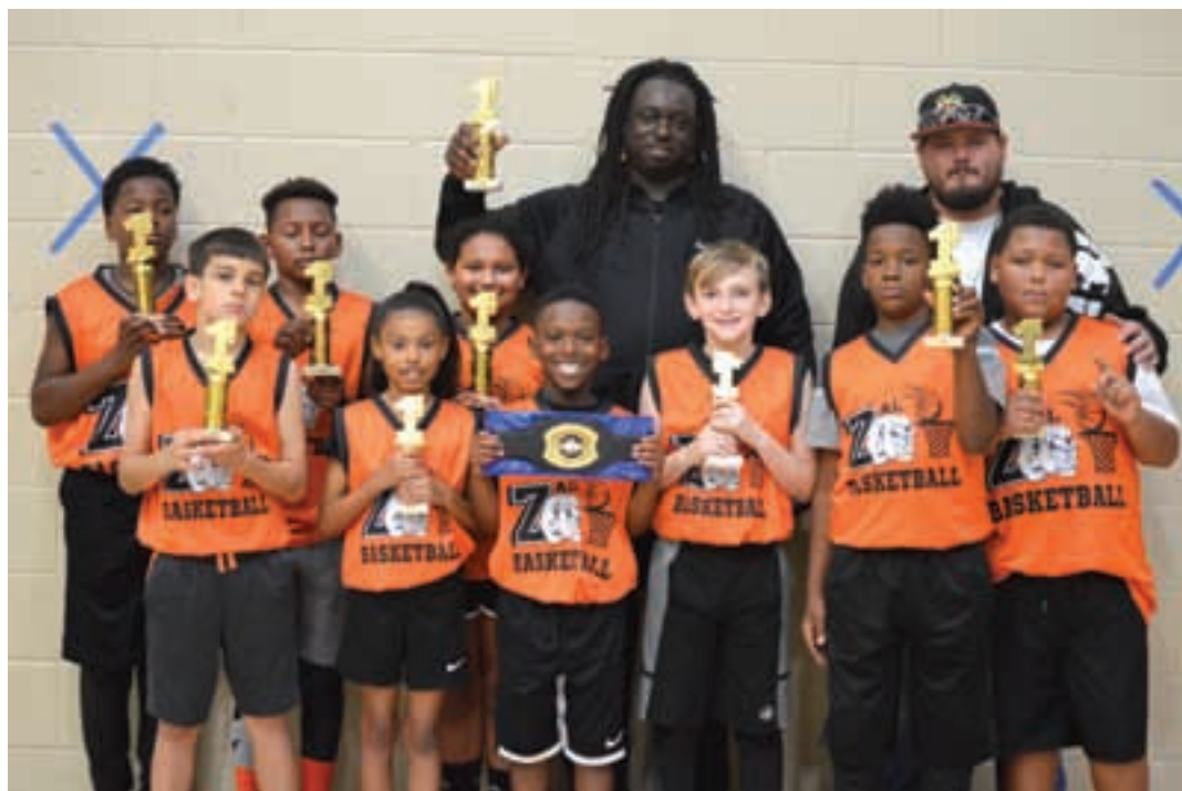
The AdventHealth Zephyrhills team celebrates with their trophies after winning the Division II championship.