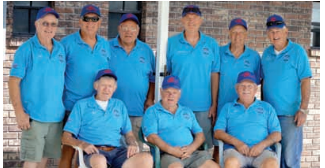
Sweetwater/Settler's Rest captures the championship as a first-year team in the Zephyrhills Winter Horseshoe League.

First-year team clinches Zephyrhills Winter Horseshoe League title with season sweep of arch-rival