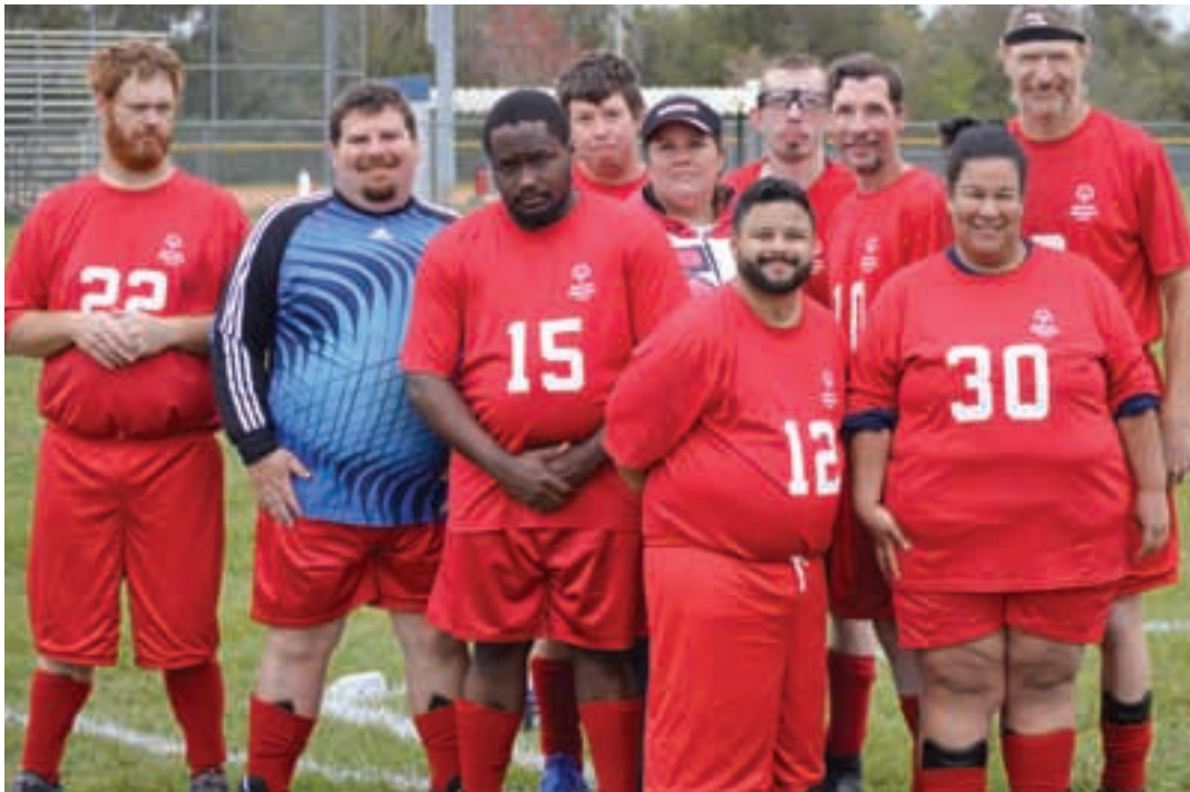
The East Pasco Bombers, most of whom are from Zephyrhills, took on the Wiregrass Ranch Bulls in a soccer game.