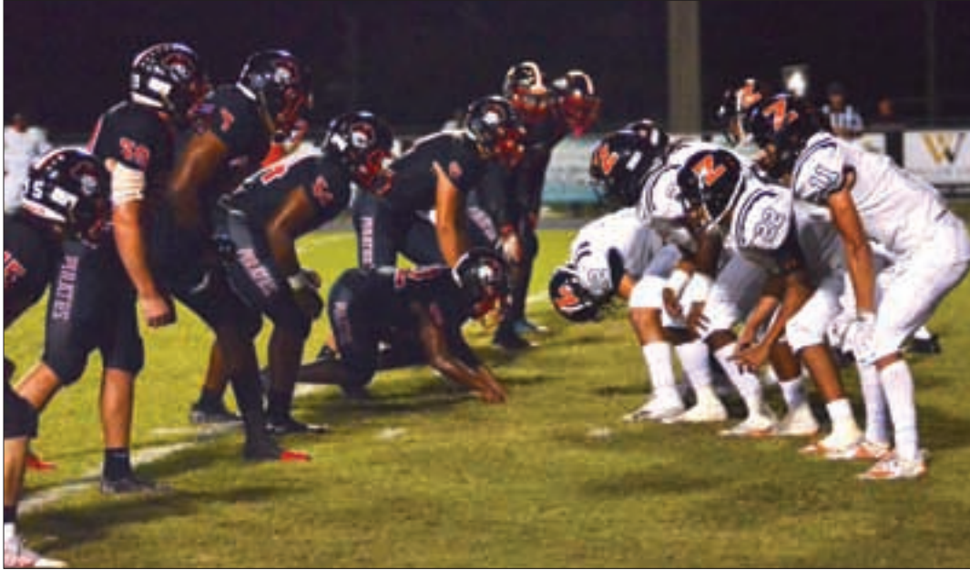
The Pirate defense stacks the line of scrimmage, anticipating a run during the 9-Mile War. ANDY WARRENER

The Bulldog defense helped foster the utter collapse of the Pirate effort in the 9-Mile War