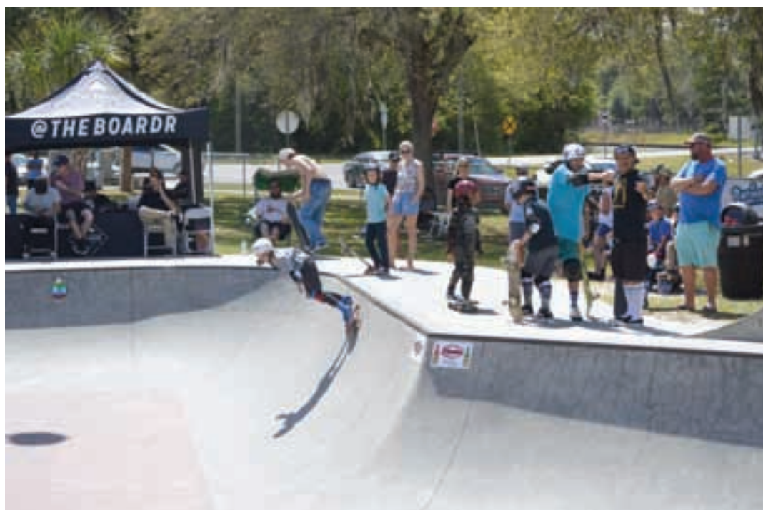
Young and old alike competed in the Grind for Life Series, which returned to Zephyrhills for a fifth straight year.