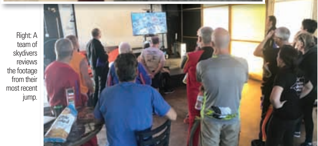
Right: A team of skydivers reviews the footage from their most recent jump.