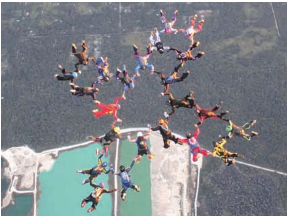
An aerial view of a 23-person formation coming together at the 2018 competition.

Already established as a world-renowned drop zone, Skydive City is bringing some of the top divers and elite events this fall