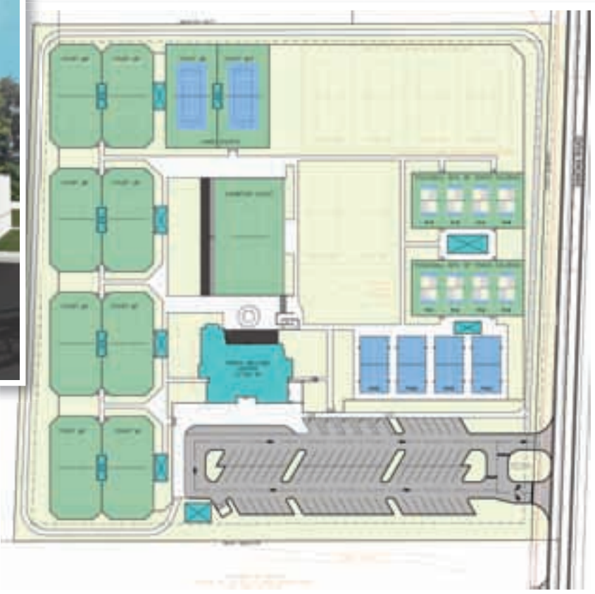
Above: Shown is an artist's rendition of how the tennis center and complex will be laid out when the project is completed.