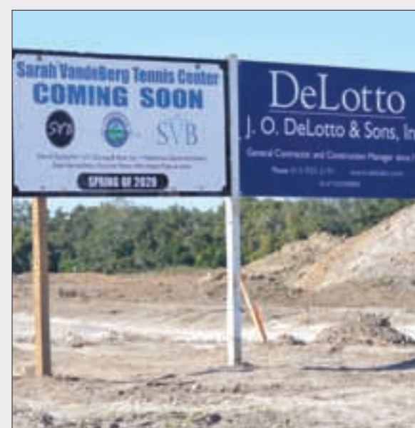
Signs let people know that the project is under way.