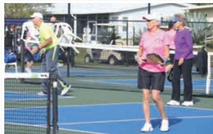
Above: Players fill the pickleball courts during morning play.

Aside from Betmar and the planned courts at the new tennis facility being built off Simons Road, pickleball also is played on the tennis courts at Zephyr Park.