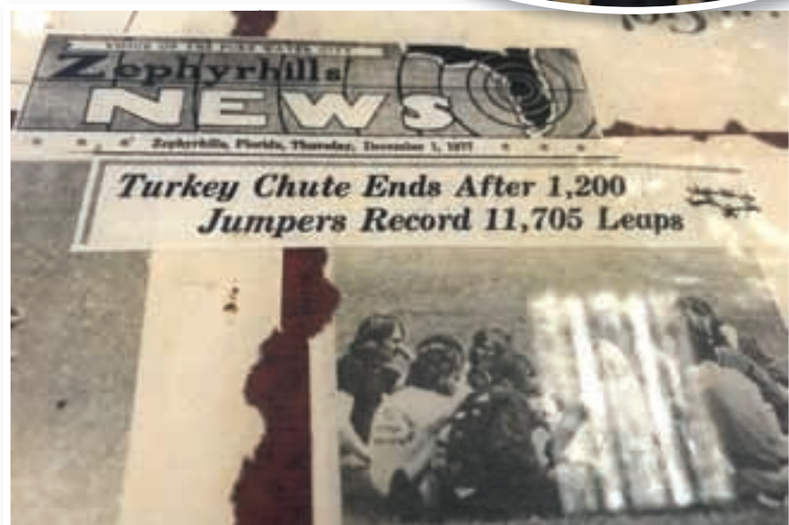
Left: A newspaper article from 1977 in The Zephyrhills News chronicles one of the first Turkey Chute events.