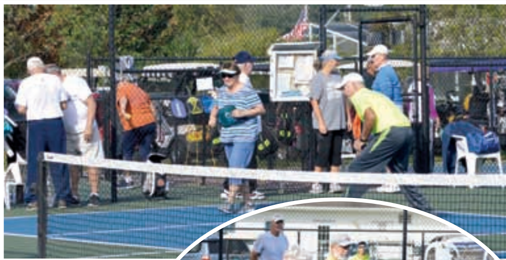
Above: One player gets low to return the ball as his teammate watches during a recent game.