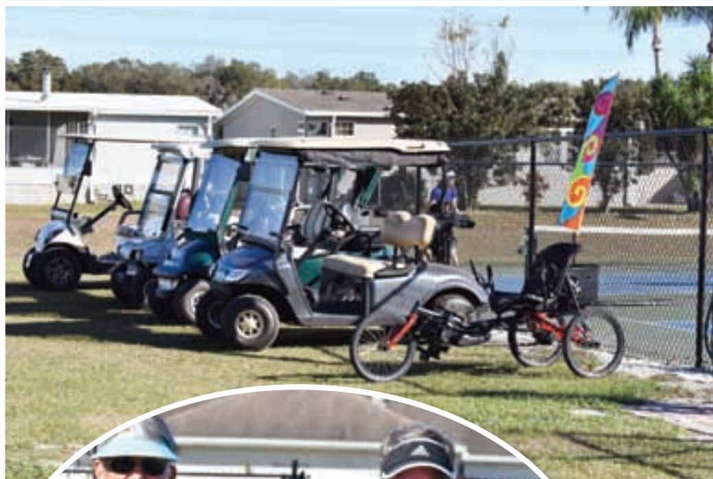
Above: Golf carts and bicycles are popular ways to get to the pickleball courts.