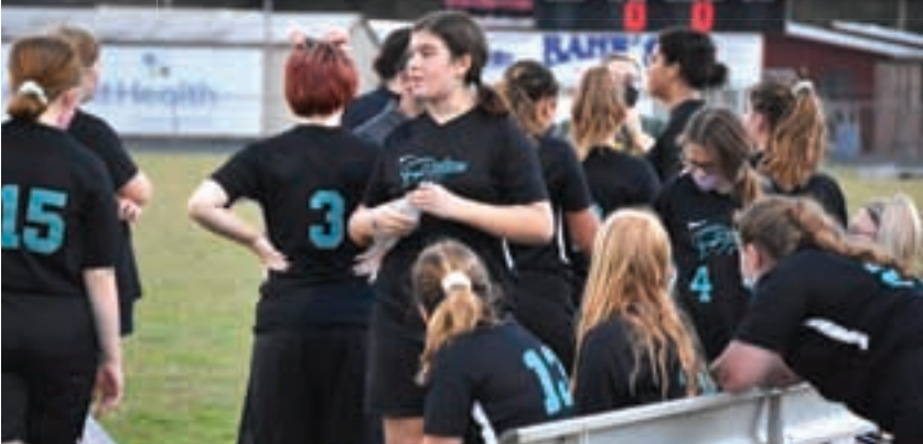
Left: Centennial Middle players gather at the team bench during a timeout in last week's game against longtime rival Stewart at Bulldog Stadium.