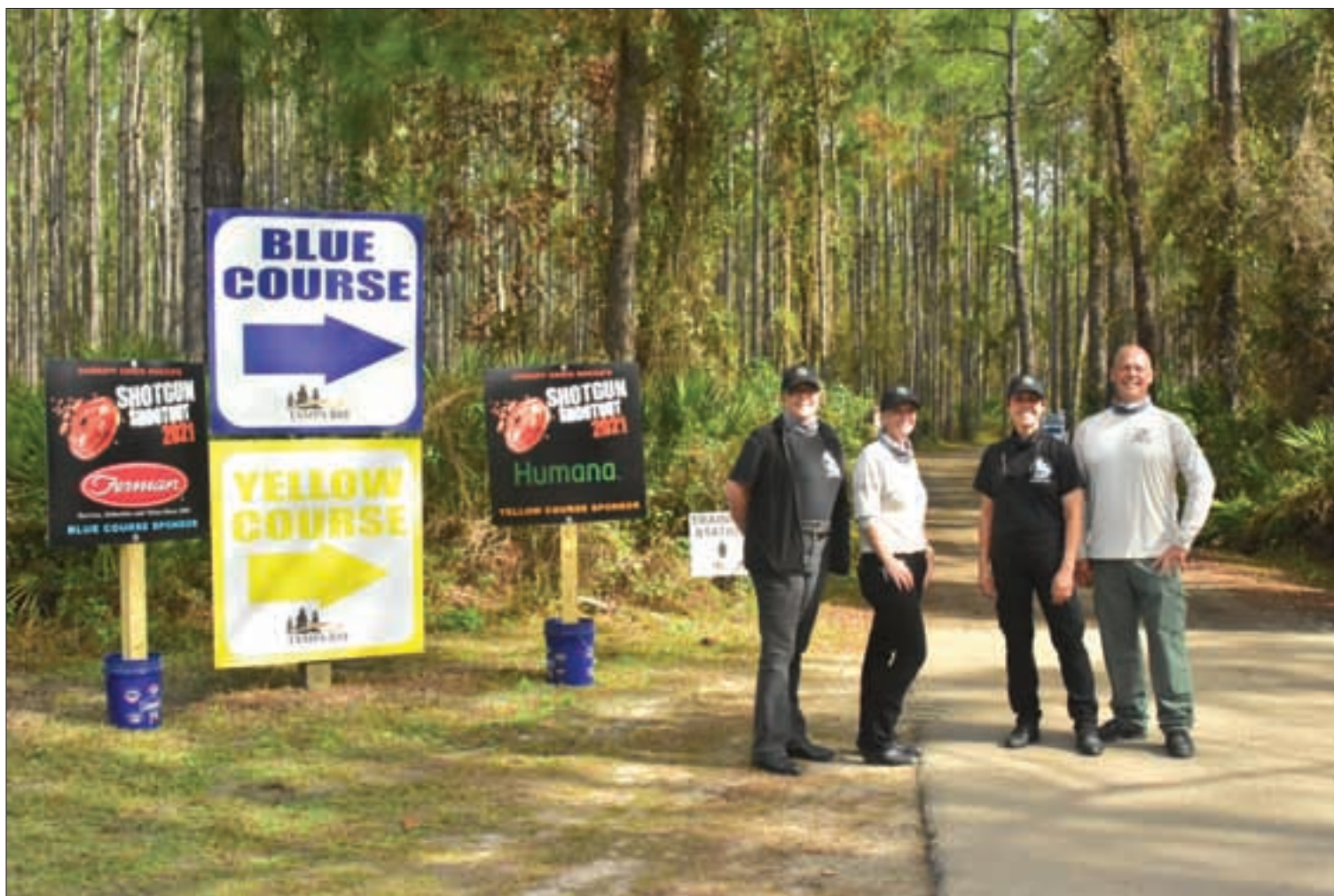
Members of the Pasco Sheriff's Mounted Posse posted near the trail entrance as they collect shooters' scorecards.

A much reduced event over years past, continued on and delivered their promise to local charities