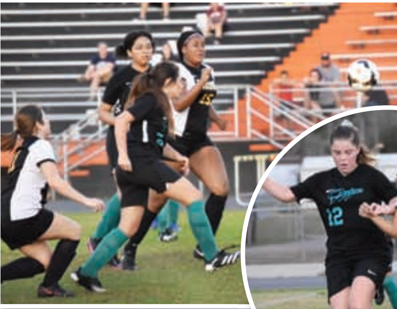
Left: Players from both teams scramble for a loose ball in the middle school girls soccer game.