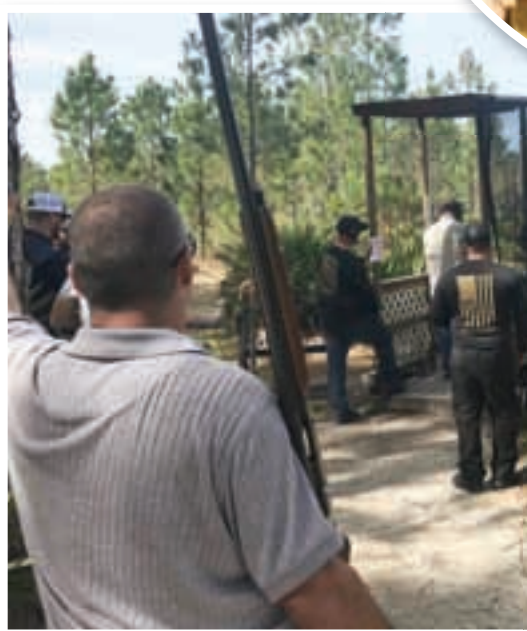
Above: Teams of four competed on one of the five courses at Tampa Bay Sporting Clays.