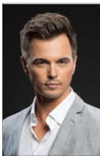
Darin Brooks stars as "Wyatt" on "The Bold and the Beautiful"