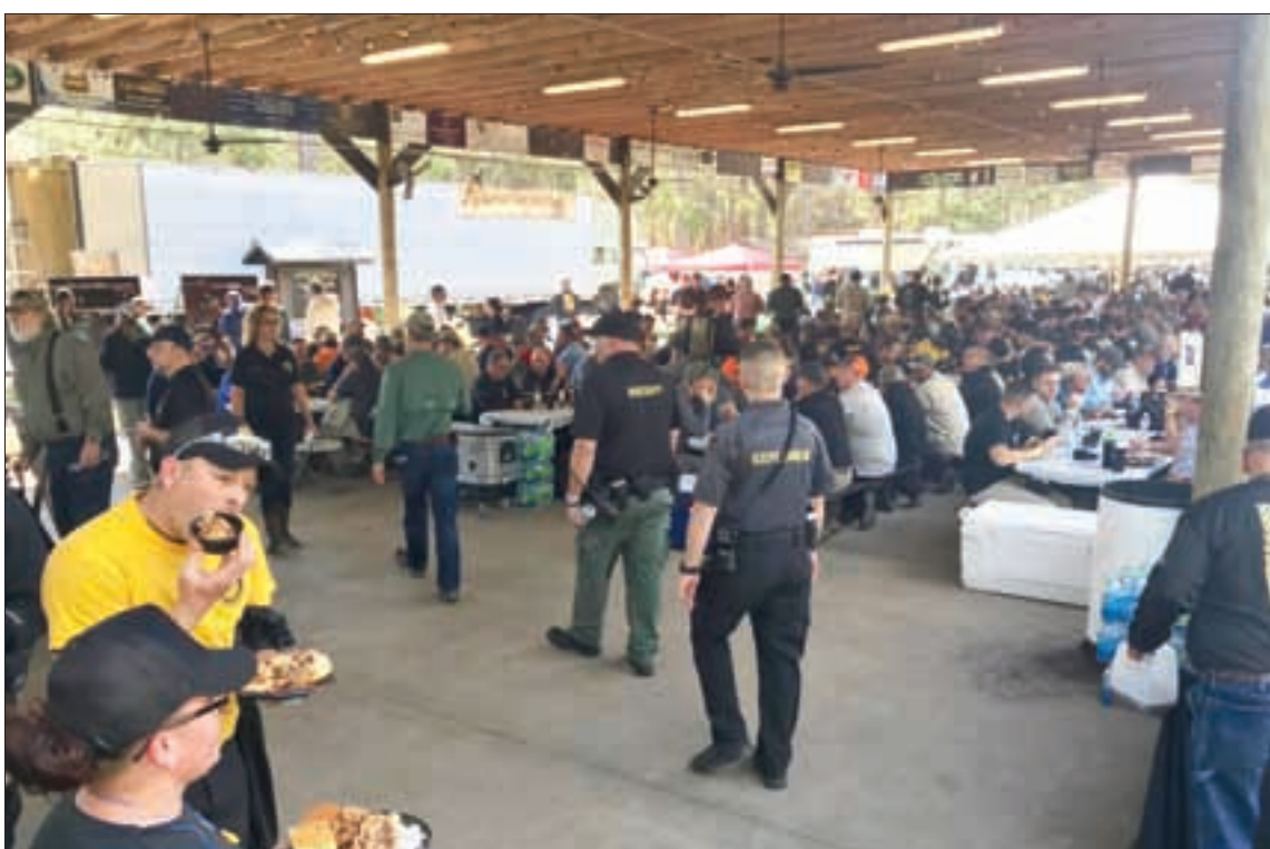
The lunch provided by Mission BBQ was a hearty one and filled the pavilion at Tampa Bay Sporting Clays.

2019 Tampa Bay Sporting Clays' Shotgun Shootout draws skeet and trap shooters from all over Pasco County and beyond to unite for a great cause