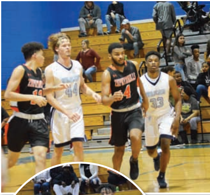
Left: A pair of Bulldogs and two players for the Wildcats battle for inside position during last week's district semifinal game hosted by Anclote. Zephyrhills eliminated Wesley Chapel in that round of the tournament.