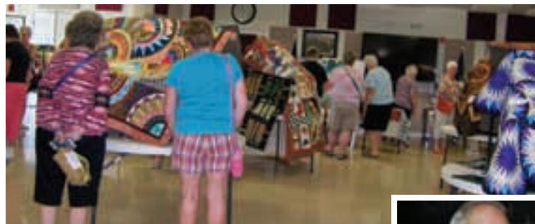
Left: A crowd of people just enjoy looking at the quilts during the quilt show at Grand Horizons.