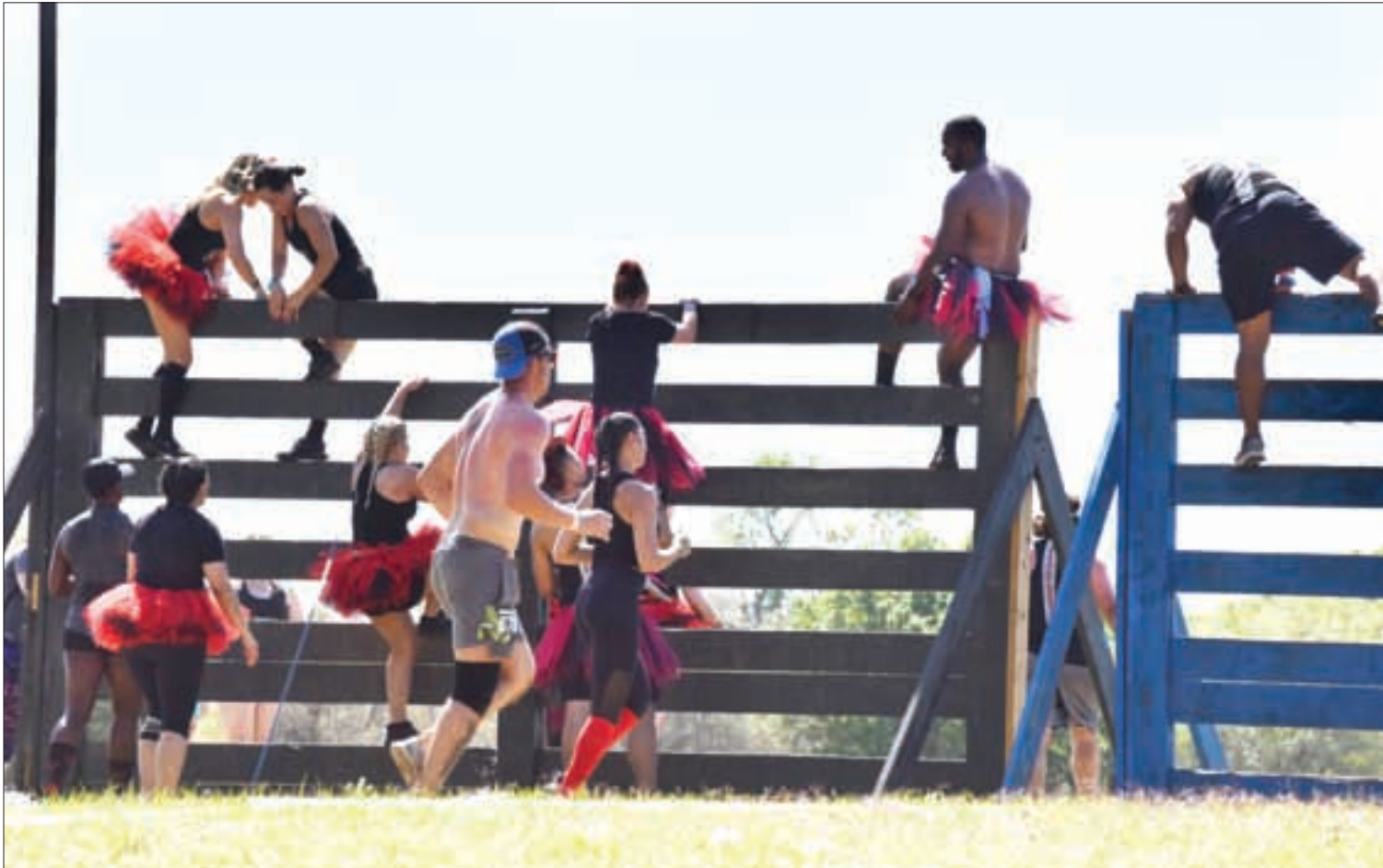
A group of competitors, some in decorative tutus, climb over an obstacle on the course during Saturday's race.

Little Everglades Ranch hosts weekend races with numerous obstacles and three distances