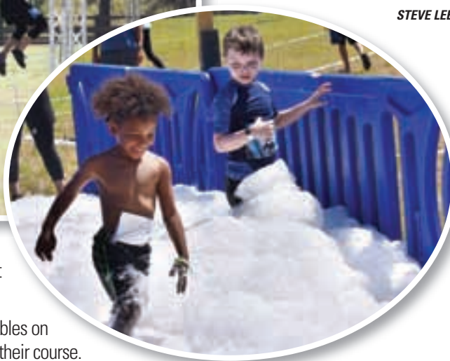
Right: Two boys shuffle through bubbles on their course.