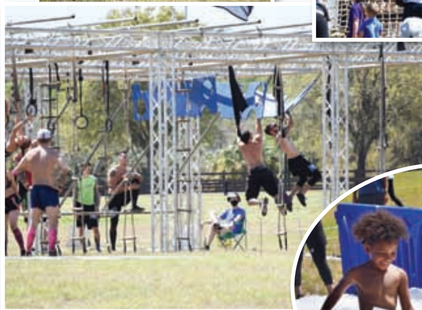
Above: Not everyone was able to hang on to complete the above obstacle, but at least these two guys made it.