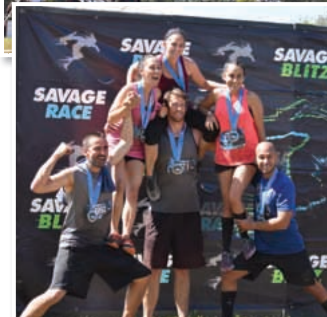
Left: Male and female members of the Fried Friday team from Orlando made a human pyramid while posing for a group photo in front of the Savage Race banner.