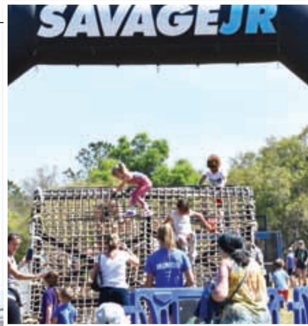
Above: Young boys and girls climb up and over a wire obstacle near the end of the Junior Savage Race.