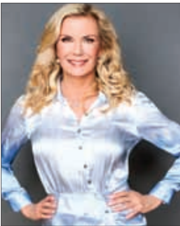
Katherine Kelly Lang stars as "Brooke" on "The Bold and the Beautiful."

THE BOLD AND THE BEAUTIFUL Hope received miraculous news from an unexpected source. In a magical and romantic moment, Steffy found her happily ever after. Hope shared some life-changing news with Liam. Steffy was swept up in how her journey changed for the better.