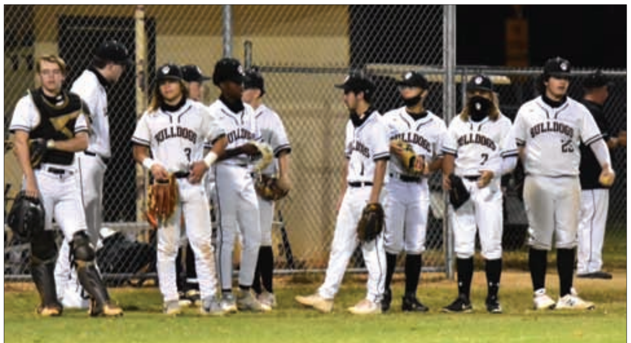
The host Zephyrhills Bulldogs line up for pre-game introductions before cruising to a win over Tenoroc.