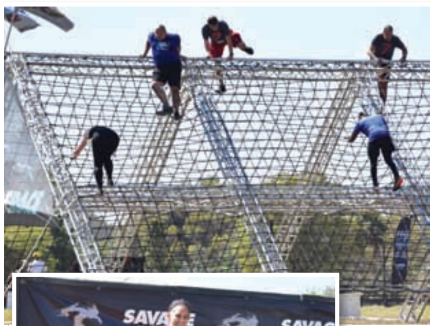
Left and right: Competitors climb over some of the 27 obstacles on the course.