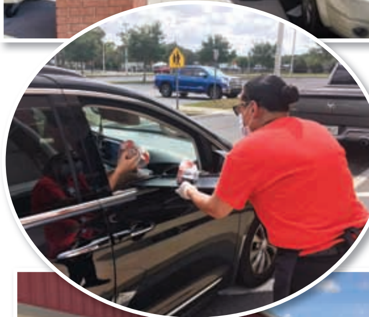
Left: Pasco schools opened seven locations for students to pickup pre-packaged meals this week.