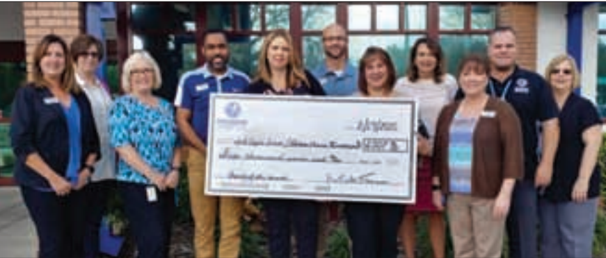
Thomas Promise Foundation and Red Apple School receive a check from the Pasco County Tax Collector's Office employees.

The January Charities of the Month at the Pasco Tax Collector's Office received over $6,000