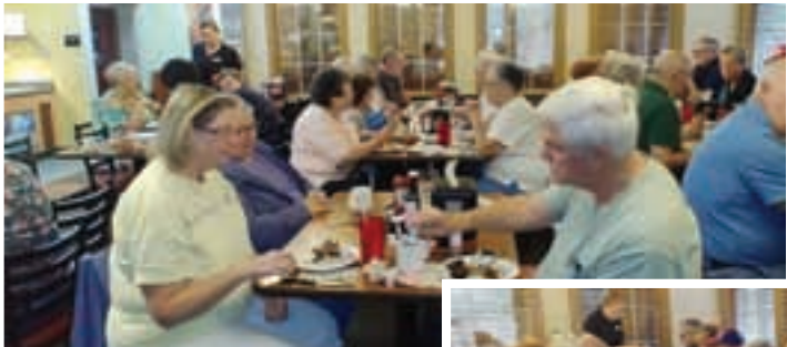
Right: Ramblewood Village residents get together for breakfast at the Golden Corral.