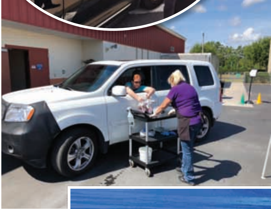
Left: Workers at New River Elementary distribute packaged meals on Monday.