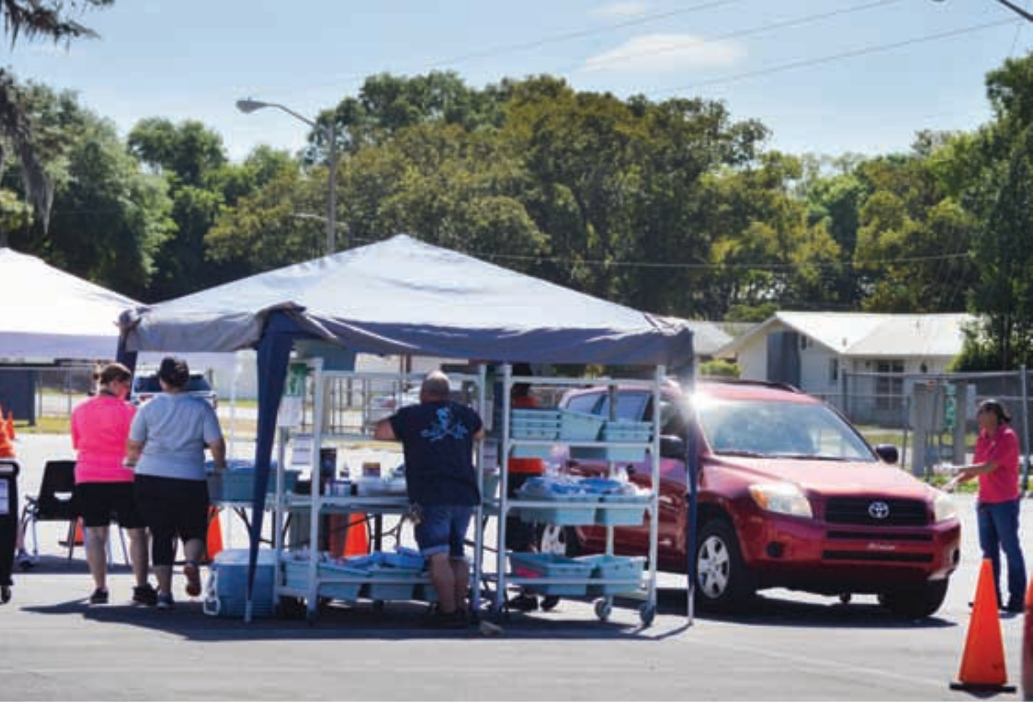
Vehicles line up for food packages in the Zephyrhills High parking lot in front of the gym.