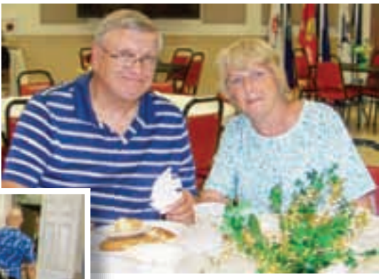
Left: Volunteers at Grand Horizons appreciated the luncheon.