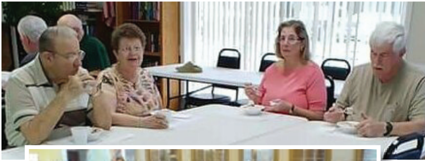
Left: Some of the many residents sit down to enjoy their ice cream.