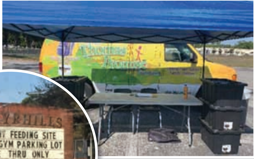
Above: The Thomas Promise van is posted outside Zephyrhills High School to promote the Foundation's Backpack Program.