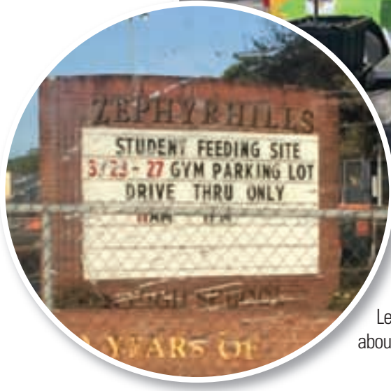
Left: Zephyrhills High School's sign lets people know about help that is available.