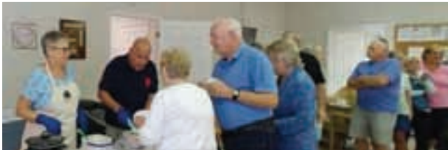
Left and below: Residents enjoy an ice cream social at Ramblewood Village.