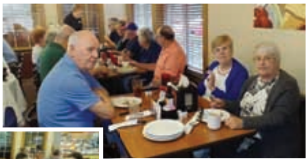
Left: Residents enjoy a buffet breakfast at the Golden Corral.