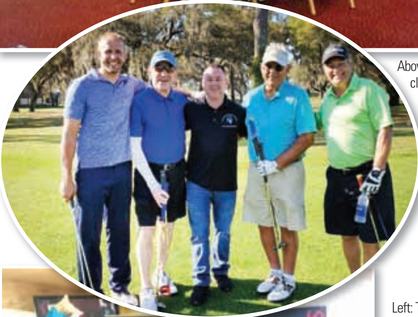
Left: The runner-up team in the tournament posed for a group photo on the Silverado course.