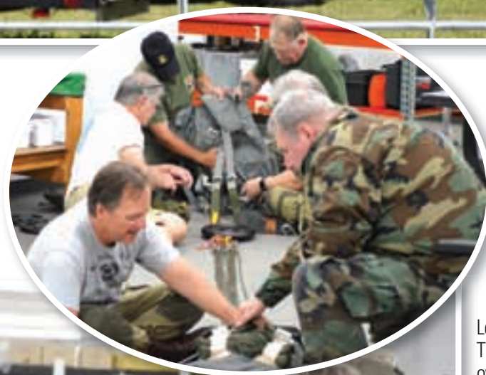
Right: Paratroopers work on packing their parachutes in preparation for their historic jump to commemorate the 75th anniversary of D-Day.