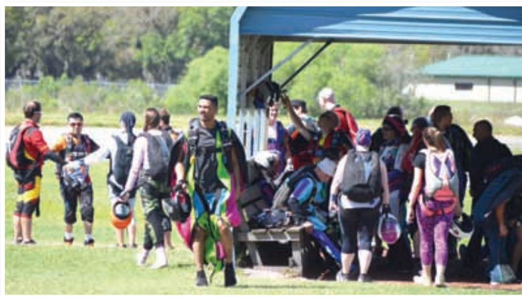
Above: Paratroopers preparing for a historic jump in Normandy, France on D-Day were joined by other parachutists making jumps on a busy Saturday at Skydive City.