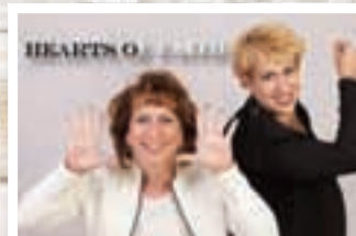
Hearts of Faith

Featuring... Country Gospel Music Association Award Winning Performers