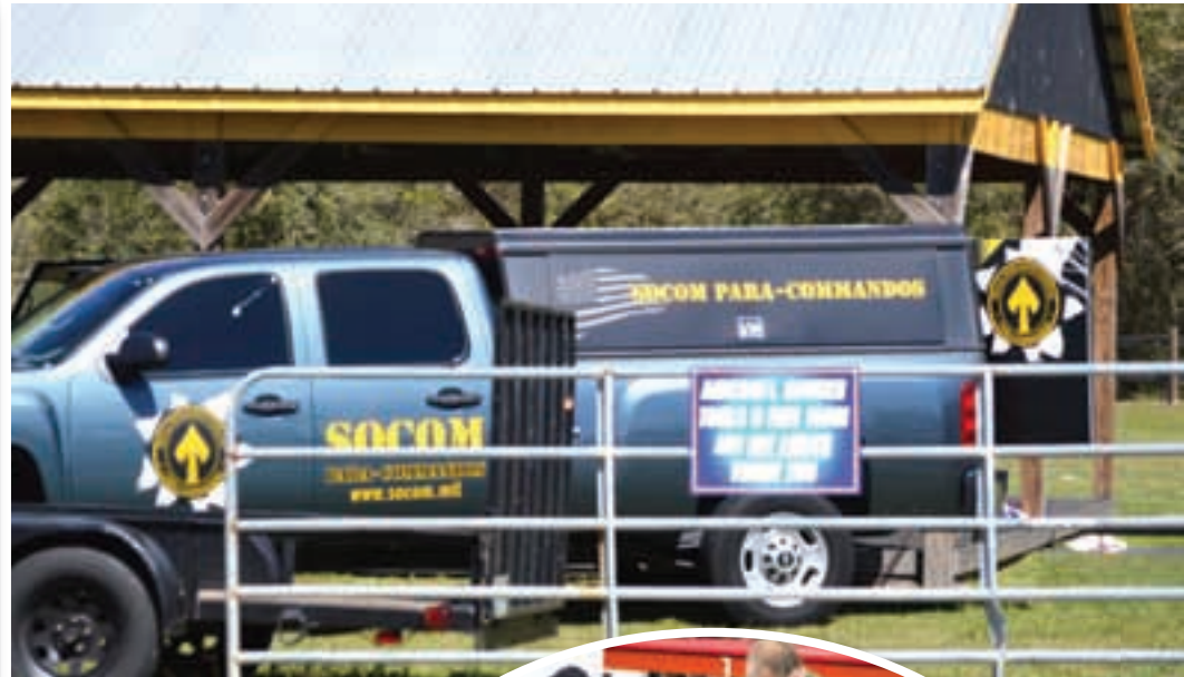
Above: A truck from SOCOM is parked near the jumping area.