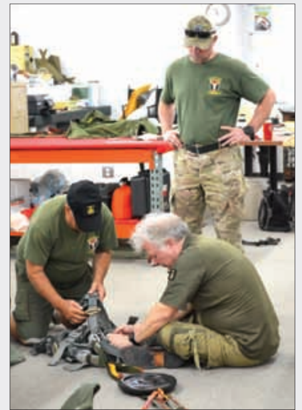
Paratroopers who will jump in Normandy work on their rigging last Saturday in Zephyrhills.