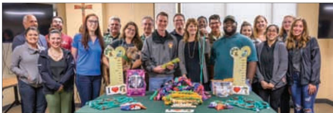
Saint Leo University's Paws of Love volunteers celebrated the donation of 135 lasso leashes to Pasco County Animal Services, along with animal services' office dog, Olivia.

Saint Leo University helps all creatures, great and small, and its Paws of Love organization was founded to help rescued and sheltered animals while protecting the environment.