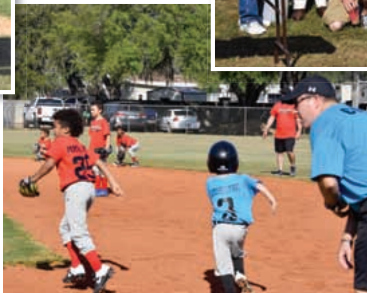
Right: The Blue Jays and Red Raiders opened the season with a Minor B Baseball game.