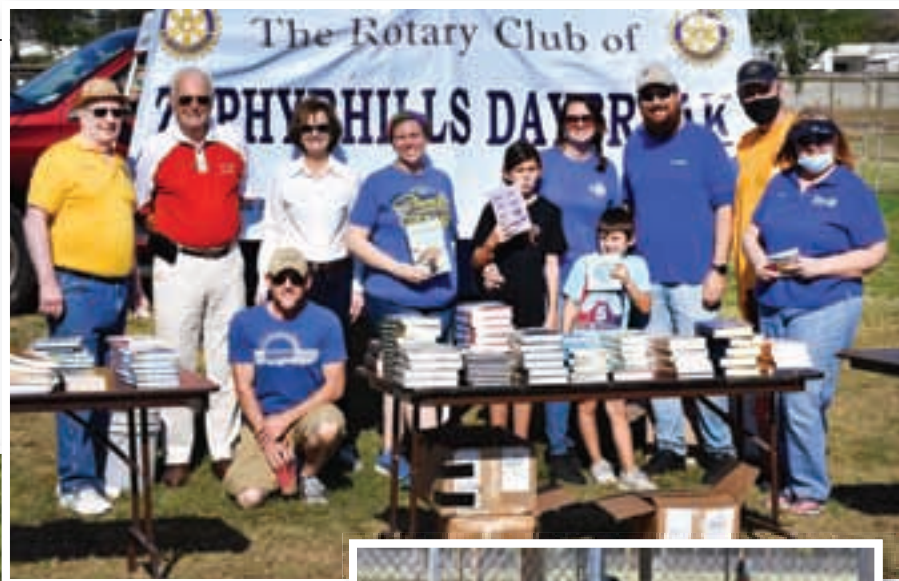
Right: Promoting a children's literacy program with plenty of books on hand at the entrance to the park were members of the Rotary Club of Zephyrhills Daybreak.