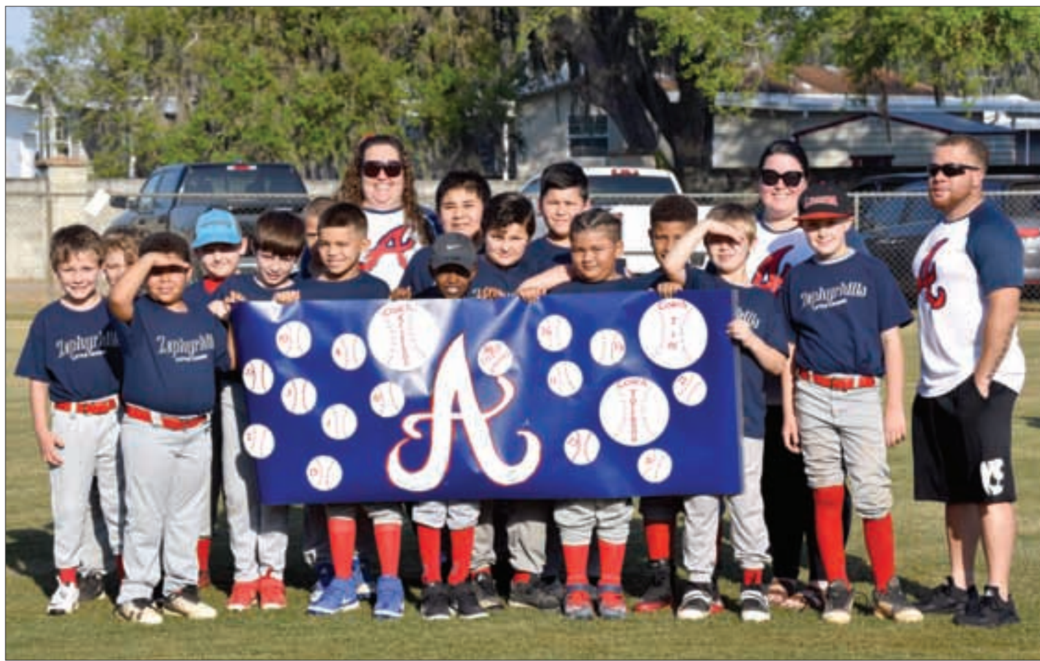
The Minor A Baseball Braves were among numerous teams that took the field and marched in a parade during Saturday's celebration.

Baseball and softball players begin this season with fanfare at the Samuel W. Pasco Recreation Complex