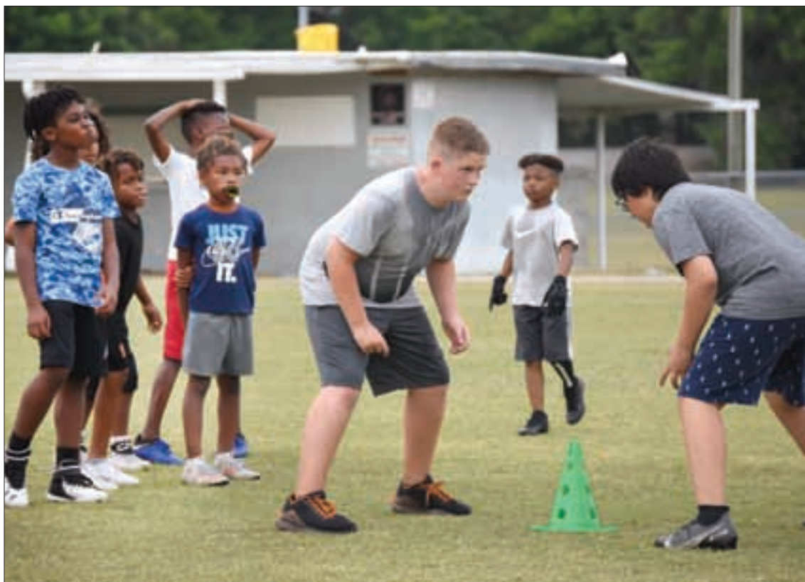
Players in the Zephyrhills Athletic League go head-to-head during agility drills at a recent practice.