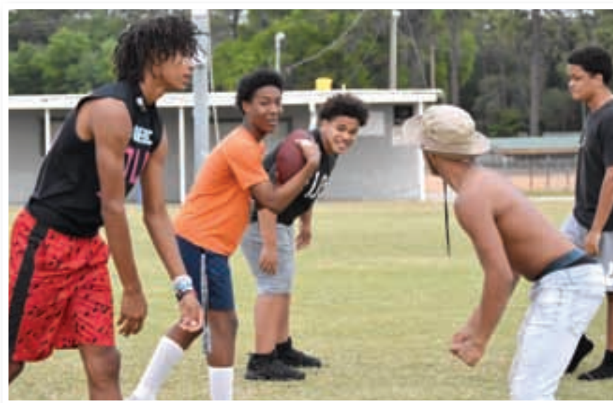
Left: Former ZAL players, some of whom help coach in the league, line up in a 7-on-7 scrimmage to demonstrate the new format.