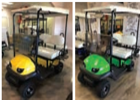
Yellow & Green to Choose From!

PERFECTLY PORTABLE! You can take it with you in practically any SUV, pickup, motorhome, van or crossover.