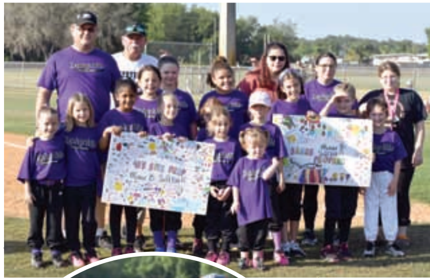
Left: Gathering along the first base line during the opening day ceremonies was a t-ball team named the Devil Rays.