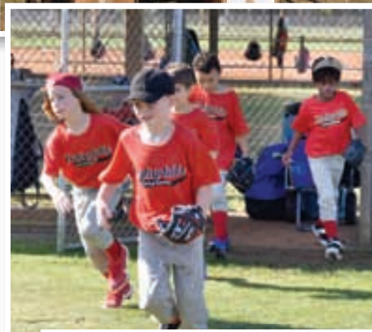
Upper right: The Red Raiders run out of the dugout to take their positions.