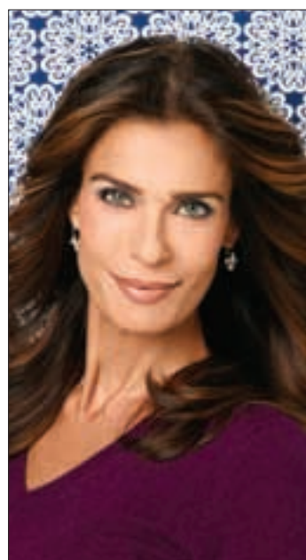
Kristian Alfonso stars as "Hope" on "Days of Our Lives"