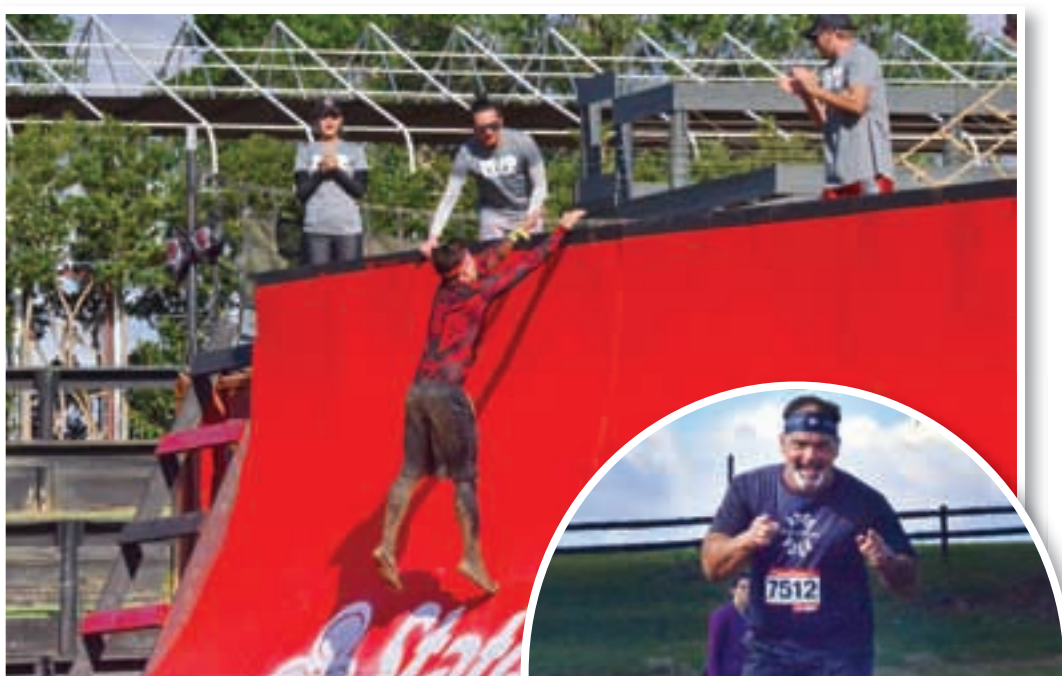
Above: A runner makes a leap for the top of the warped wall near the end of the course.