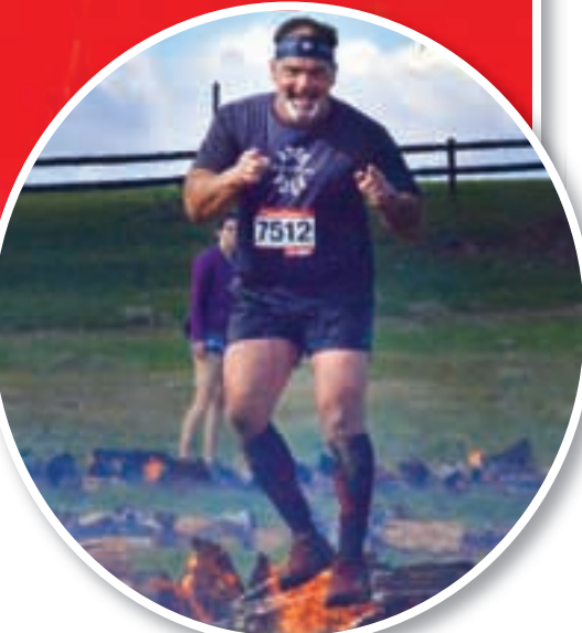
Right: The Fire Line obstacle was more fear factor than feat of strength but a great photo op nonetheless.