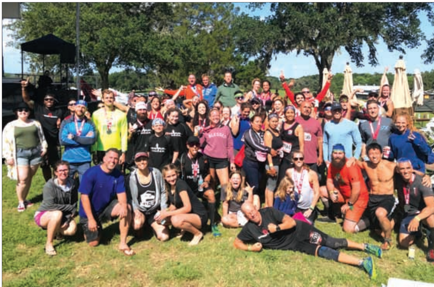
The gathered ensemble from Saturday's Rugged Maniac event at Little Everglades Ranch in Dade City.