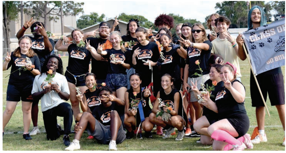
Left: The cheerleaders and winning senior team get together for a group photo.