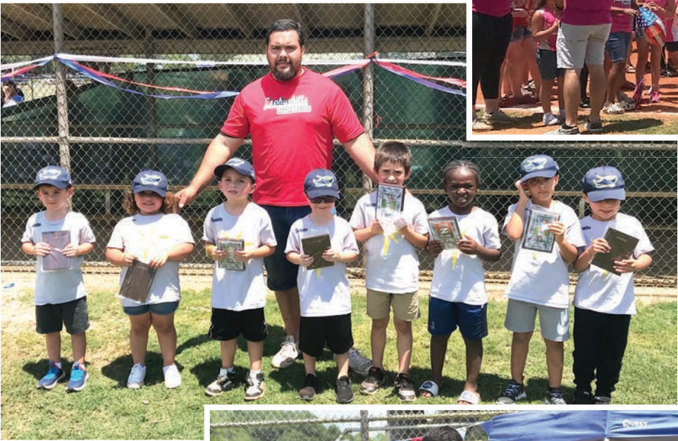
Left: Nine tee ball teams were given commemorative plaques on Sunday afternoon.