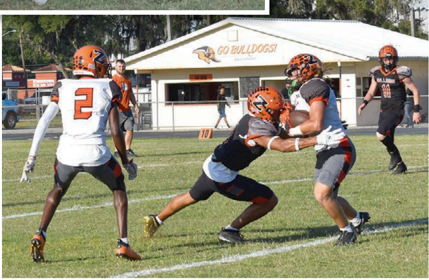
Below: A defender for the black team tackles an unidentified ball carrier.