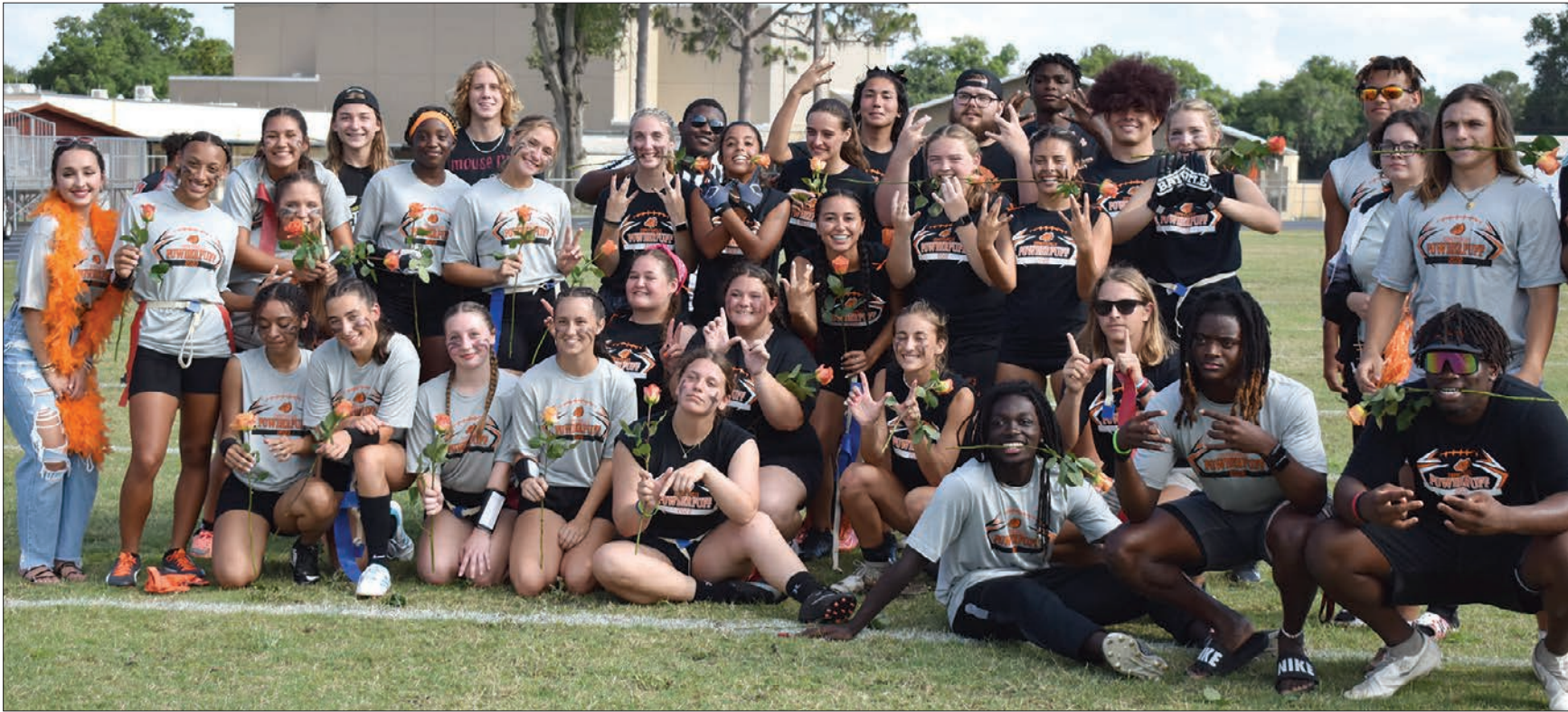
Girls from the junior and senior classes squared off in the traditional powder puff game with boys dressed up as cheerleaders rooting on the sidelines. (More photos on page 8A) STEVE LEE