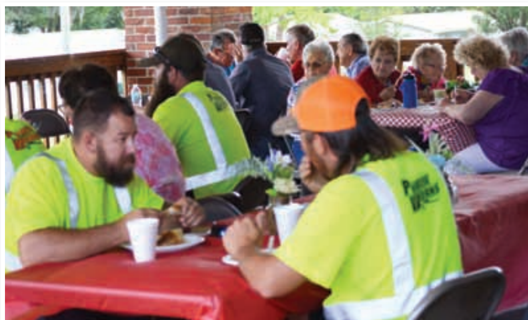
Above: City workers and Garden Gate Club members sat down together for a picnic lunch on the back porch of the Zephyrhills Depot Museum.