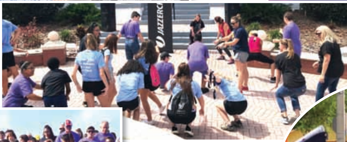
Above: Jazercise came out for the event and led a session on the courthouse steps.