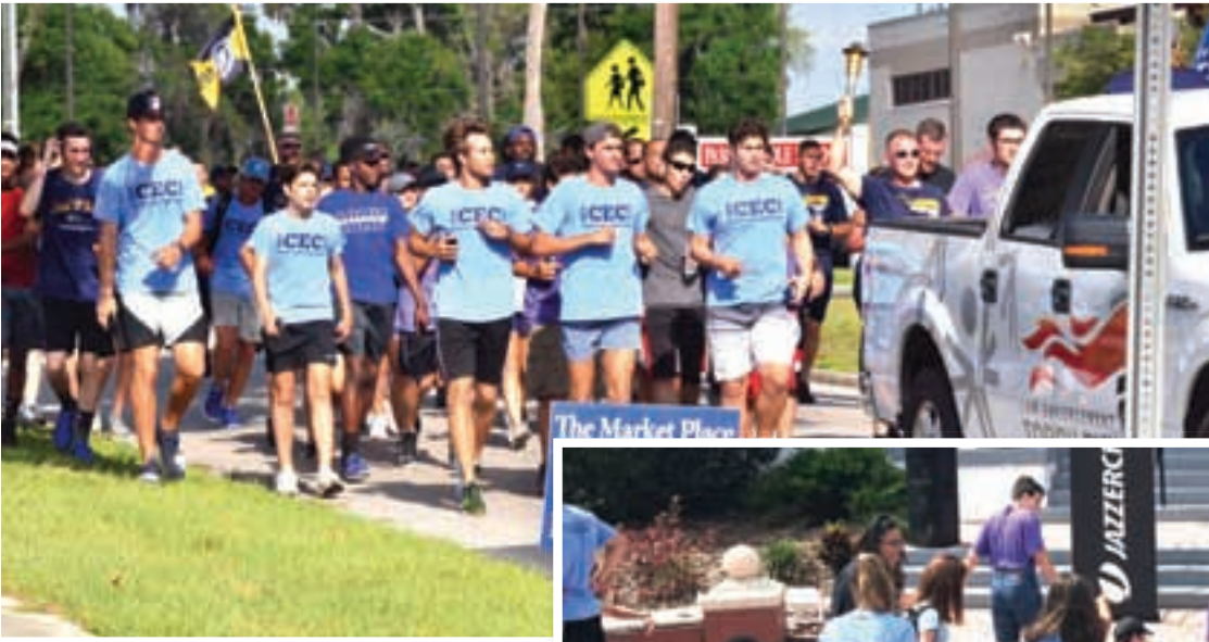
Above: The lead elements of the run arrive at Pasco Elementary to close up the formation.