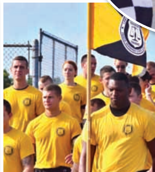
Above: Law enforcement trainees from Pasco-Hernando State College were part of the 2019 run.