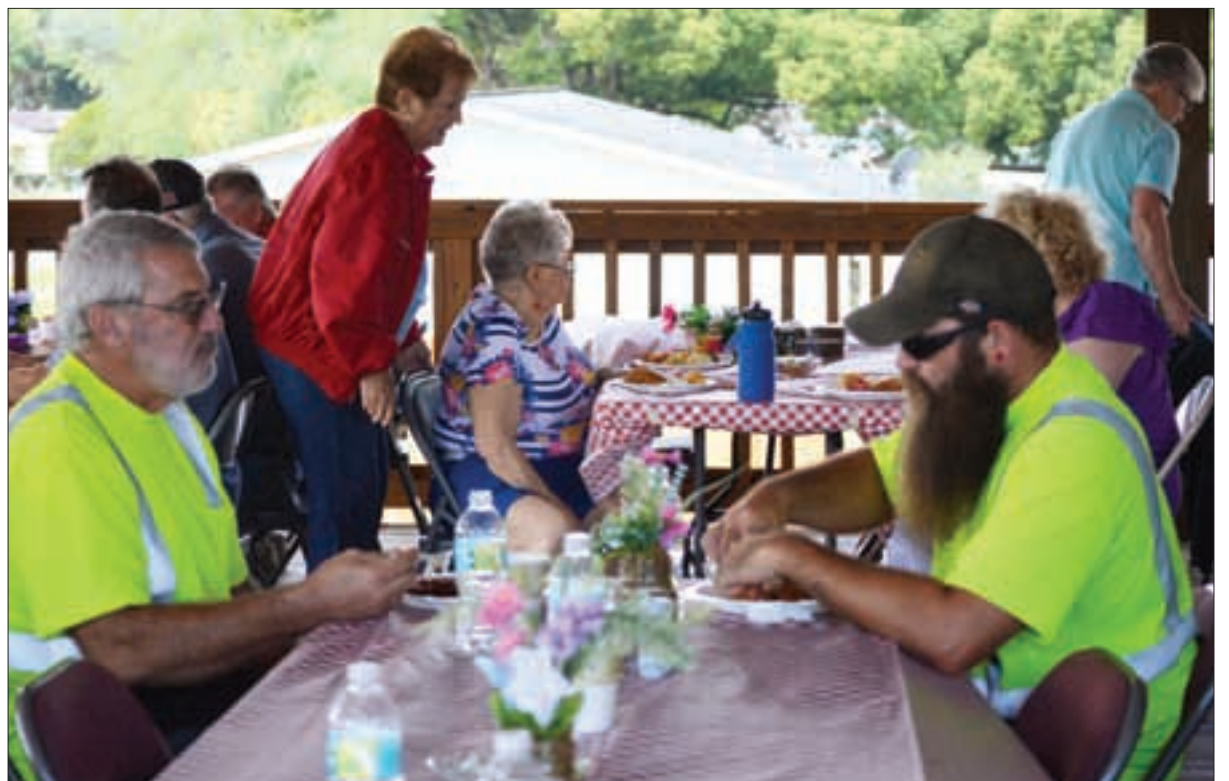
City employees and Garden Gate Club members sat down for a traditional picnic lunch last week at the Zephyrhills Depot Museum.