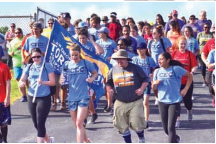
Left: The procession spilled out of the gates and onto the roads for the 2019 Law Enforcement Torch Run.