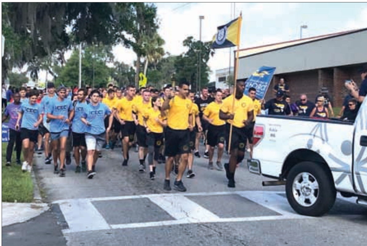
The Law Enforcement Torch Run made a stop at Pasco Elementary School on its way to downtown Dade City.