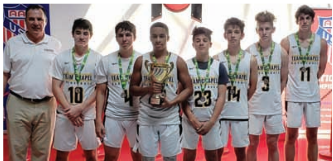
Above: Team Wesley Chapel settled for the runner-up trophy in the AAU State tournament following a loss in the final game to the arch-rival Demons.