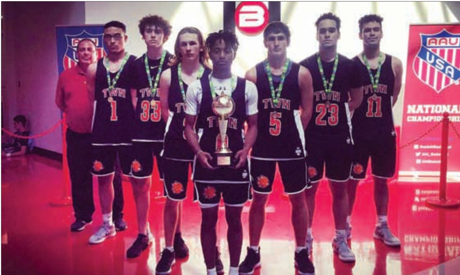
The Demons, who include three Zephyrhills High basketball players, defeated Team Chapel for the Amateur Athletic Union State championship.

Some players from east and central Pasco go from school rivals to club teammates