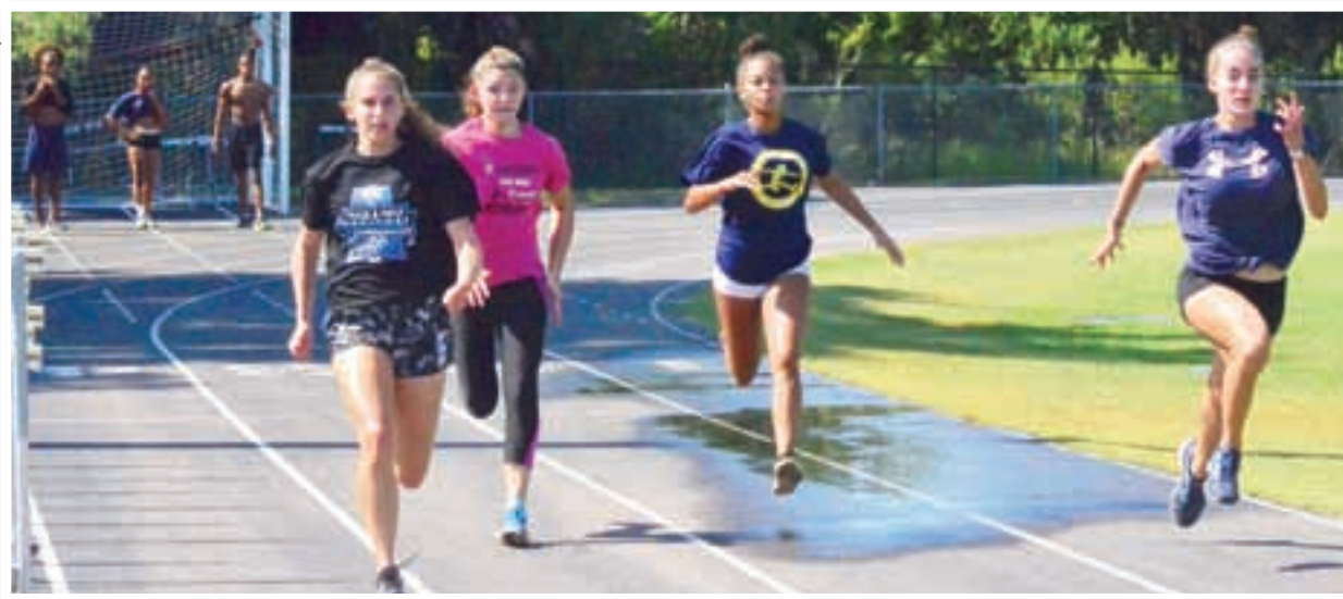
Above: A group of female runners from the Speed Starz Track/Running Club hit the track just after the morning camp session.