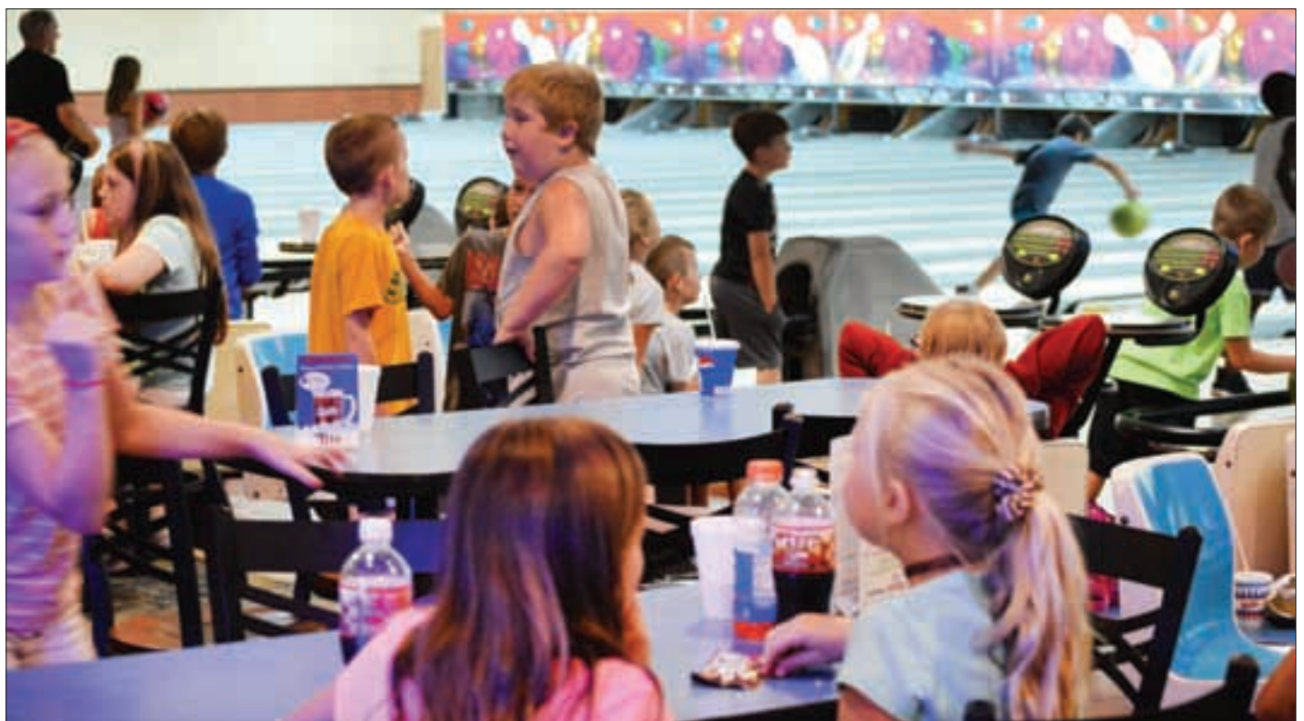
Boys and girls from various schools in Zephyrhills went to Pin Chasers Monday for bowling, the first event of the summer recreational camp.