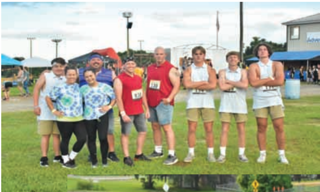
Above: Members of Cypress Creek High School staff organize as the Cypress Creek Mudders.