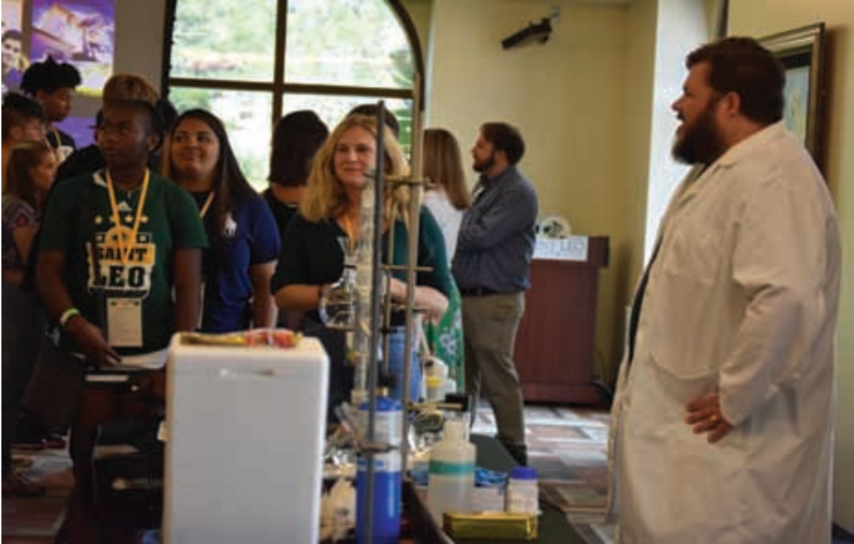
Incoming students got to meet professors in various buildings on campus during the hands-on tour.