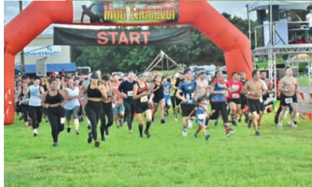
Above: Dusk runners take off from the starting lists.