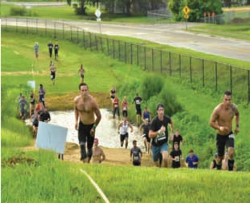
Right: One of the first obstacles was a mud pit followed by a steep hill.