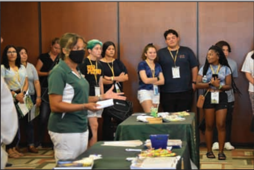
Above: As was the case in numerous classrooms, incoming students gathered around to listen to professors. Right: Students walk across campus during Saturday's tour.