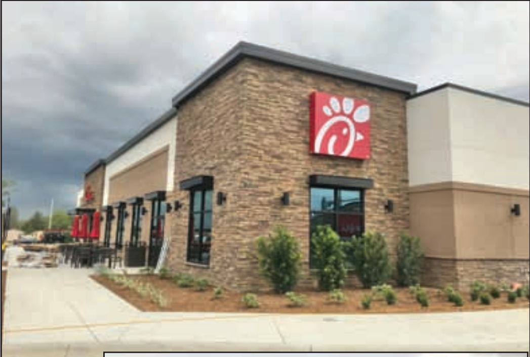
Above: The new Chick-fil-A could be online and serving customers before the month is out.