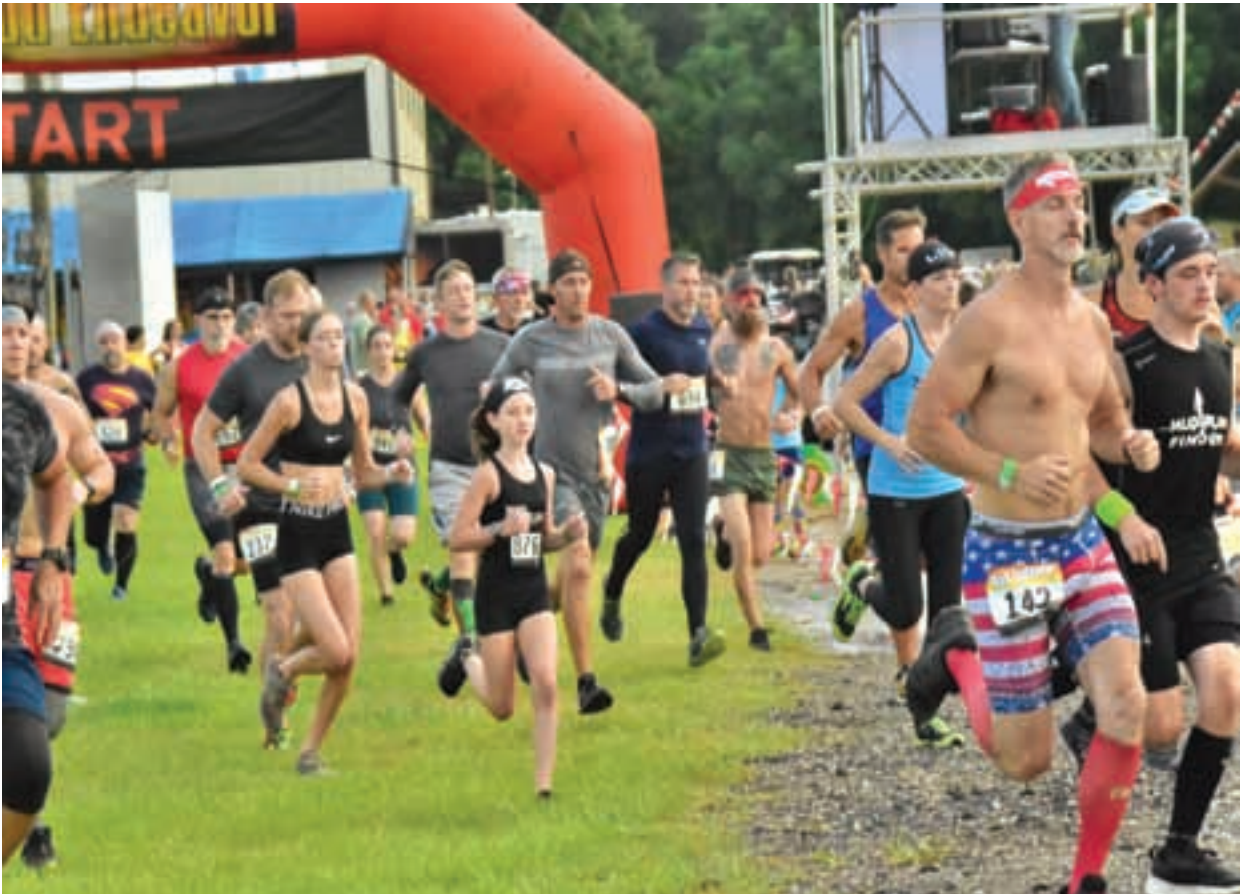
Runners from an early heat take off at near dusk during Mud Endeavor's Under the Lights.

The Yohos weren't sure when or even if they'd get the green light to start hosting one of the more popular and reputable obstacle course races (OCRs) in the area again.