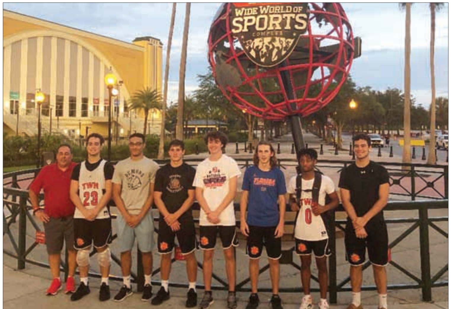
The Demons, consisting of three Zephyrhills High returners, competed in the AAU Nationals at Disney's Wide World of Sports Complex.