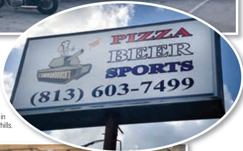
Right: Commandough's is located at the corner of U.S. Highway 301 and 15th Avenue in Zephyrhills.