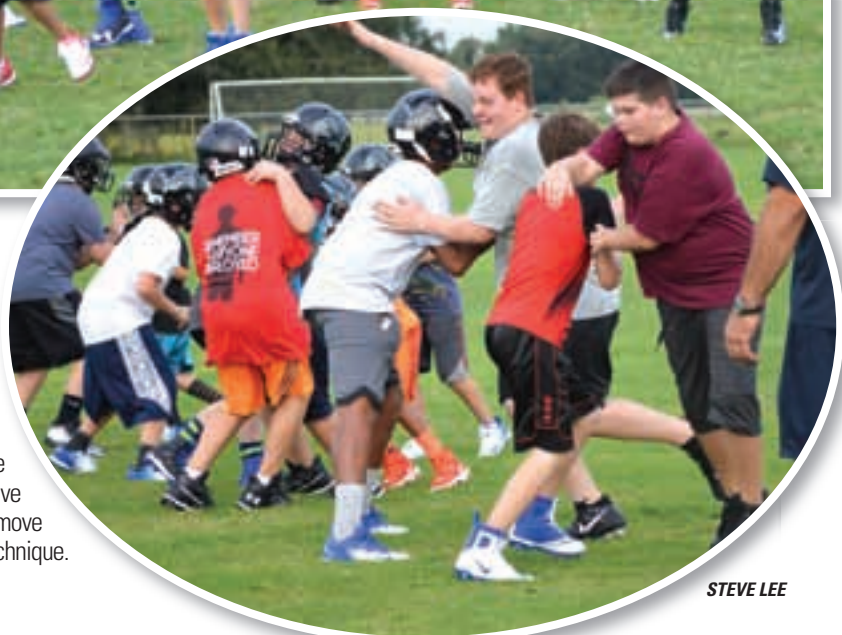
Right: Working at the line of scrimmage, defensive players work on the swim move technique.