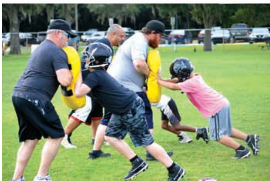
Left: Youth football players line up to take on coaches holding blocking dummies during a recent practice for the Wiregrass Lions.

“This is a low-roster team and it’s a lot of play for the kids,” he noted.