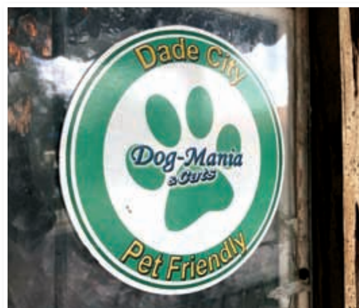
Above: Kafe Kokopelli participates in the annual Dogs Day in Dade City.