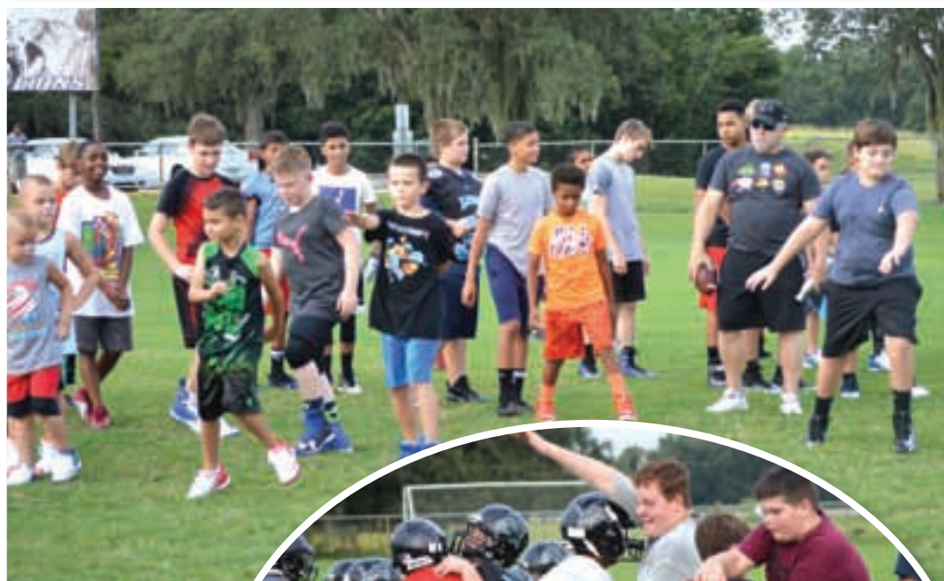
Above: Youth football players for the Wiregrass Lions do sideways shuffles before a recent practice at the Samuel W. Pasco Recreation Complex.