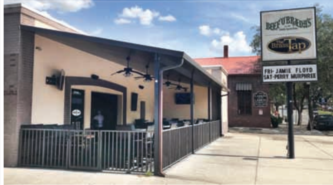
Above: The Brass Tap, located just a couple blocks from Kafe Kokopelli in Dade City, welcomes dogs and is considering the new county ordinance.

6719 GALL BLVD. • SUITE 205 • ZEPHYRHILLS, FL 33542