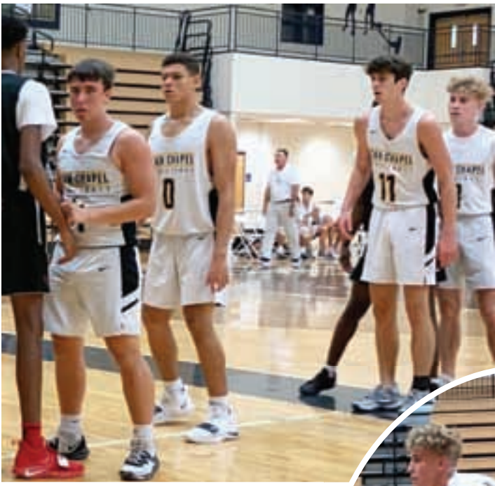
Left: Team Chapel basketball players line up for an inbound pass during a tournament game in Georgia last week. The team, consisting primarily of Wiregrass Ranch High players, went 2-4 in the national tourney.