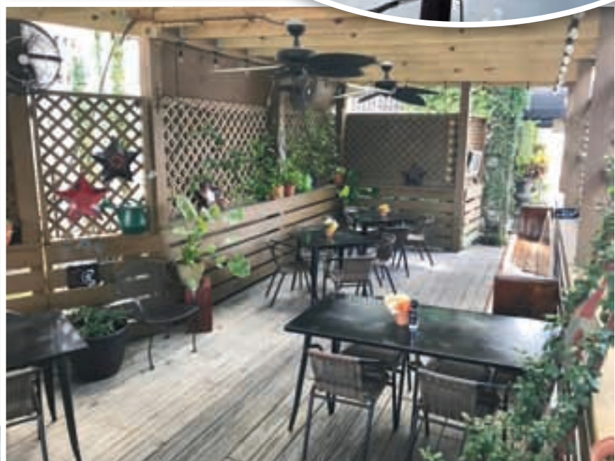
Left: The outdoor patio at Kafe Kokopelli will soon be in compliance with the new county ordinance, even though the restaurant is in incorporated Dade City.