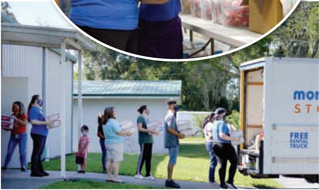
Above: One-by-one, volunteers pass boxes to be sent away in a delivery truck.