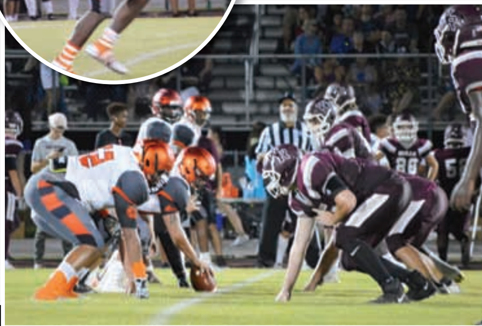
Below: The Bulldog offense goes against the Bulls' defense at the line of scrimmage.