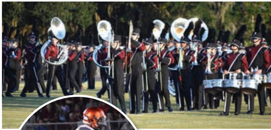
Above: The Wiregrass Ranch Marching Band gets set to take the field before the game.