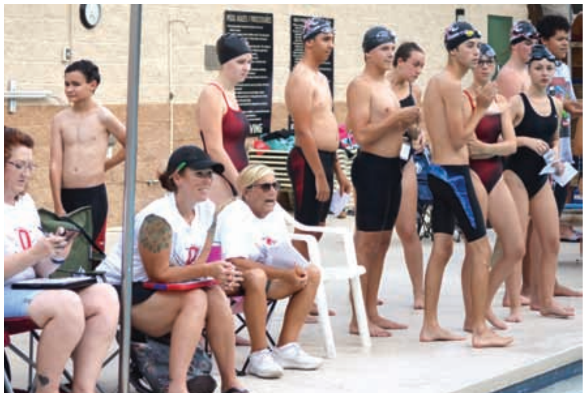
Coaches and swimmers from both teams watch as competitors race in the pool at the East Pasco YMCA.