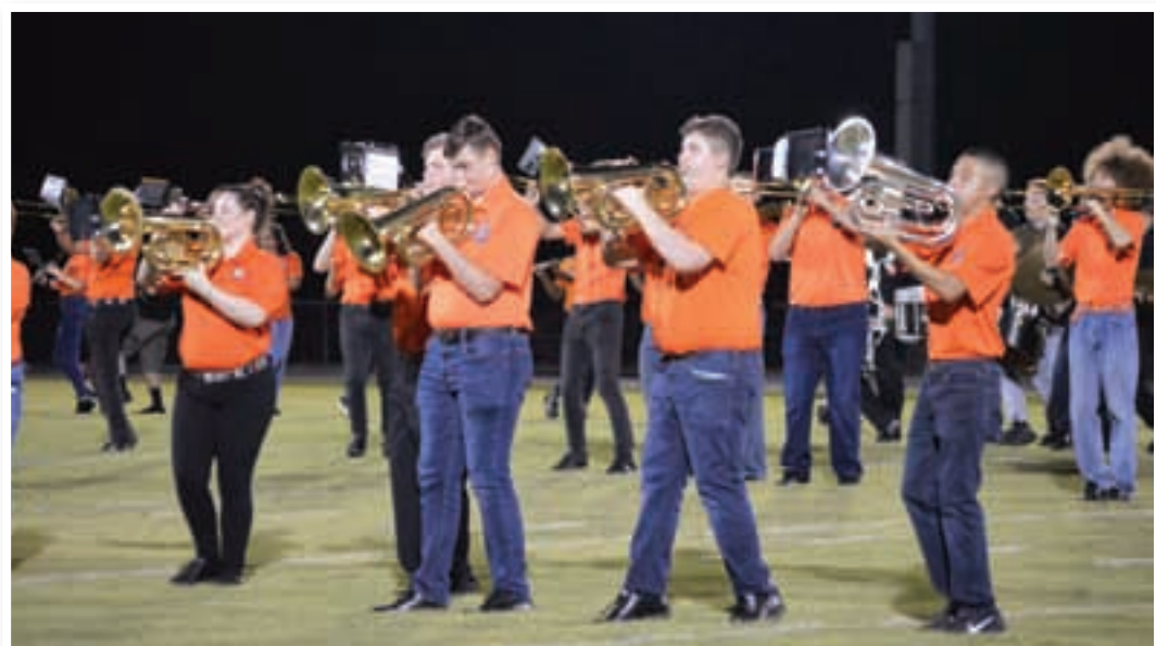
Above: Members of Zephyrhills' band play and march in formation during the halftime festivities.