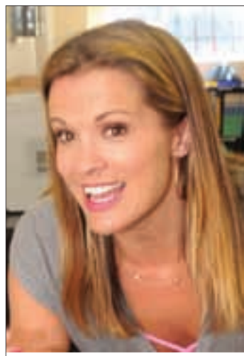
Melissa Claire Egan stars as "Chelsea" on "The Young and the Restless"