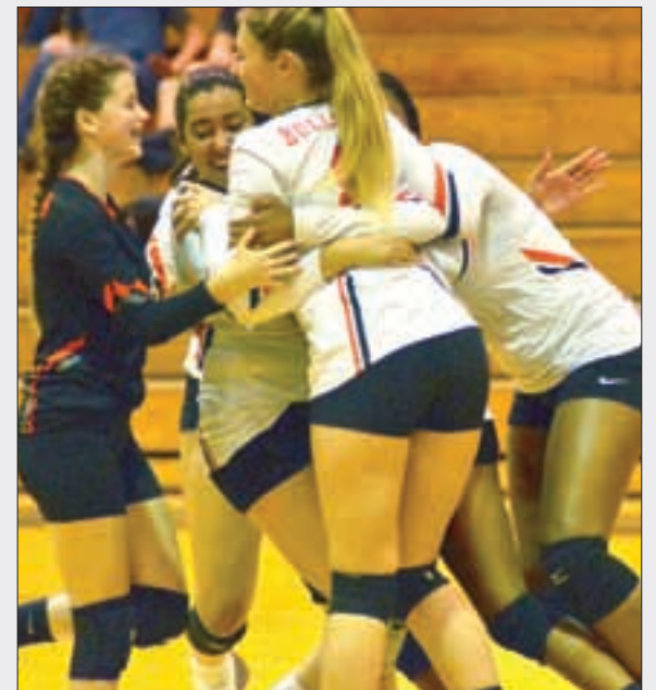
The Bulldogs put together a decent run in the third set and found this moment to celebrate it. ANDY WARRENER