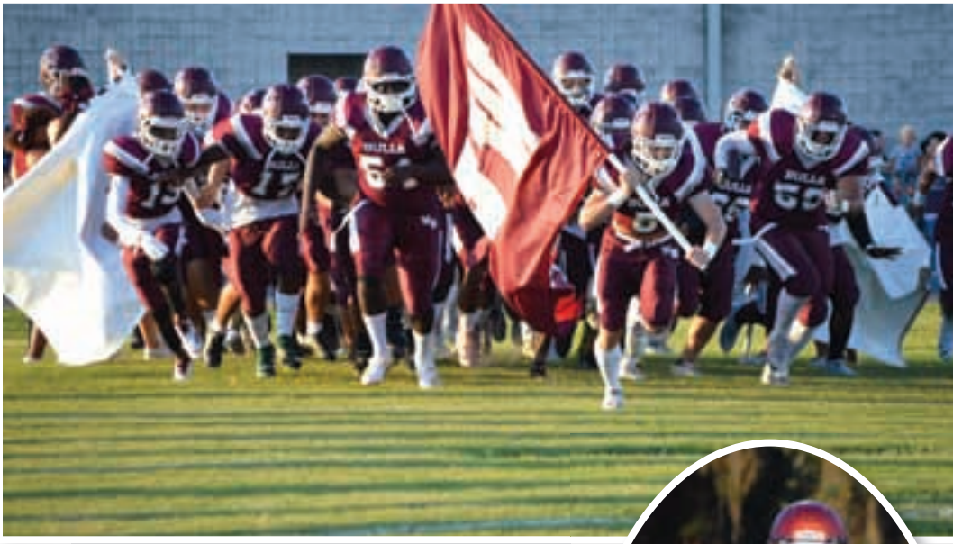
Above: The Bulls run onto the field at Wiregrass Ranch's stadium before the game against Zephyrhills.