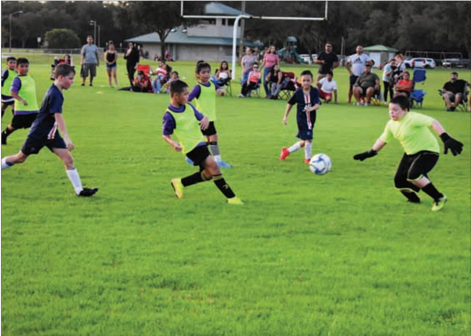
Competitive players for the Spirit of Zephyrhills and a team from Plant City scrimmage at the Samuel W. Pasco Recreation Complex.