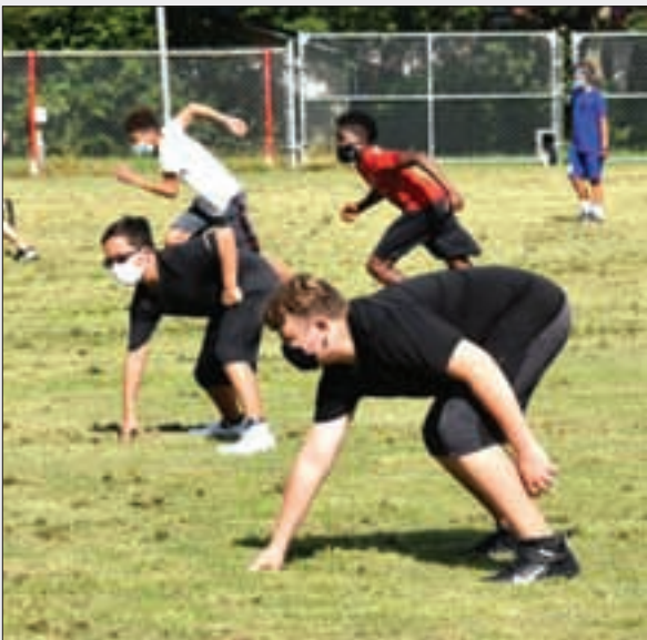
Prospects for Stewart Middle School's football team line up for wind sprints on the first day of tryouts.