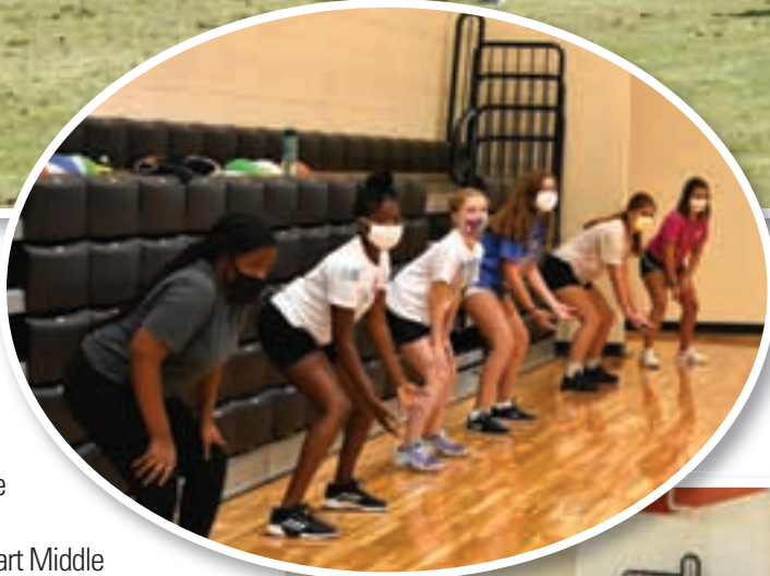
Above: Stewart Middle players maintain social distancing while doing a series of wind sprints.