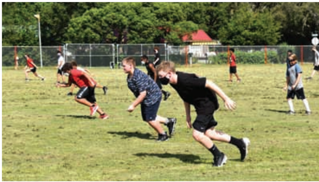
Above: Keeping apart from one another, prospects for the Stewart Middle football team go through conditioning drills during the first day of tryouts.