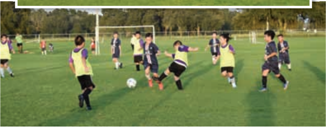
Above: Players in the Under-10 game battle for possession during their scrimmage.