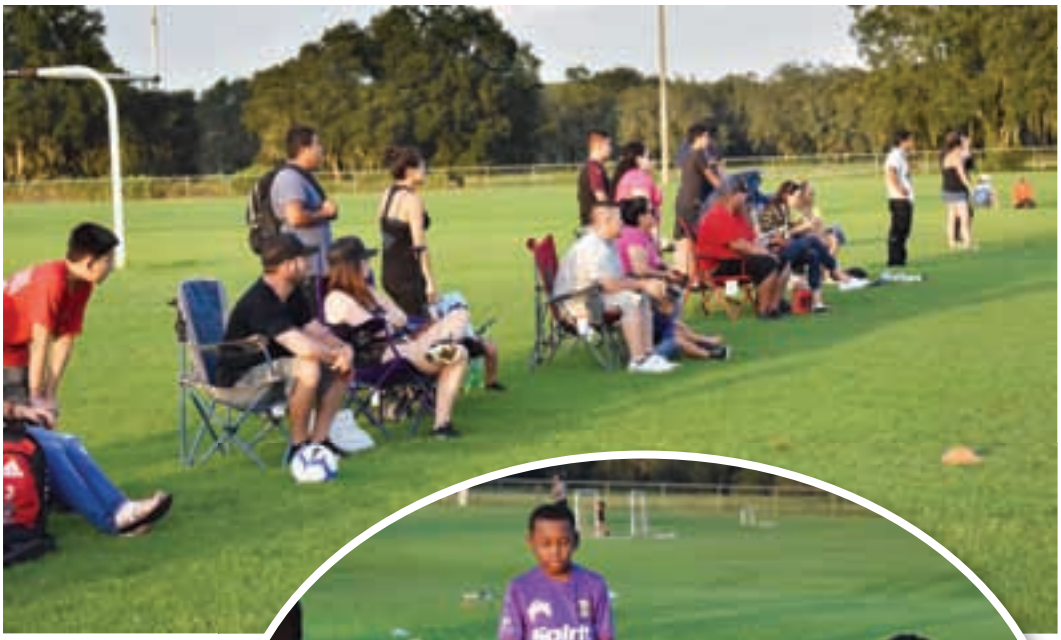
Above: Parents watch and cheer for their young soccer players.