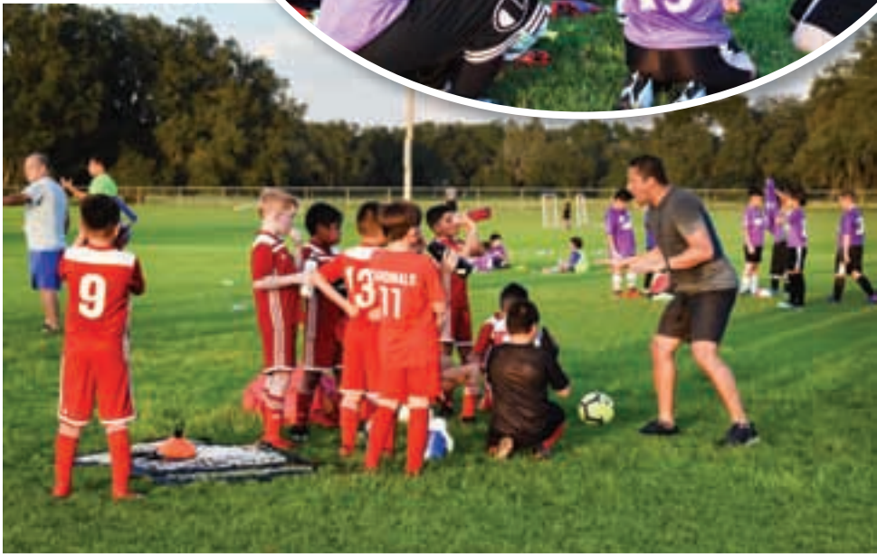
Above: Coaches for the Spirit and Plant City team give their players some pointers at halftime.