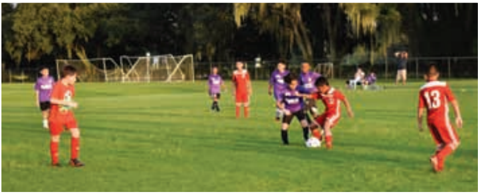
Below: The Under-9 game gets under way after a halftime break.