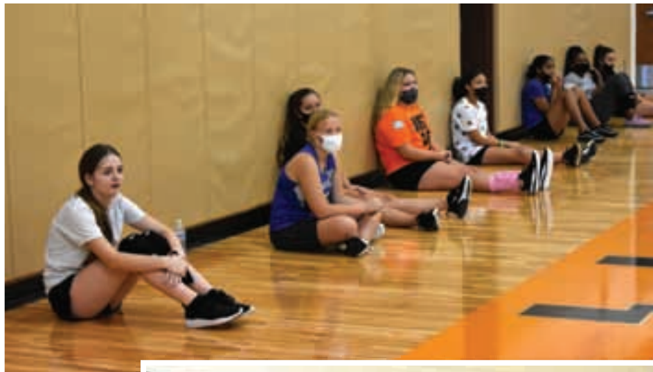
Above and right: Groups of girls trying out for the Stewart Middle volleyball team separate along the walls and stands in the gym.