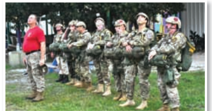
Members of the Phantom Airborne Brigade prepare to load up and take their static line jumps.