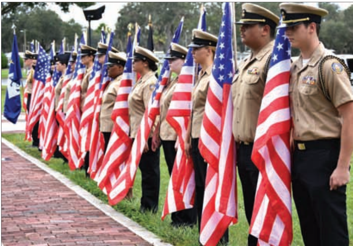
Members of Pasco High's Navy JROTC stand at attention during Saturday's 9/11 memorial at Zephyr Park's Veteran's Walkway.