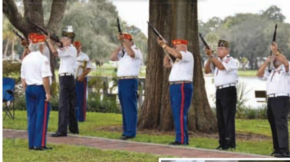
Below: The VFW Post 8154 Honor Guard provided the traditional 21-gun salute.