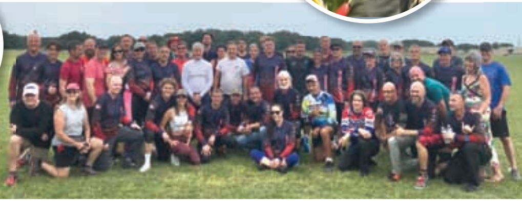
Right: The full crew of skydivers that participated in Saturday's Flags in the Air memorial.