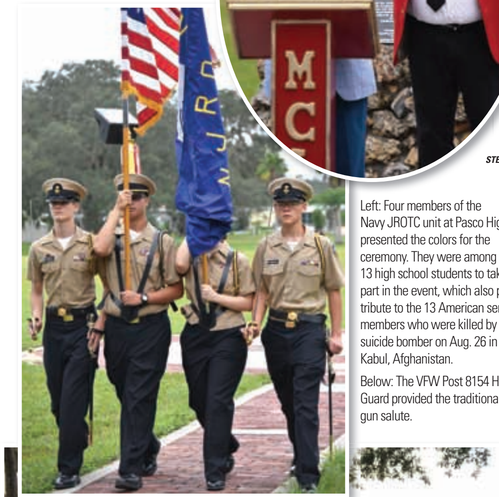
Left: Four members of the Navy JROTC unit at Pasco High presented the colors for the ceremony. They were among 13 high school students to take part in the event, which also paid tribute to the 13 American service members who were killed by a suicide bomber on Aug. 26 in Kabul, Afghanistan.