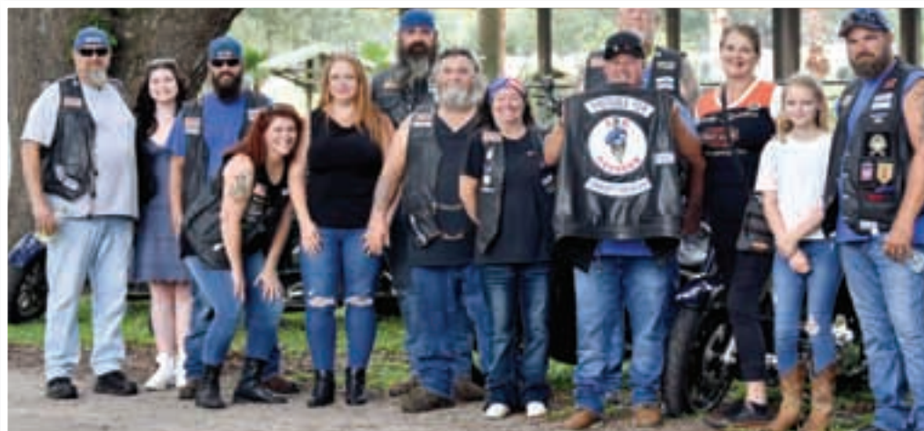
Above: Members of the Wretched Few, a veterans motorcycle club, came out to show their support.