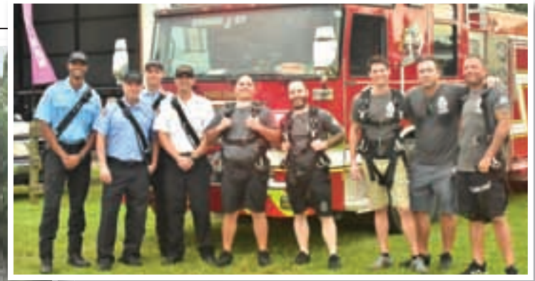
Above: Members of Pasco County Fire Rescue showed up to cheer on some of their own making tandem jumps.