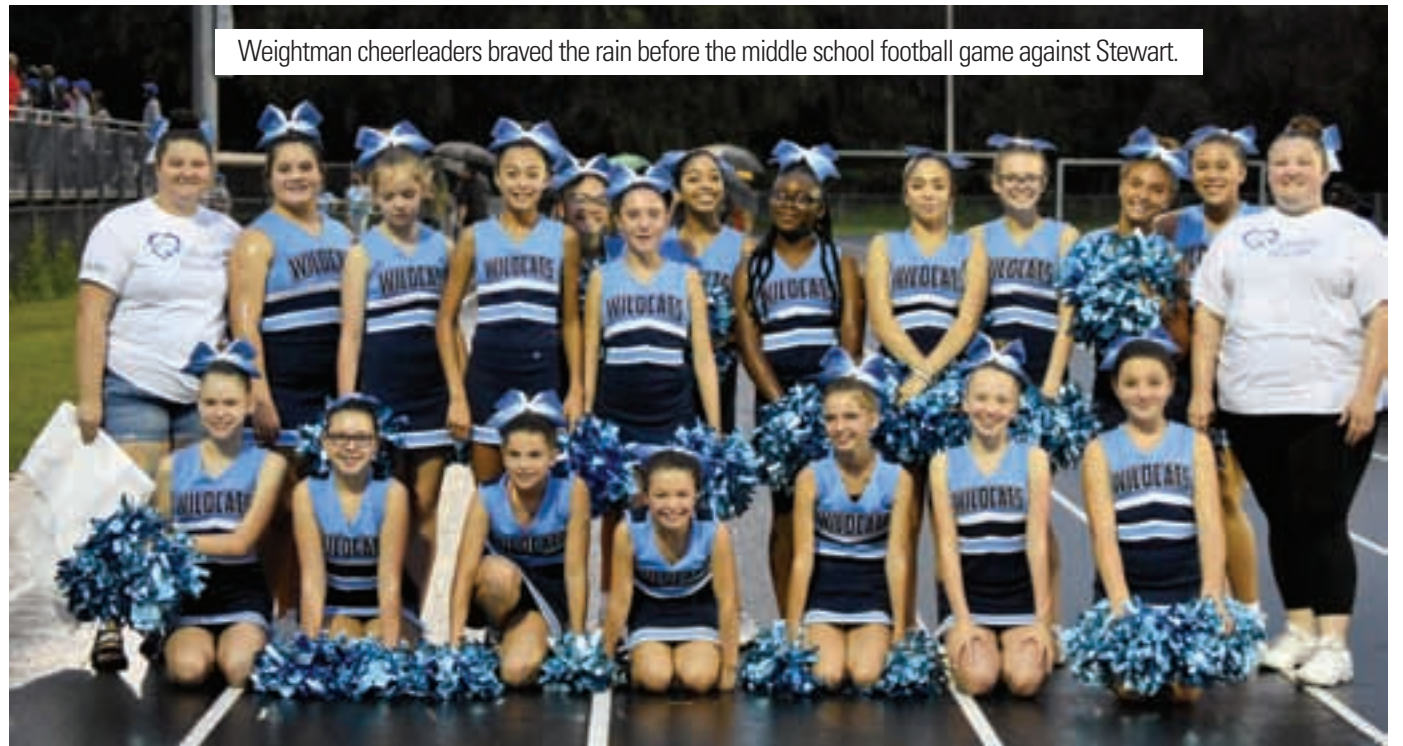
Weightman cheerleaders braved the rain before the middle school football game against Stewart.