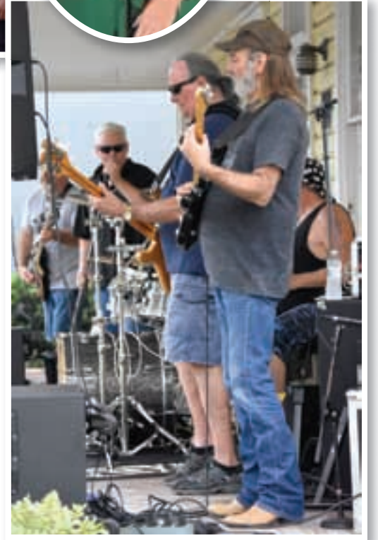
Above: The Southbound Band entertained the crowd by playing on the porch of the Jeffries House.

Next up for Main Street Zephyrhills is Halloween Howl, which also was among numerous scheduled events that did not take place last year. This year's fall tradition of trick or treating with a haunted house, hayrides and a kids zone is slated for Oct. 30, 4-9 p.m.