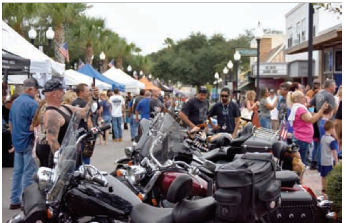
The downtown corridor was filled with people, motorcycles and vendor tents during the weekend event.