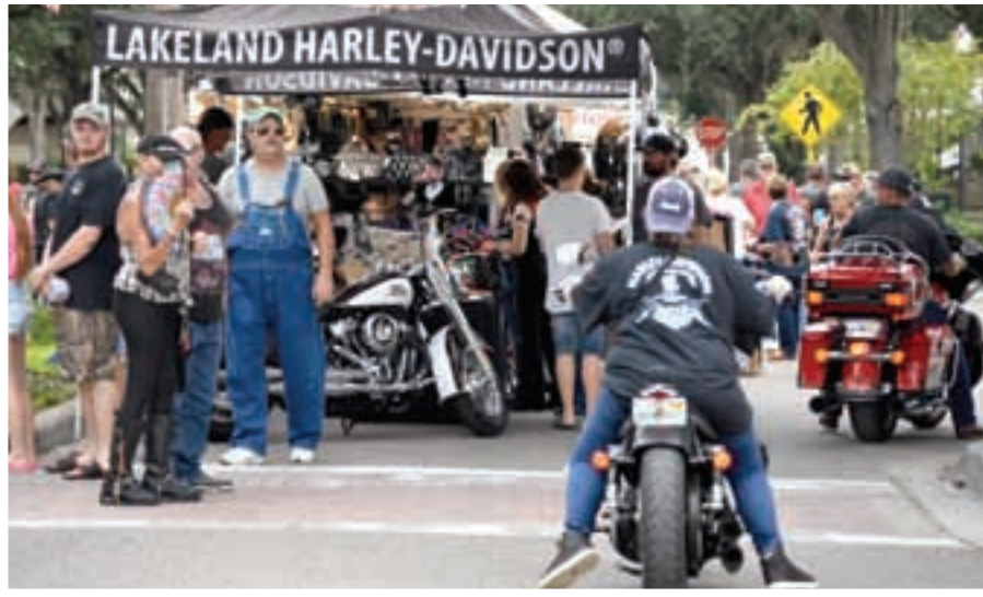
Above: Motorcycle riders make their way through the crowd.