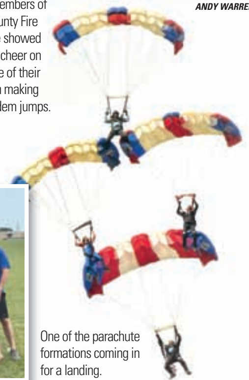
One of the parachute formations coming in for a landing.