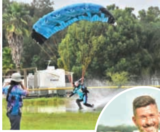
Above: One of the veteran jumpers takes a swoop landing in the pond at Skydive City's Drop Zone.