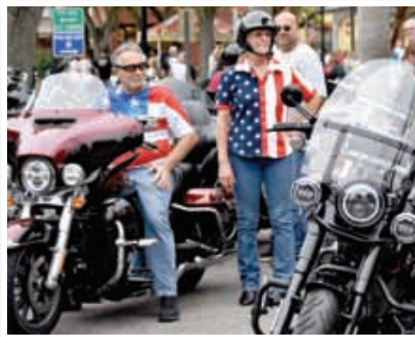
Above: Numerous motorcycle riders donned patriotic colors.

Those parades, such as ones for Christmas and Founders' Day, hopefully will return soon. One popular local event, however, has been postponed. The 60th Annual Community & Membership Awards Banquet, put on by the Zephyrhills Chamber of Commerce, initially was scheduled for this Thursday. Chamber officials decided to reschedule the banquet for Nov. 9.