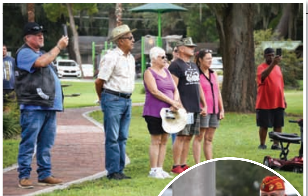
Above: Local residents and visitors came out in support of the 9/11 ceremony at Zephyr Park.