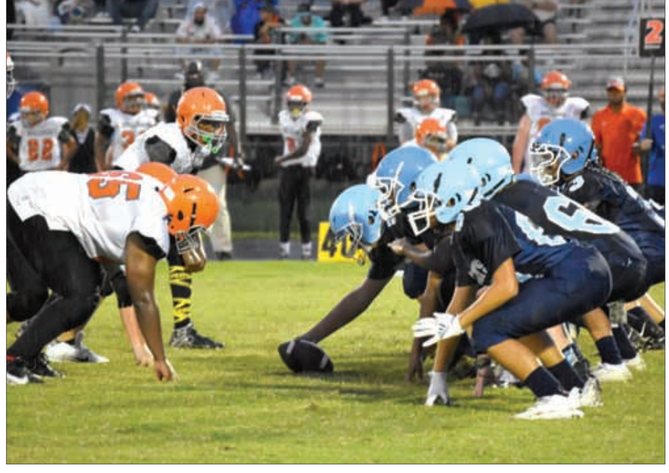
The Weightman offense and Stewart defense square off on a play early in the second half of Tuesday night's game.