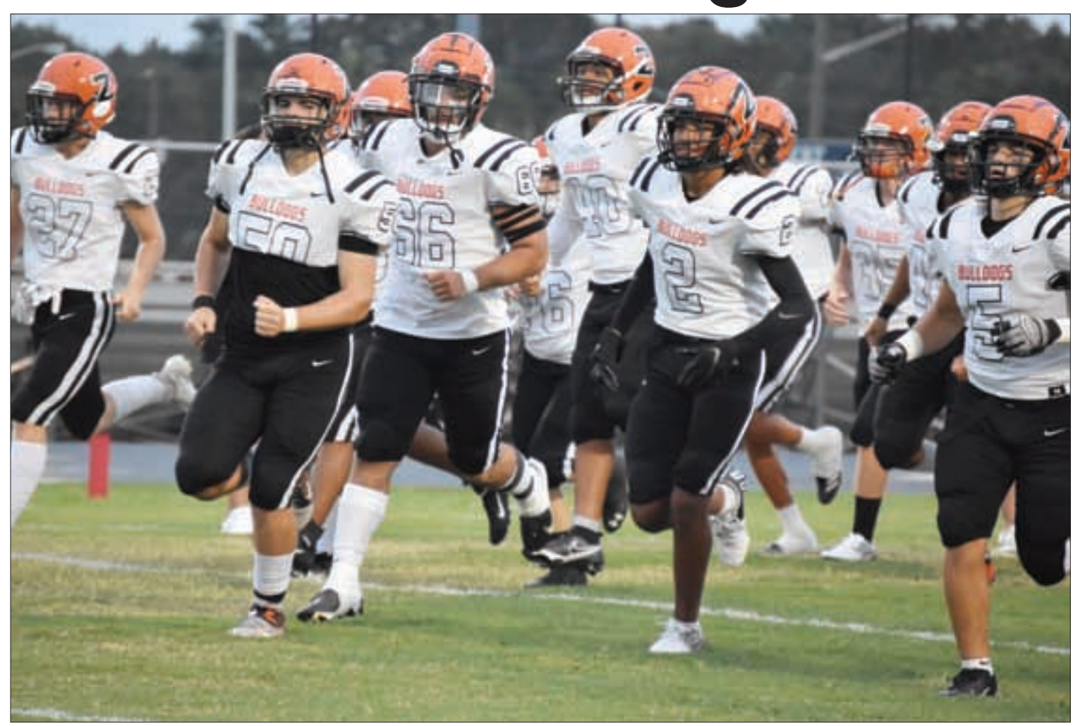
The Bulldogs, who head into this Friday's game at rival Wesley Chapel with a 3-0 record, run onto the football field at Fivay in Hudson.