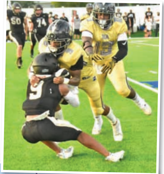
Below: The Wesley Chapel Wildcats take the field for their road opener at Sunlake.