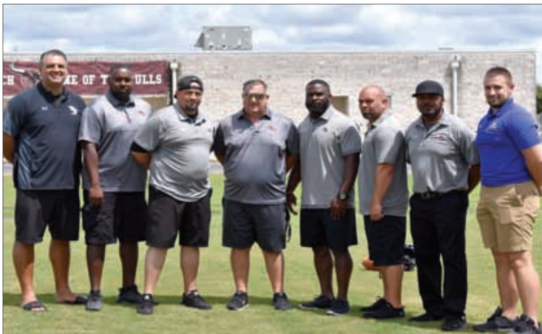
Several of the Bulls' varsity coaches are shown during media day.