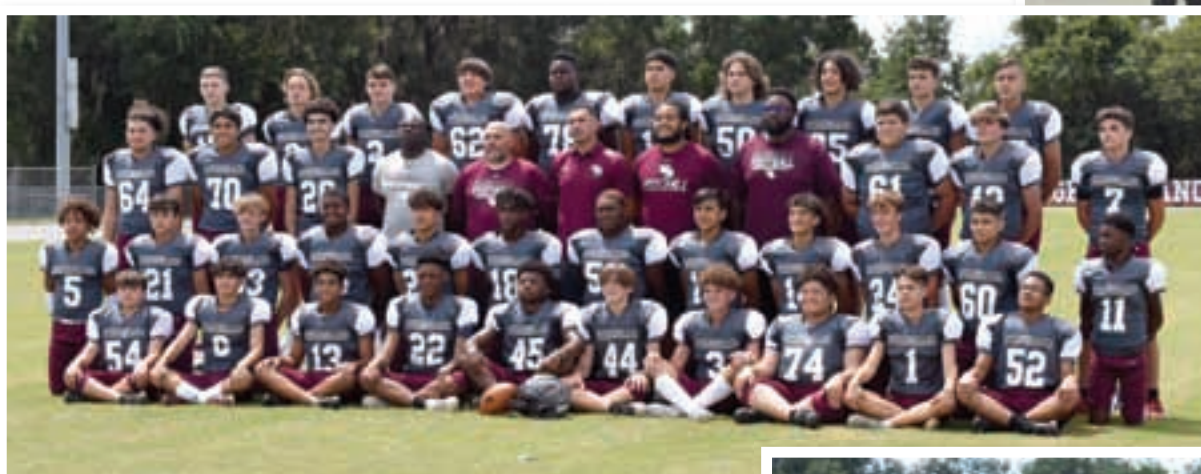
Wiregrass Ranch junior varsity football team.