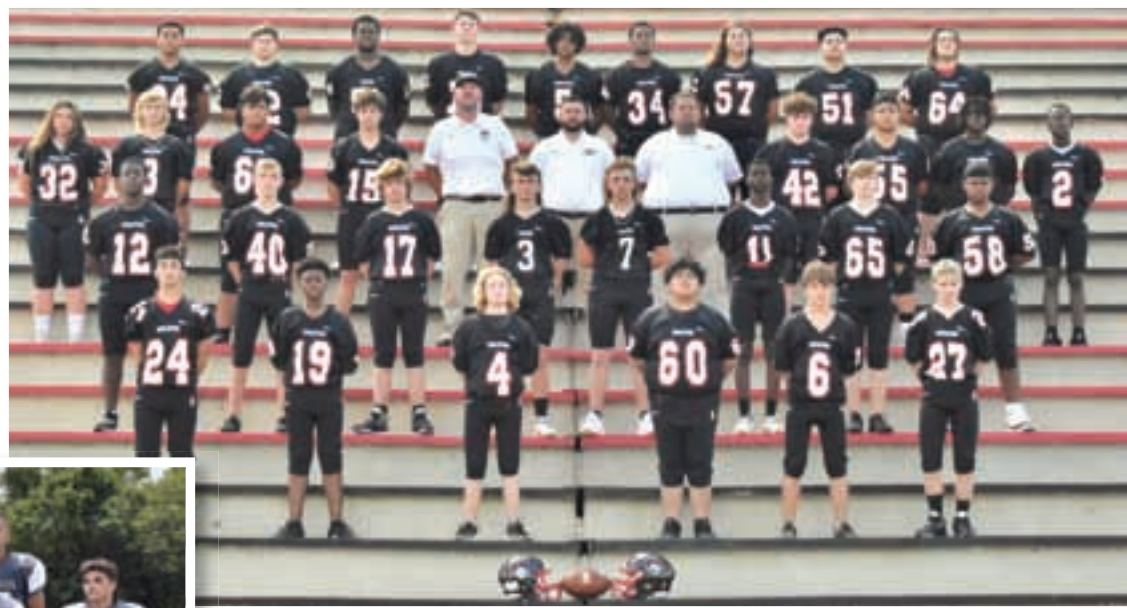
Pasco Pirates junior varsity football team.