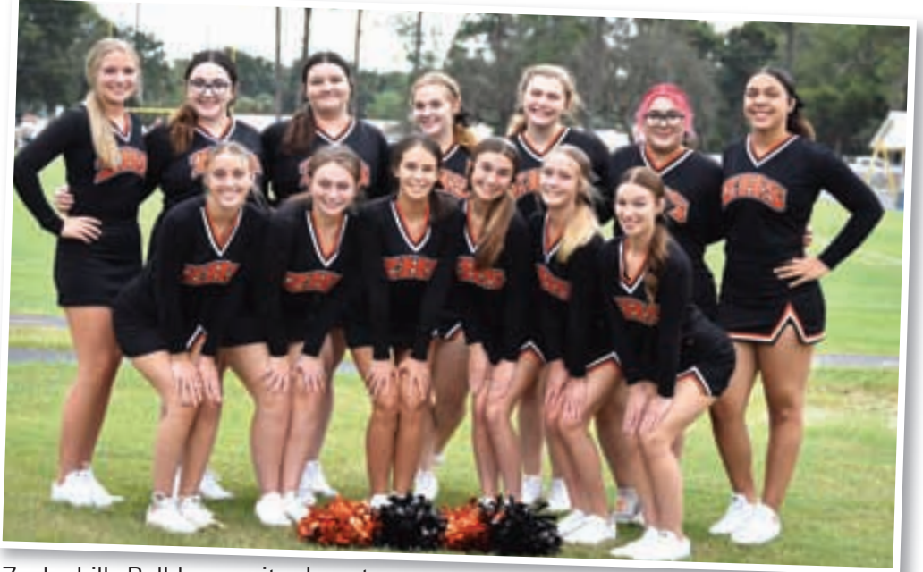
Zephyrhills Bulldog varsity cheer team.