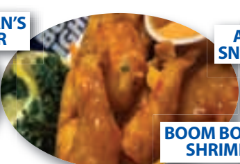
BOOM BOOM SHRIMP