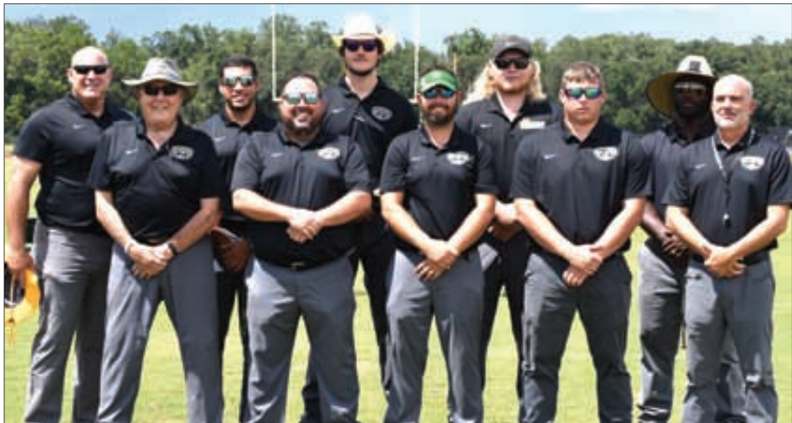
On media day, most of Cypress Creek's varsity and junior varsity football coaches got together for a group photo.