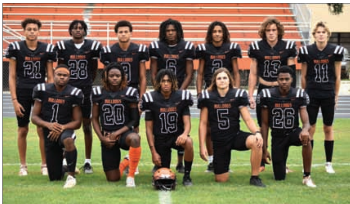
The Zephyrhills wide receivers lined up for a group photo on media day.