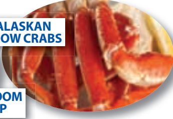
ALASKAN SNOW CRABS