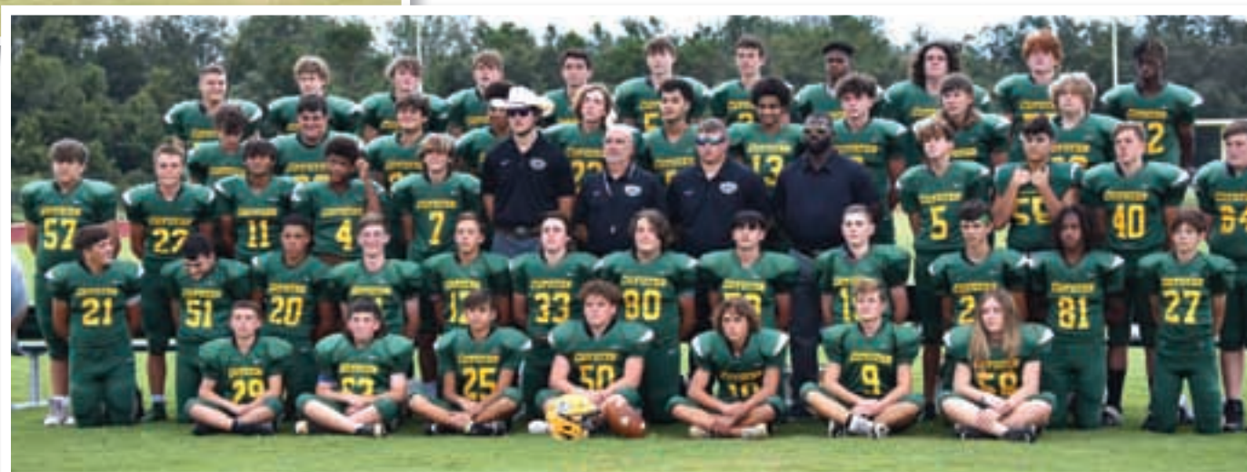
Cypress Creek Coyetes junior varsity football team.