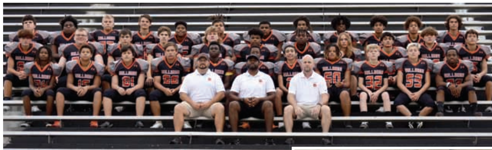
Zephyrhills Bulldog junior varsity football team.