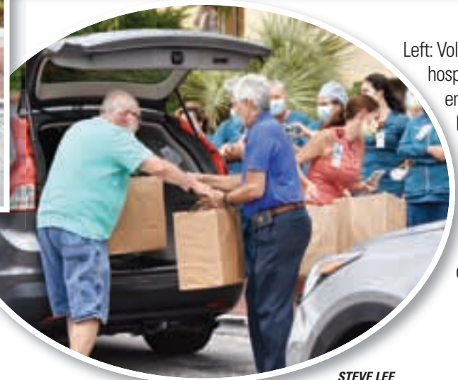
Left: Volunteers and hospital staff employees took bags of food donated from three local restaurants for health care workers.