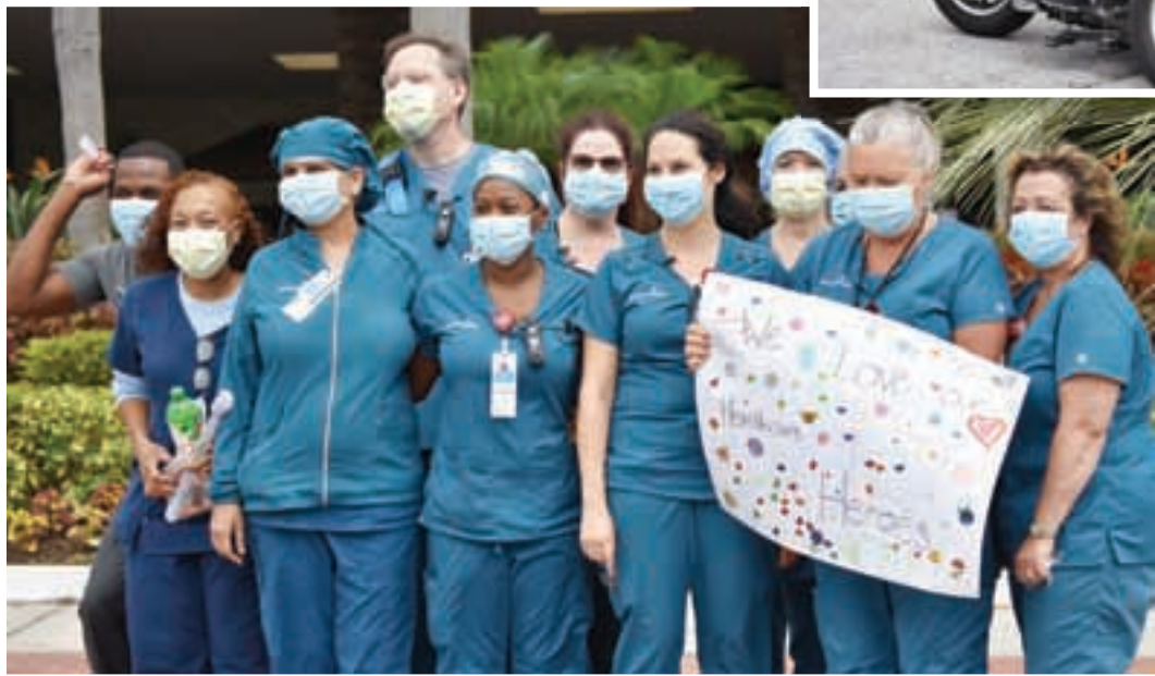
Left: Several health care workers gathered out front to watch the parade. Some held a sign made by well-wishers.