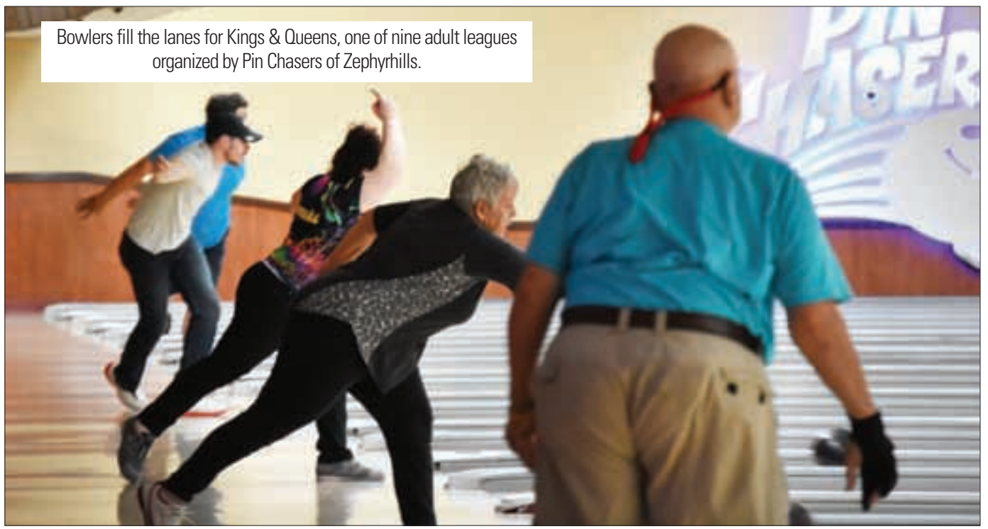
Bowlers fill the lanes for Kings & Queens, one of nine adult leagues organized by Pin Chasers of Zephyrhills.