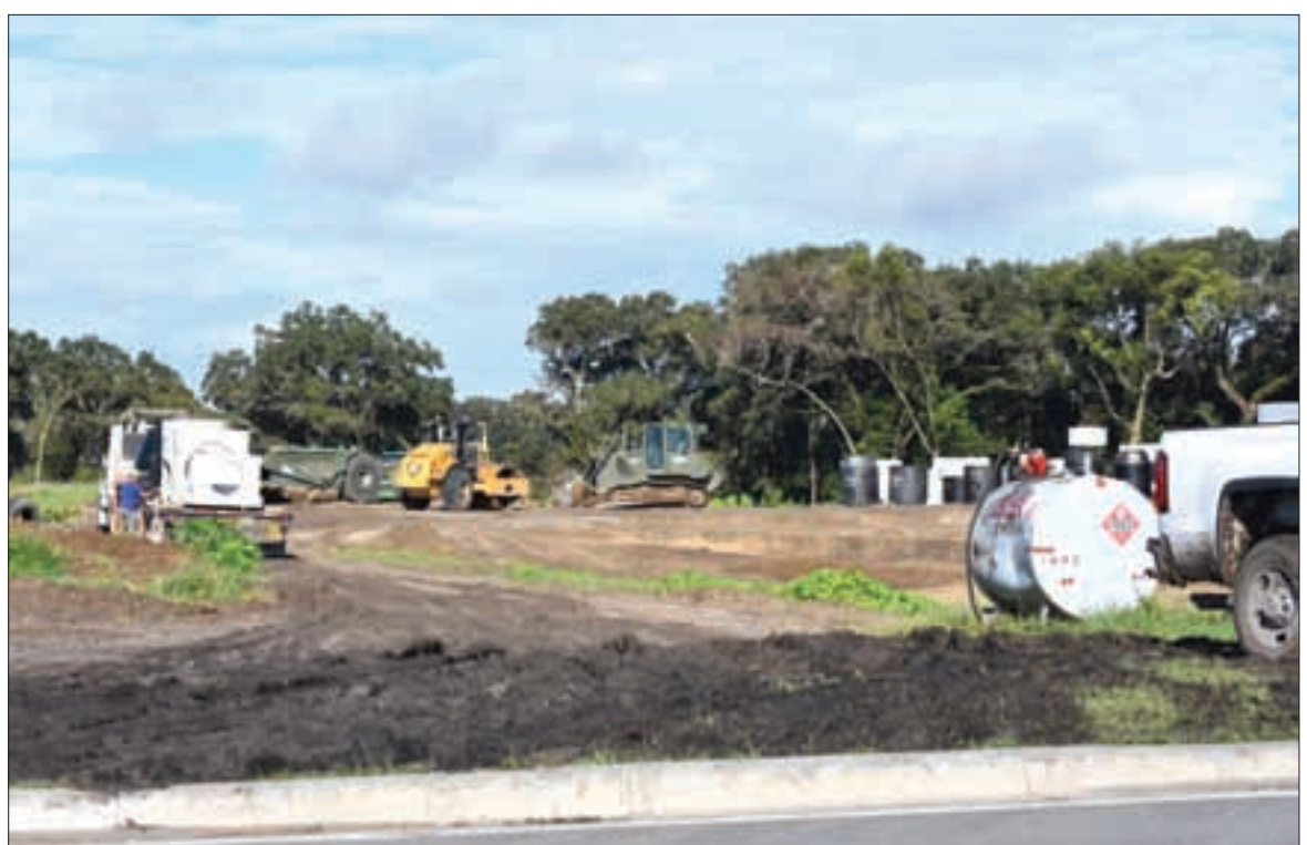
Work along Simons Road continues. That road will eventually be connected to Fort King Road.