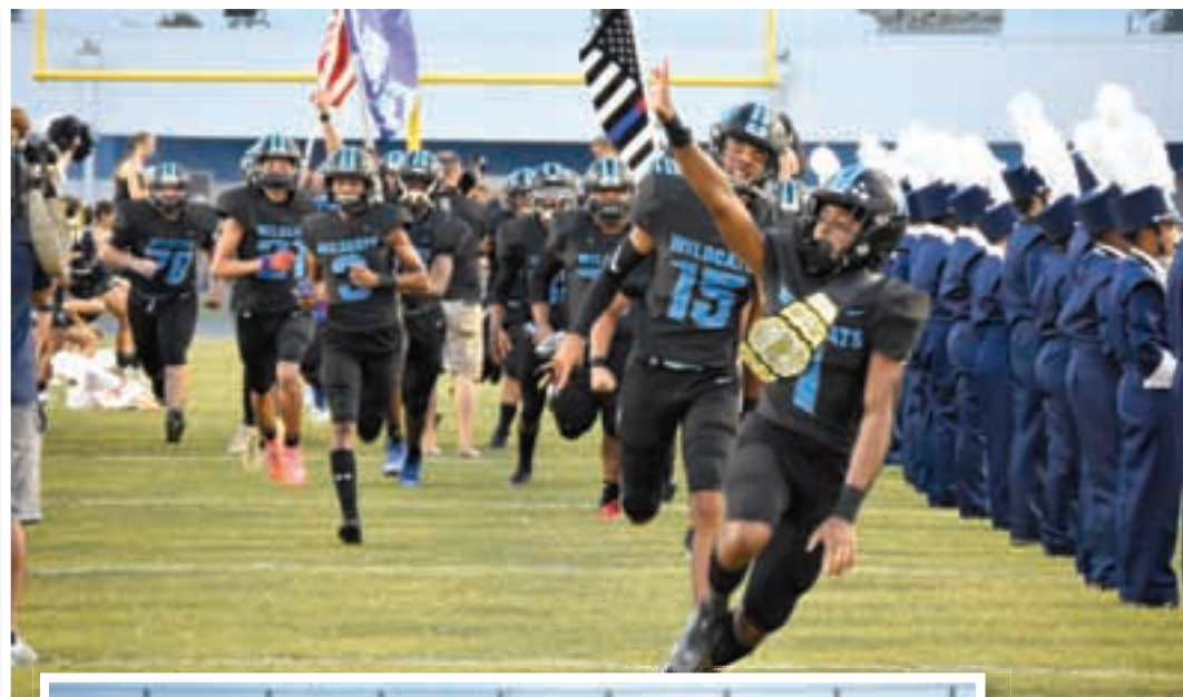
Below: The Wildcats ran out onto the field before last Friday night's home game against Class 5A, District 9 rival Zephyrhills at Wildcat Stadium.