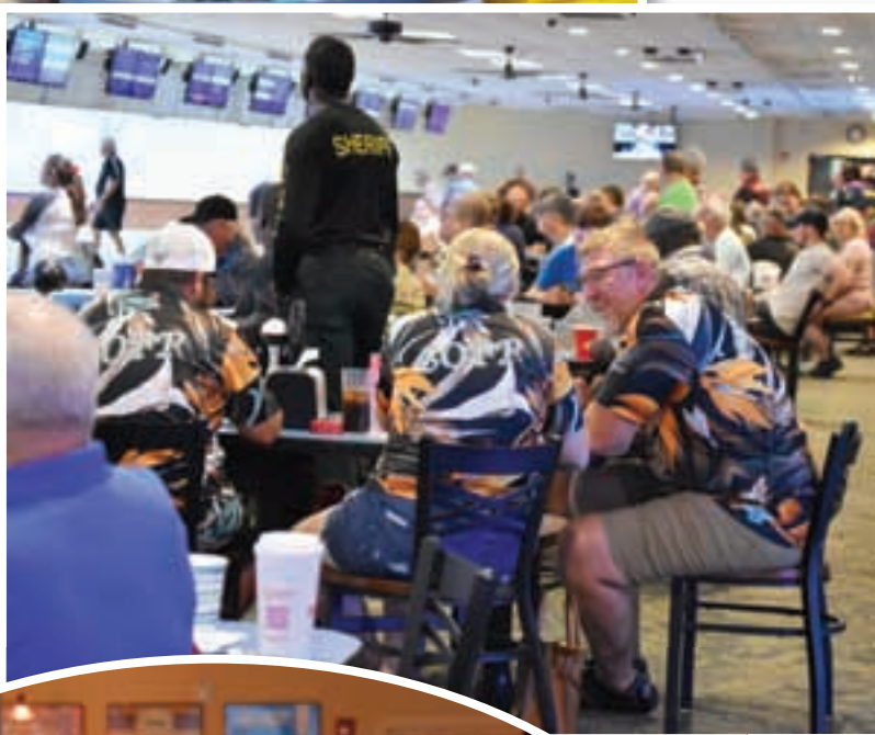
Right: The lanes and tables were filled with bowlers and supporters during Tuesday night's league play at Pin Chasers.