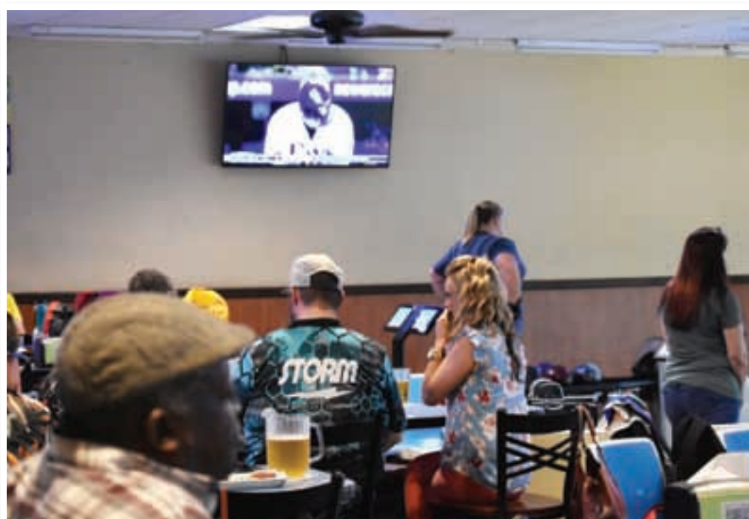
Above: During Tuesday night's mixed league bowling competition at Pin Chasers, some Tampa Bay Rays fans kept track of the American League East battle against the Toronto Blue Jays.

While there have not been nearly as many tournaments as in previous years at Pin Chasers there is a special one coming up. Boy Scout Troop 117 of Zephyrhills is hosting a tournament there on Oct. 9. It will benefit Wreaths Across America for the Florida National Cemetery in Bushnell.