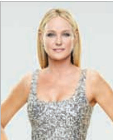
Sharon Case plays "Sharon" on "The Young and the Restless."

THE BOLD AND THE BEAUTIFUL Quinn and Carter gave in to their passion. Steffy and Finn reconnected in the bedroom. Shauna was shocked by Quinn's big secret. Brooke and Katie questioned Quinn's intentions with Eric. Later, Eric covered for Quinn with a concerned Katie. Ridge engaged Justin with an undercover assignment. Hope, Thomas and Douglas spent time together as a family. Wait to see: Paris has an epiphany about her living arrangement with Steffy and Finn. Ridge and Eric each keep a secret from the other. Steffy fumes when Sheila makes an unexpected visit.