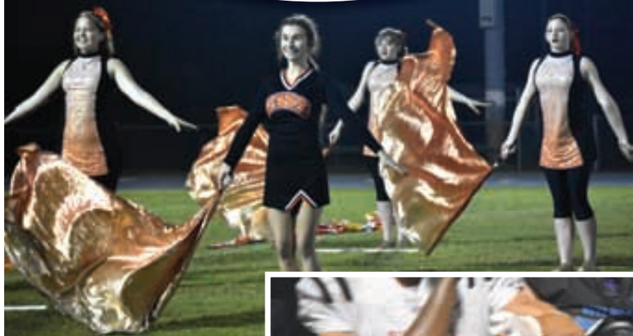
Above: The Zephyrhills Color Guard joined that school's band, which is shown below, during a halftime routine.