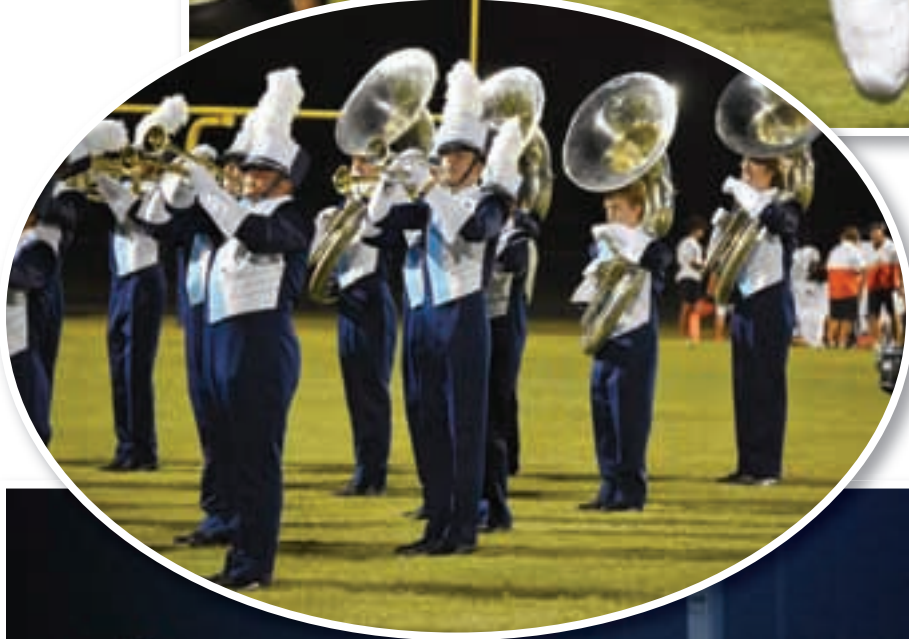
Left: The Wesley Chapel Marching Band went through various formations while members played their instruments during a halftime show at Wildcat Stadium.