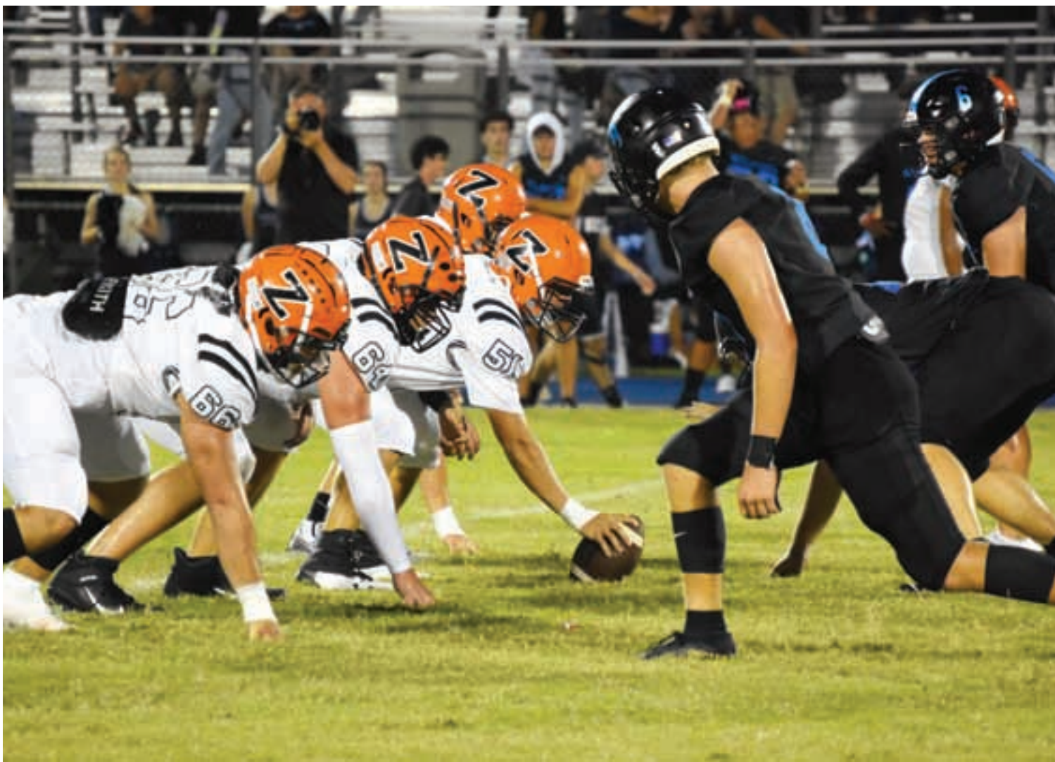
The Zephyrhills offense gets set to run a play against the Wesley Chapel defense in last Friday night's pivotal district matchup at Wildcat Stadium.