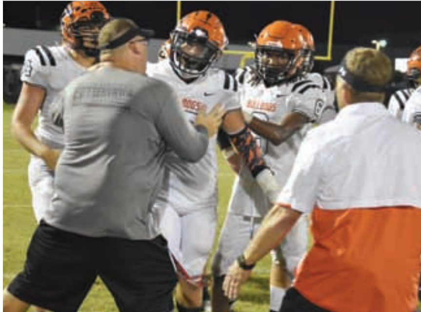
Left: The Zephyrhills defense comes in to meet with assistant coaches during a water break in the first half of last Friday's win over Wesley Chapel.