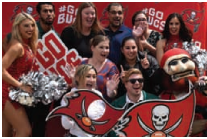
Above: Members of Saint Leo University's admissions team celebrate with Tampa Bay Buccaneers Cheerleaders at a kickoff event to mark the university being the exclusive educational partner of the Bucs.

The Tampa Bay Buccaneers organization will benefit as the university has signed a preferred partnership agreement with the Buccaneers that will offer a tuition discount to all of the organization's staff who wish to pursue a degree at Saint Leo.