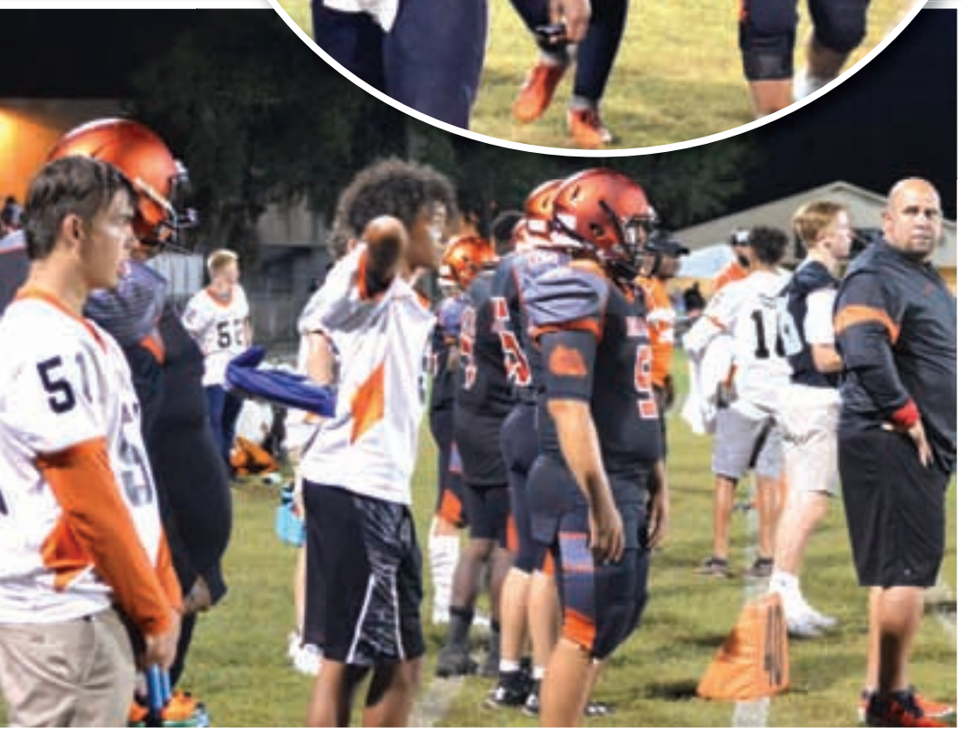
Above: Coaches, varsity football players and a few members of the junior varsity team who helped out as ballboys during last Friday's game, express signs of despair as the clock winds down during the loss.