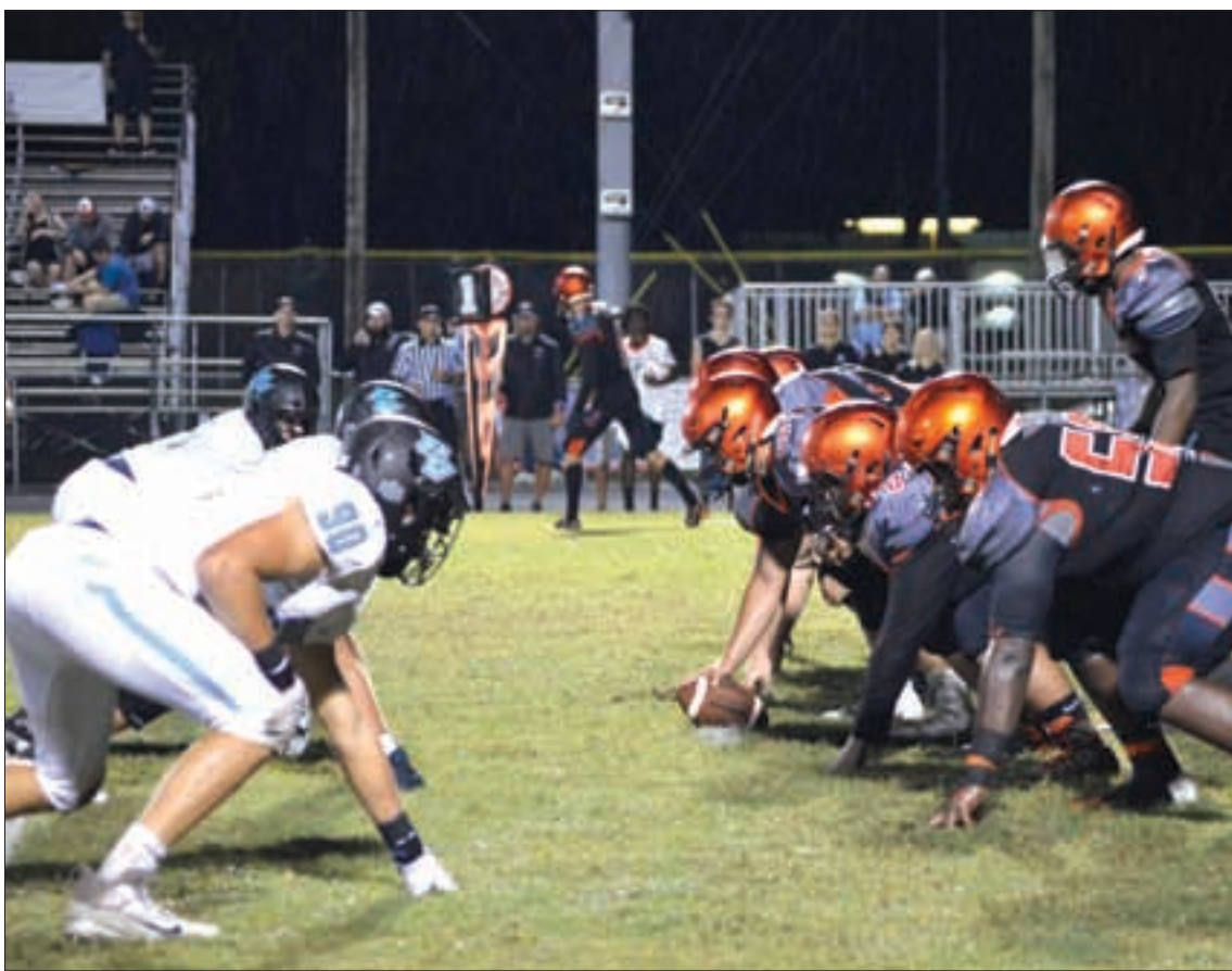
The Zephyrhills offense lines up against the Ponte Vedra defense before a play in the second quarter of last Friday night's high school football game at Bulldog Stadium. The home team's offense struggled all night.