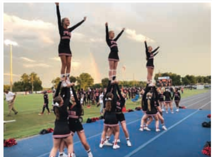
Left: The Pirate cheerleaders perform a lift with a rainbow backdrop during Friday's home opener against Sunlake.