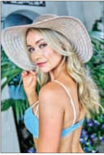
Katrina Bowden stars as "Flo" on "The Bold and The Beautiful."