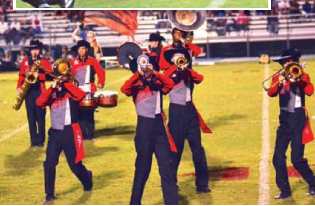
Above: The Pasco Marching Band gave their best show on Friday at halftime.