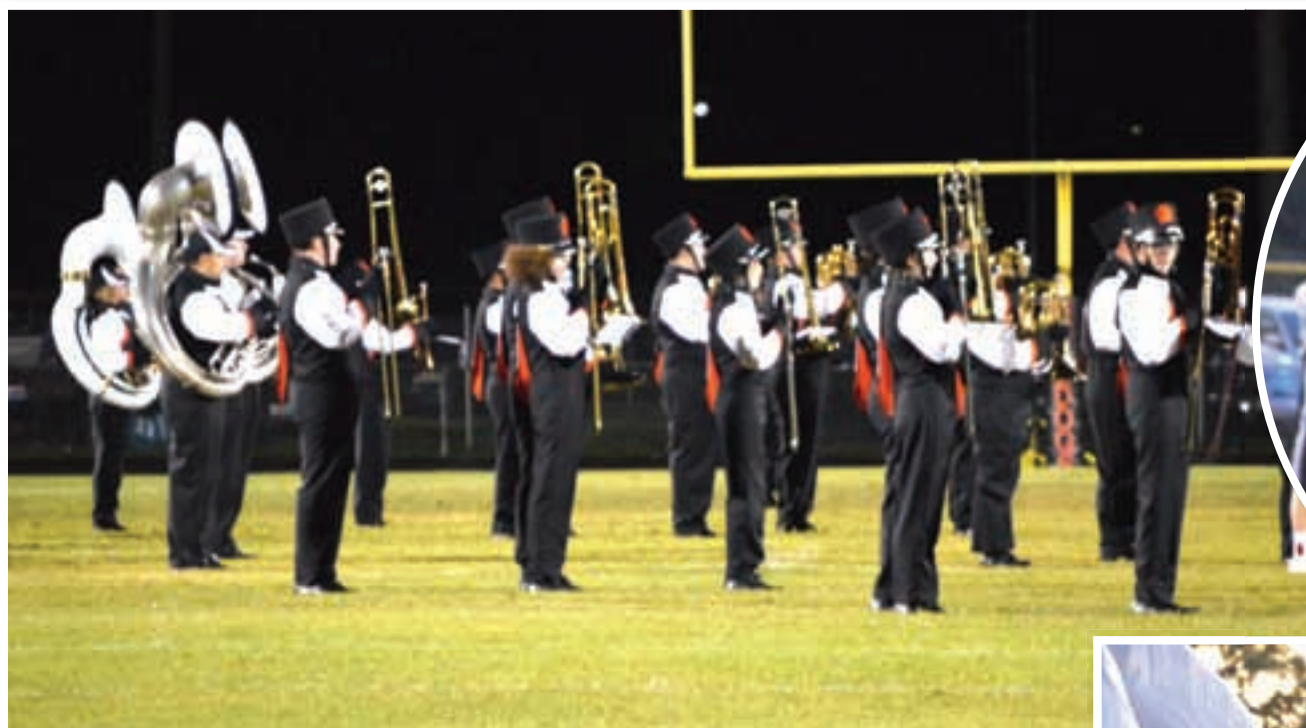
Above: On a rain-drenched night at Bulldog Stadium, the Zephyrhills High Marching Band took the field at halftime to entertain the home crowd.