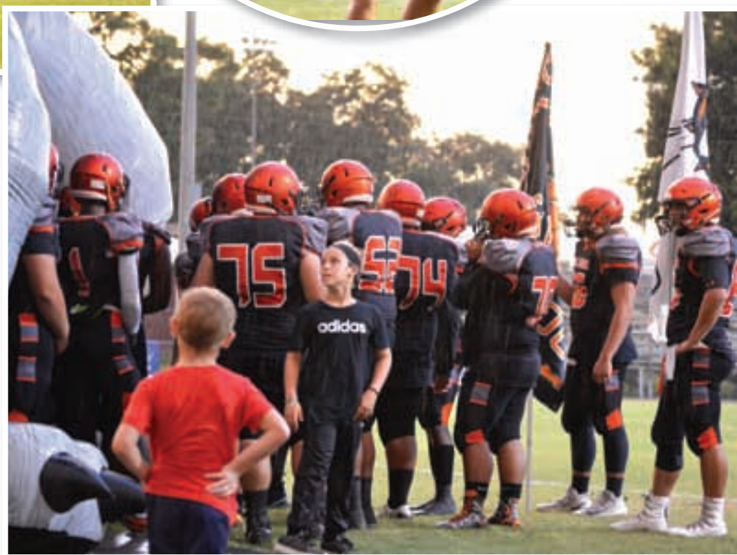
Above: Players wait to take the field during a downpour.