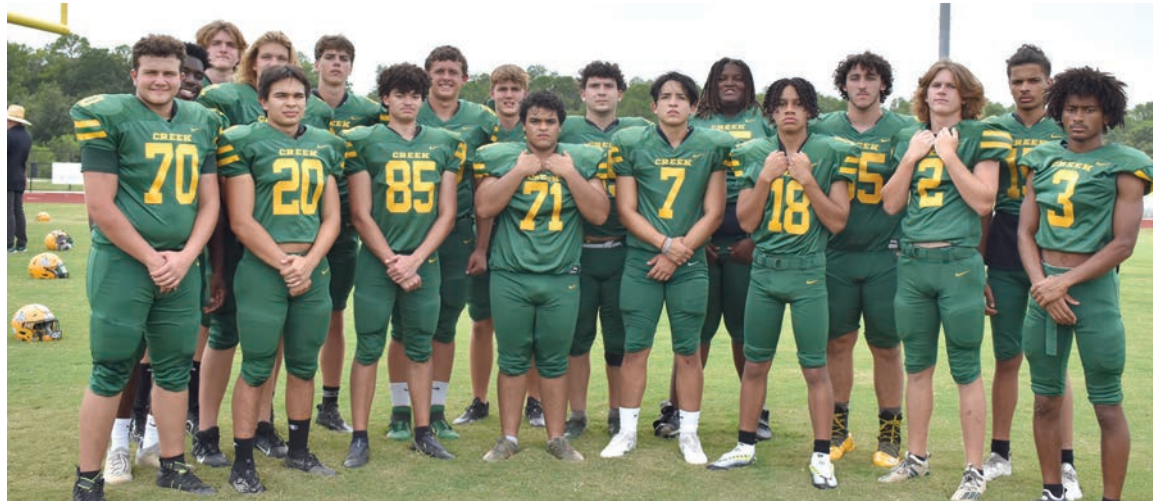
The Cypress Creek seniors are shown here.