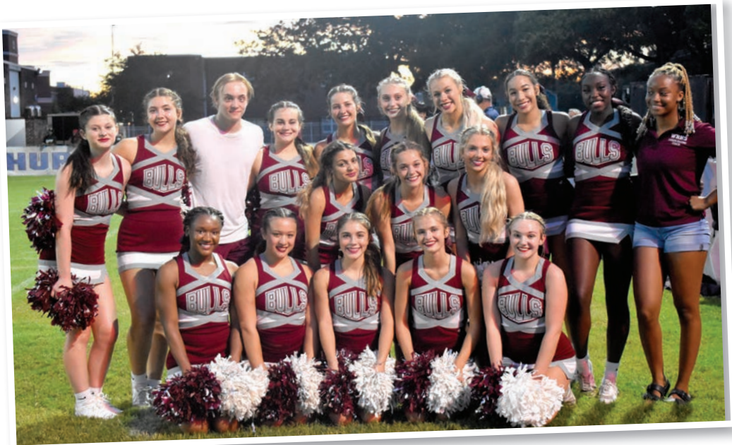
Wiregrass Ranch varsity cheer team