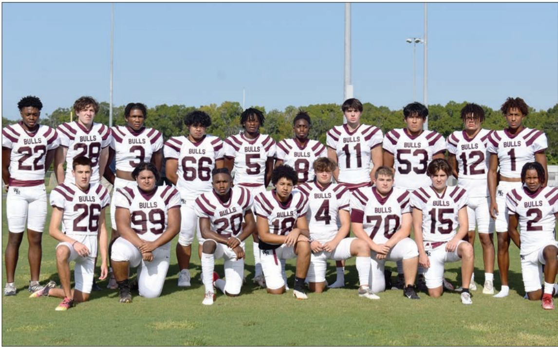
Wiregrass Ranch seniors get together for a photo on the field.