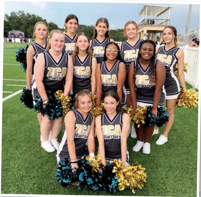
Zephyrhills Christian Academy varsity cheer team