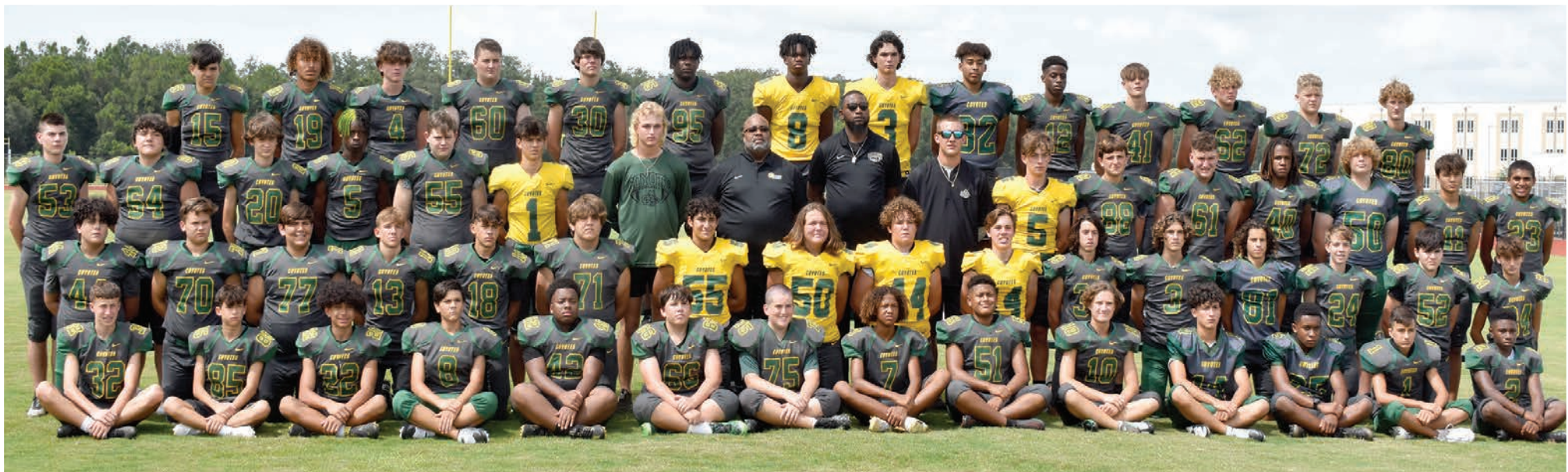
Cypress Creek Coyotes junior varsity football team