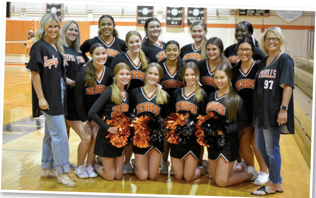
Zephyrhills Bulldog varsity cheer team