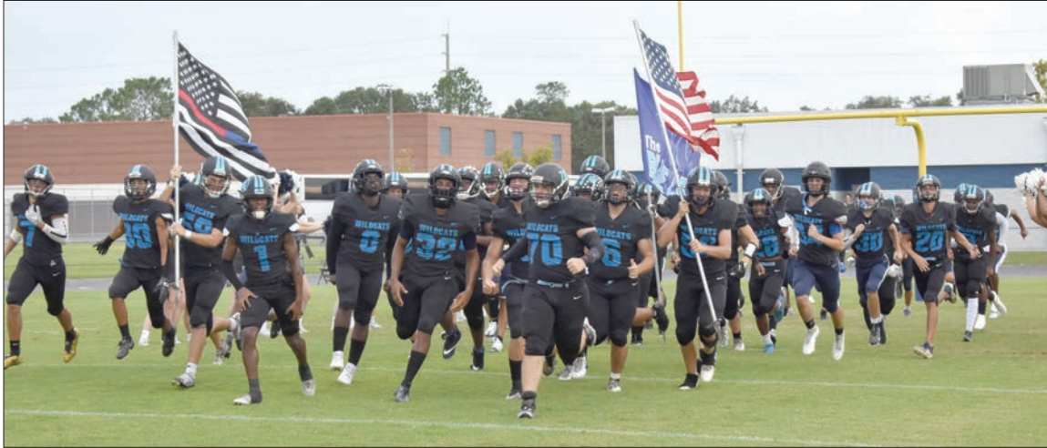
The Wildcats run out onto the field before a home preseason game.