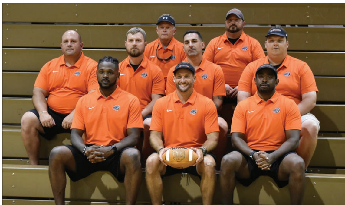
The Zephyrhills coaching staff sits in the stands for a group shot.