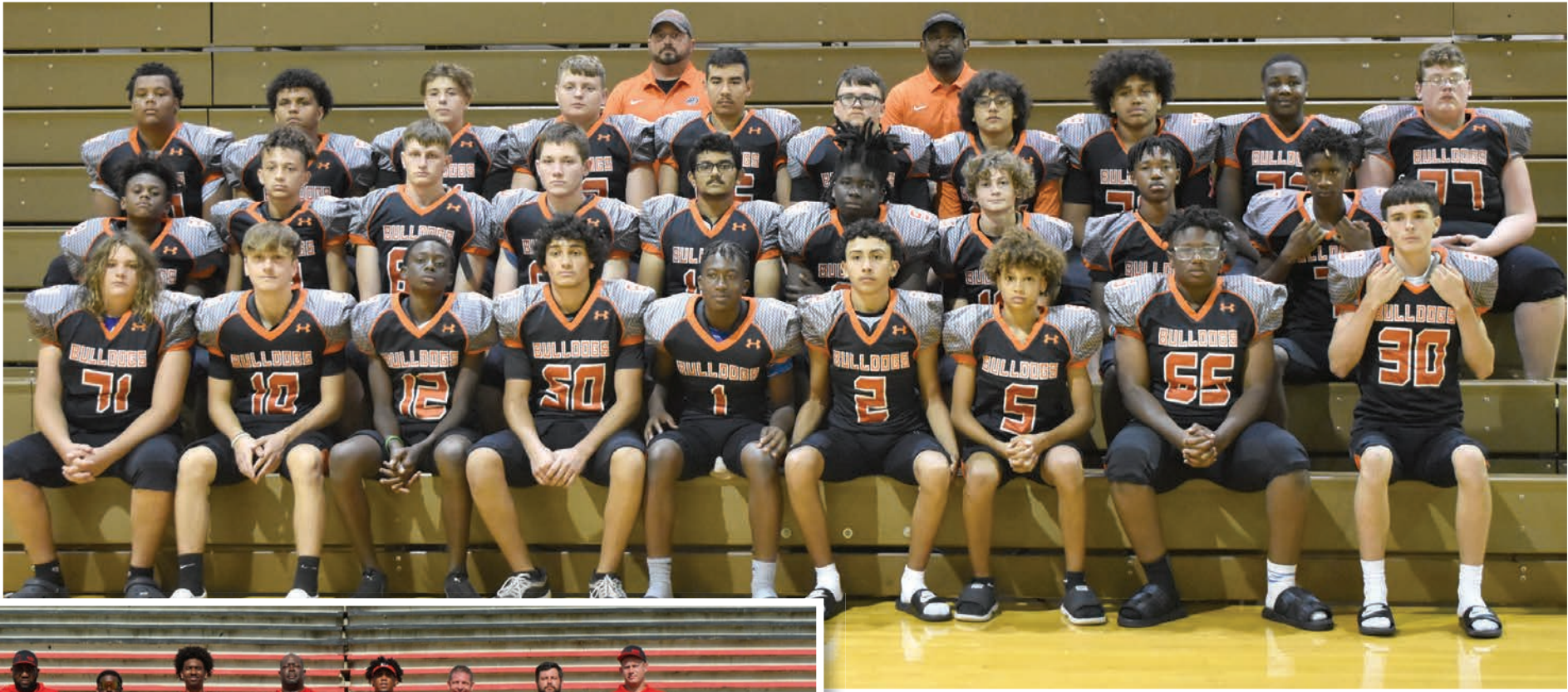
Zephyrhills Bulldog junior varsity football team