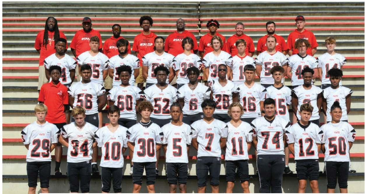
Pasco Pirates junior varsity football team