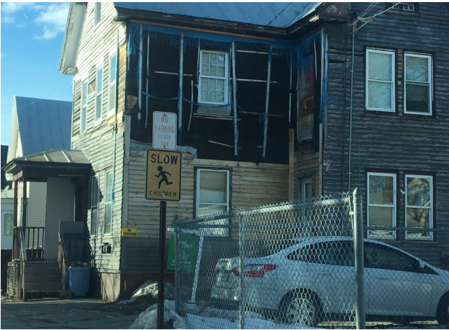
Figure 1: 3 Carrean Street March, 2024

WCLT has purchased a two-unit home at 3 Carrean Street. The house will be the third residential property we have purchased and renovated within the seven acres developed by the Milliken family of Waterville and Bangor in the late 19th century. We also have an active home repair program for this same area. In 2020 WCLT's focus on this neighborhood was recognized with an award from the U.S. Mayors Conference.