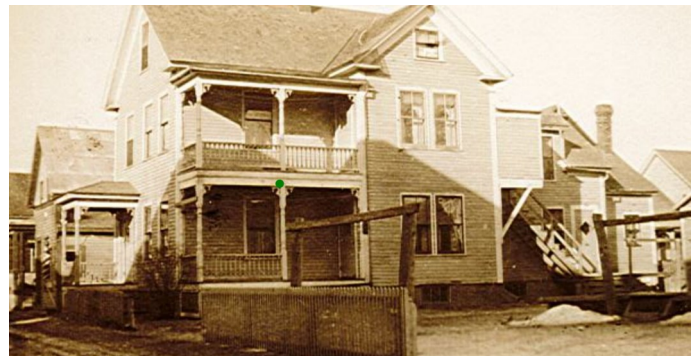
Figure 2: 3 Carrean Street as it was in the 1930's

We are now developing a plan for the renovations and always appreciate new ideas! If you enjoy any aspect of building, we welcome volunteers.