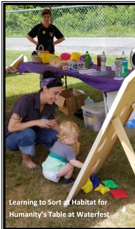
Learning to Sort at Habitat for Humanity's Table at Waterfest

Over 100 neighbors and volunteers gathered at the inaugural Waterfest on June 24th at Couture Field.