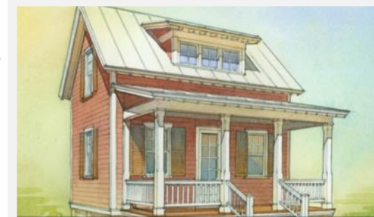
Home Designed by Eric Moser; similar plans can be found on Houseplans.com

The new home will be architecturally compatible with the existing homes in the South End. Below is an example of a small home that is similar to others in the neighborhood. (NOTE: There's time for you to provide your ideas!) ) We expect that the house will be less than 1000 SF, built comfortably for one or two adults and a second bedroom or loft for a guest or child. Because there will be a great view of the Kennebec River we plan on including a porch or deck on the back of the house for outdoor living.