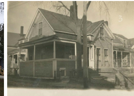
3 Moor Street: Circa 1935

but, as the house is so close to the road, it seems impractical, particularly during winters. The new porch off the kitchen provides the perfect place to enjoy a morning coffee.