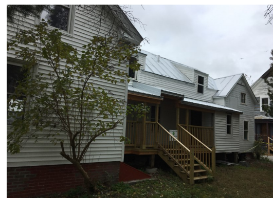
3 Moor: 2020

The house appears to have gained its shed by 1889. The large store/home across Mercier Street on the 1889 map is now a children's park, owned by the city. The porch that wrapped around two sides would have been a nice feature to restore