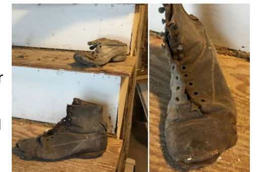
Shoes found at 3 Moor Street