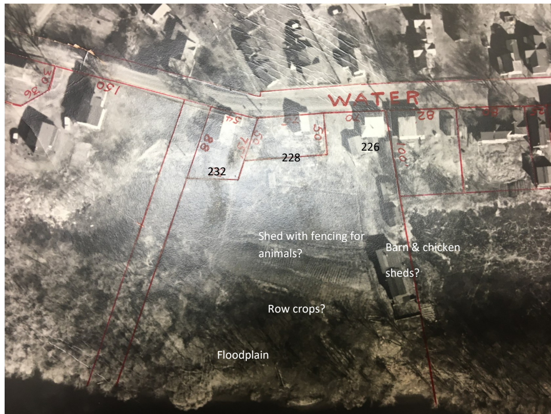
1959 Soil and Water Conservation Service Aerial

The agricultural history of the property became apparent during deed research of the 1860's Lashus (LaChance) farm and, finding a 1959 aerial photograph that shows farm barns, chicken sheds (as remembered by local residents), and row crops along the edge of the river's slope.