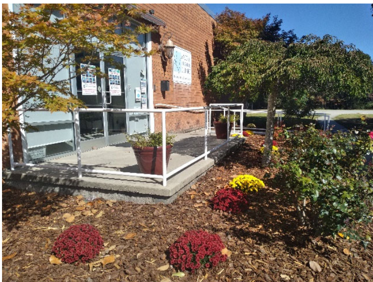
Autumn mums add a spot of color to the Clinic's exterior, thanks to Morales Landscaping