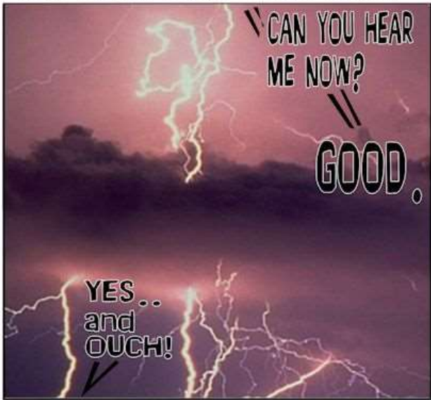
Then the Lord answered Job from the STORM. Job 38:1