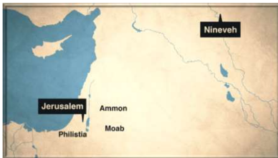
The map above points out the major places mentioned in Zephaniah