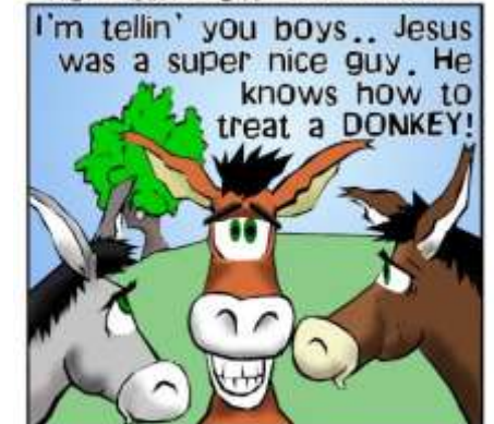
Still two days after Palm Sunday Darryl the Palm Sunday donkey was bragging to the boys.