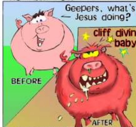
Demons cast into pigs.. Mk 5:1-20, Mt, 9:32 It was kind of a Dr. Piggy & Mr. Hog moment