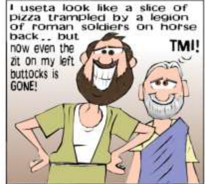
Jesus heals Larry the Leper, and tells him not to tell anyone but report to the priest.. BUT Larry could not help himself. Mk 1:40-45