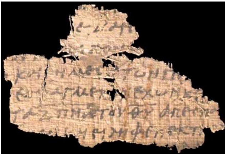
A very old papyrus of Revelation 5:5-8