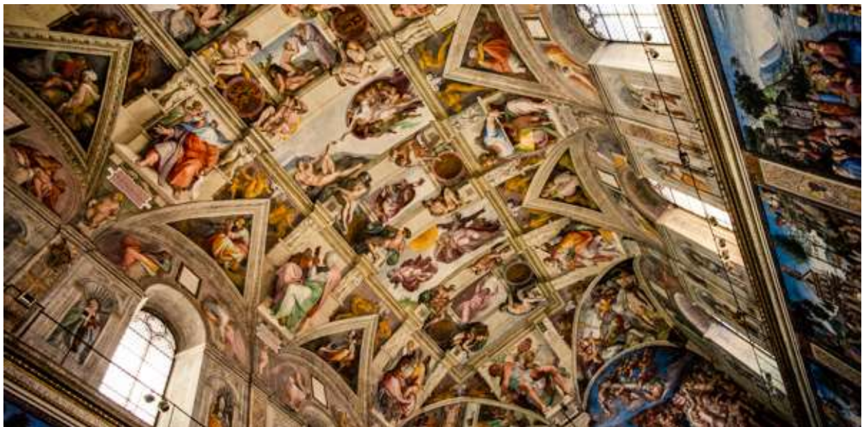
The most famous fresco in the world. The ceiling of the Sistine Chapel.