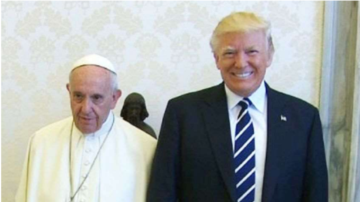
Pope Francis meets President Donald J. Trump. I just couldn't resist.