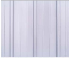
Brilliant White (14)