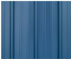
Gallery Blue (6)