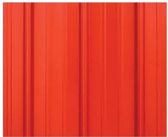
Crimson Red (3)