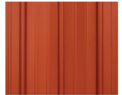
Rustic Red (9)