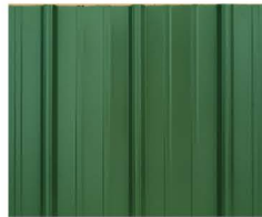
Hunter Green (7)