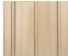
Light Stone (10)