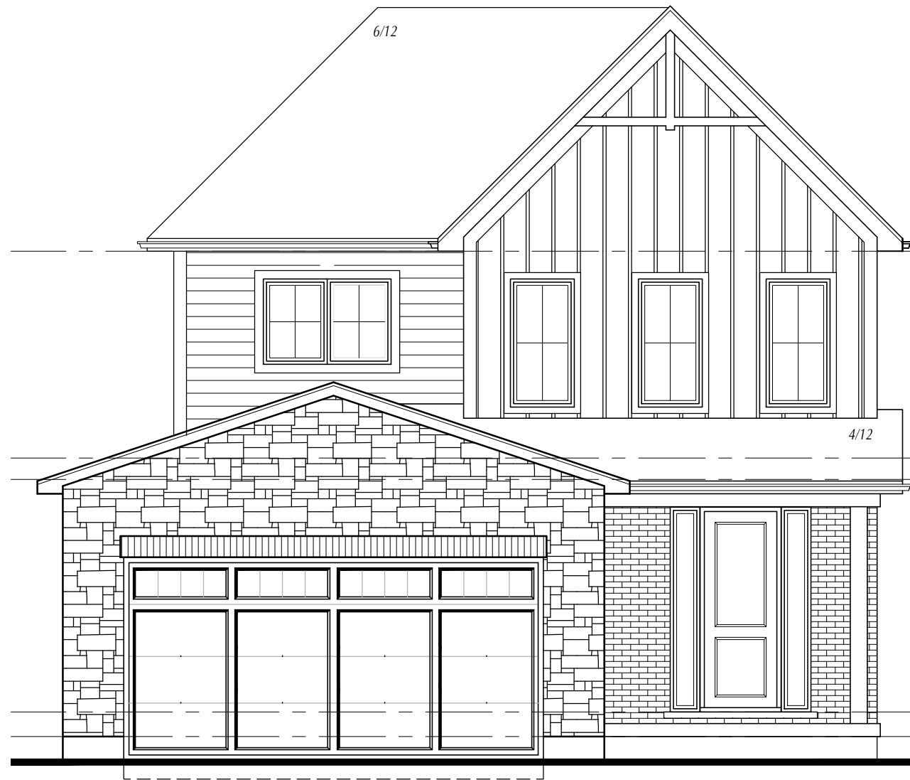
The 1856 Elevation 'A'