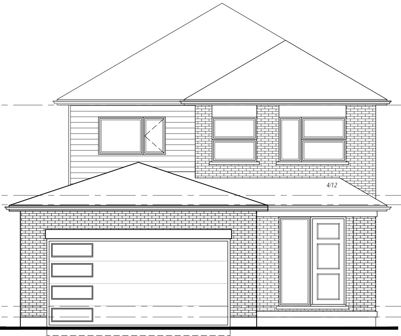
The 1856 Elevation 'B'