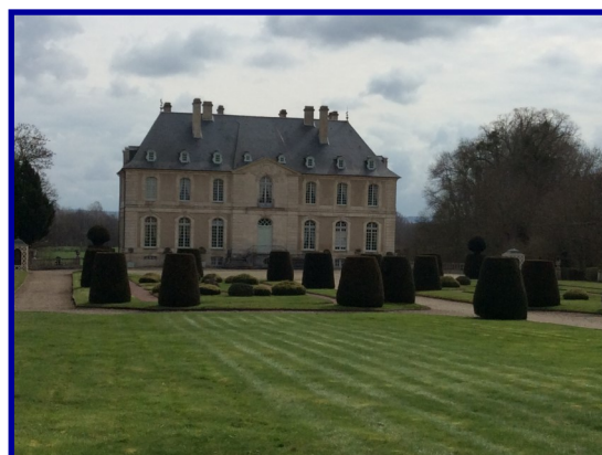
Chateau de Vendevre