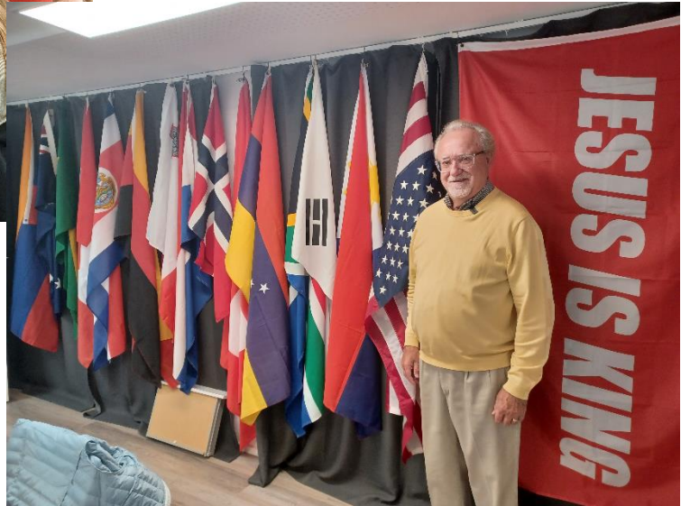
RIGHT Here, I'm standing by the display of the flags from the various nations of the students at this BTS I.

the creation and the flood stories and their relationship to other ancient Near Eastern versions, the date of the exodus, the emergence of Israel in the land of Canaan, and the moral problem of the wars against the Canaanites. Pretty exciting stuff (well, maybe for nerds like me)!