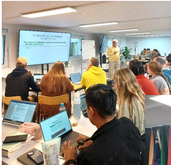
ABOVE Classroom shot of one of my lectures.