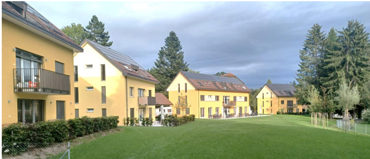
This is part of the University of the Nations campus in Lausanne.

The fall season has been full! I began in September with another Bible Teachers School, similar to the ones I've done in Mexico and Colombia, but this one in Lausanne, Switzerland. This is a school oriented toward Bible teachers who teach in the Discipleship Bible Schools around the world to provide them with three weeks of instruction in teaching strategies as well as coverage of some of the deeper content in areas of the Bible. These BTS's are set up in a three-year cycle, Year 1 covering Adam to David, Year 2 covering Kings and Prophets, and Year 3 covering the New Testament. In Lausanne, I had teachers from several nations, including Armenia, Malta, Norway, Netherlands, Germany, Venezuela, Brazil, South Korea, Costa Rica, South Africa, and Canada and the USA.