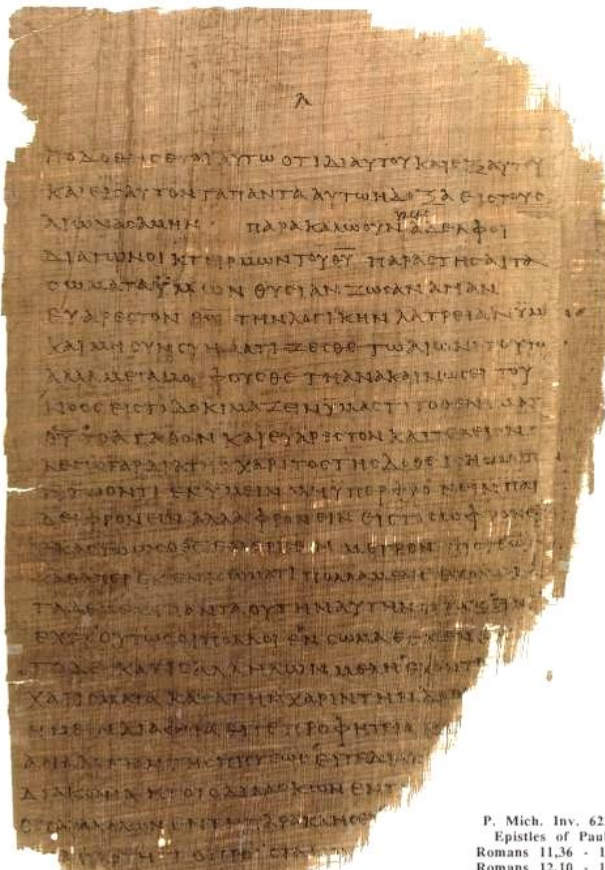
P46, the earliest copy of the Roman letter containing Romans 11:36—12:8 and dating to ca. AD 200.

The earliest Christian literature begins within just a few years of the death of Jesus. It starts in about AD 49 with a letter composed by the Jerusalem church to the new Gentile congregations, a letter resolving a problem in which some Jews were urging that Gentiles who came to faith in Christ had to become Jews in order to become Christians (Ac. 15:1, 5, 23-29). This letter from the apostles negated this point of view and was carried northward by Paul and some other Christian