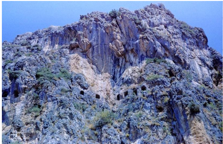
Ancient church at Antioch, Syria (modern Antakya, Turkey) in a cave above the city. Peter is believed to have preached here.

Many New Testament appearances of the word ἐκκλησία (= church) refer to individual congregations in the various towns and cities. It is used as a plural to refer to the congregations collectively (Ac. 15:41; 16:5; Ro. 16:4, etc.), and it is used as a singular to refer to some congregation in particular (Ac. 13:1; 18:22; 1 Co. 16:19b). However, a broader use of this term develops to refer to the whole body of Christians in the Roman world. As such, "the church" is a universal term. When Paul speaks of the "church of God" or simply "the church" (1 Co. 10:32; 12:28; 15:9; Ep. 1:22; 3:21, etc.), he is not referring any particular congregation, but rather, to the whole church in the whole world. Later, this would come to be described by the term "catholic" (Greek καθολικός ; Latin catholicus ), meaning universal, which is to say, the whole church. Ignatius of Antioch is the first to use the term "catholic church" in his letter to the Smyrnaeans in about AD 110.