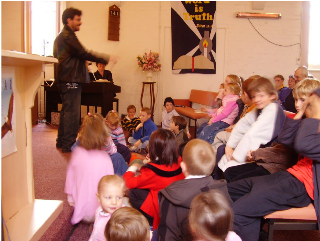
Children enjoying the Children's talk during Morning worship at West Wyalong Community Church