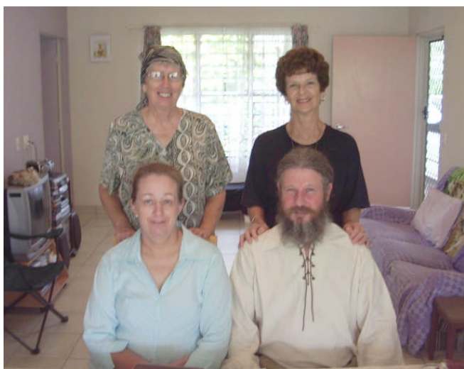
Four of the current Leanyer Christian Fellowship house church members

In the wake of Resolution 84's upheaval we were determined to model our then proposed House Church around Acts 2:42-45 – most especially around verse 42 where: " They continued steadfastly in the Apostle's doctrine and fellowship, and in breaking of bread, and in prayers ".