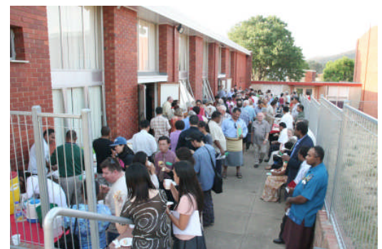
Top Left: Fijian Methodist Choir Top Right: The congregation Middle Left: Papua New Guinea Cultural Group Choir Middle Right: Philippino International Christian Group singer Bottom Left: O'Connor Tongan Choir Bottom Right: Refreshments

Canberra Christian Fellowship's Multicultural Christmas Carol service featured choirs and songs from six Asia-Pacific nations; a talented ensemble of musicians; five carols sung heartily by a large congregation and small gifts to the children present – all to celebrate the birth of our great God and Saviour, Jesus Christ.