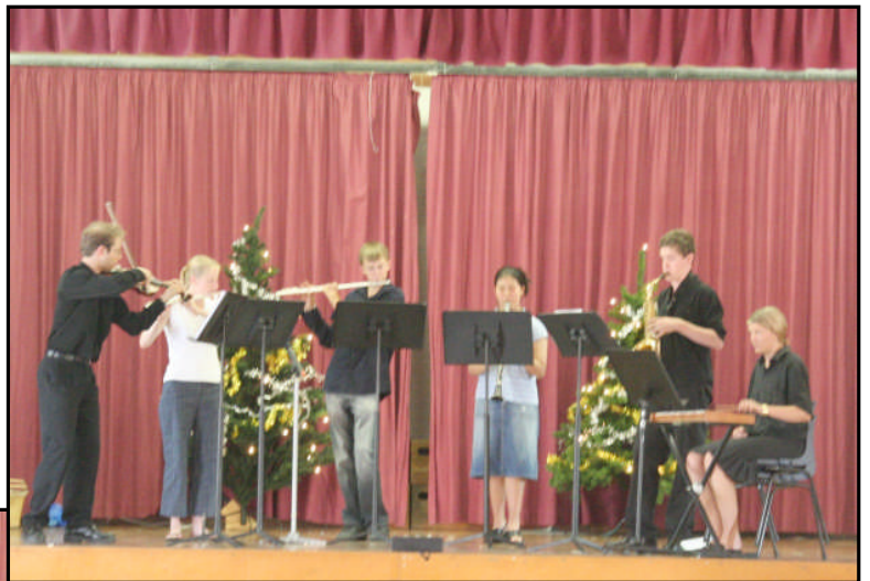
Above: Our musicians (piano not shown)

The carols sung together had a real warmth and power